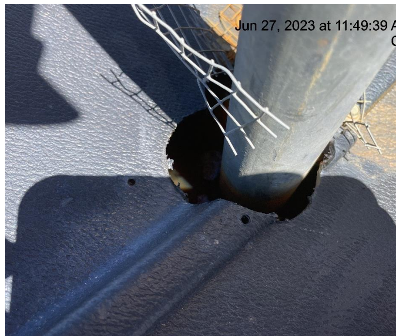
Photo # 2132 Chemical containment full of fluid/failure to maintain chemical BMP's