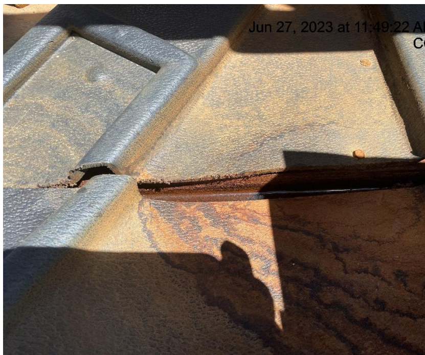
Photo # 2125 Chemical containment full of fluid/failure to maintain chemical BMP's