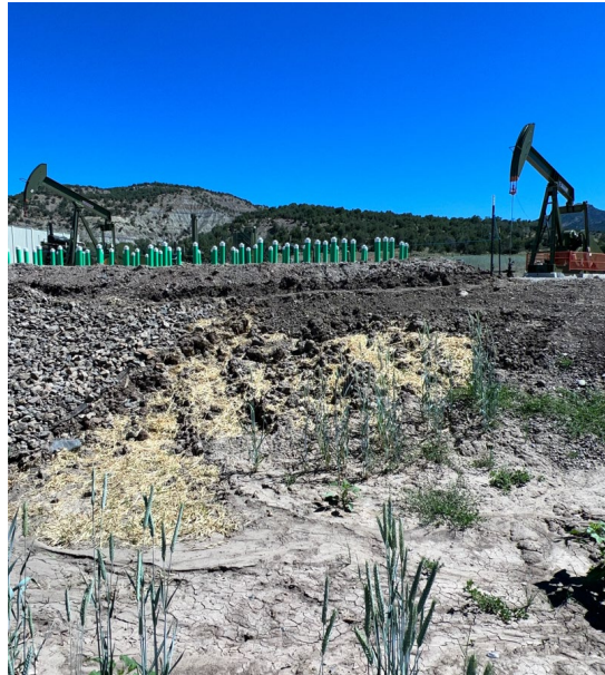
Inspection photo 9. BMPs in place to mitigate erosion. Completed 6/05/2023.