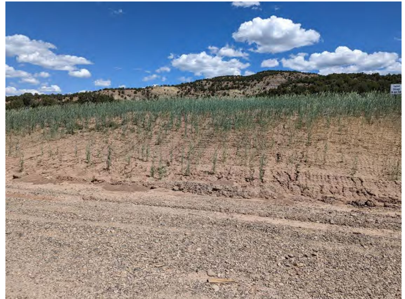
Inspection photo 14. Rilling addressed and BMPs added at top of slope. Completed 6/05/2023.