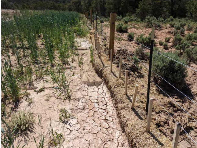
Inspection photo 8. Sediment removed from and around straw bales. Complete 6/05/2023.