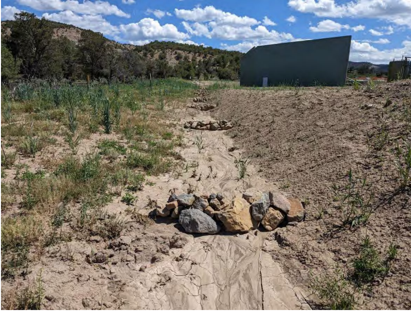
Inspection photo 10. Western swale rock check dams maintained; additional angular rip rap installed. Complete 6/05/2023.