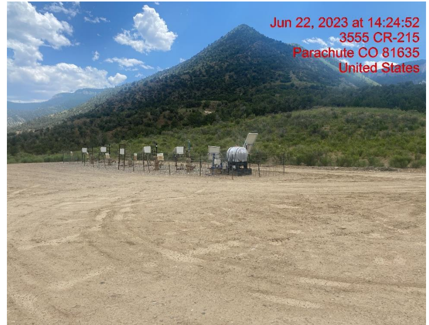
NW Corner of Location – Photo #04745