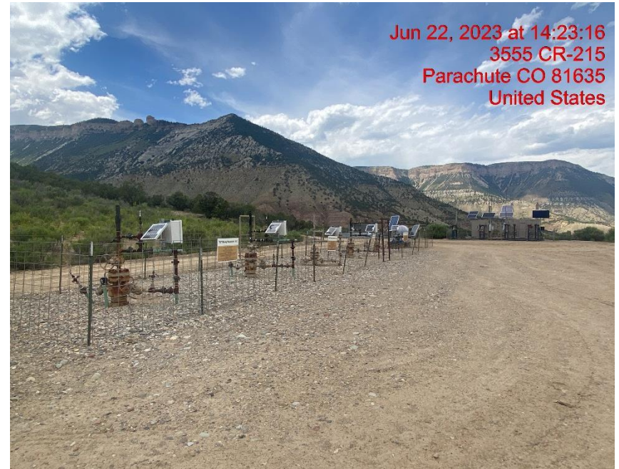
SW Corner of Location – Photo #04741