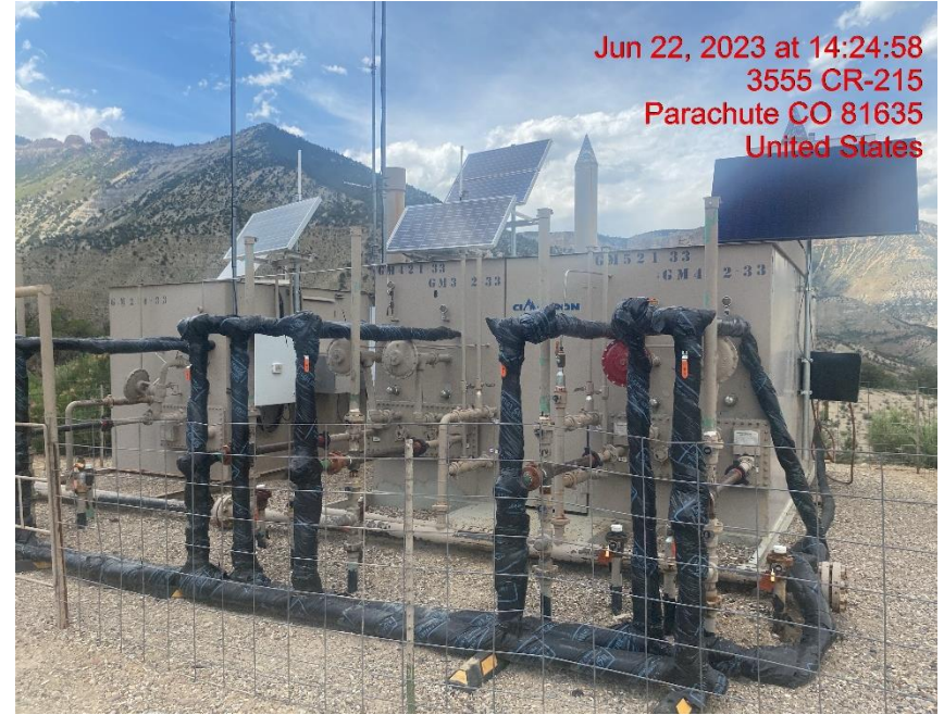
Wellheads – Photo #04743