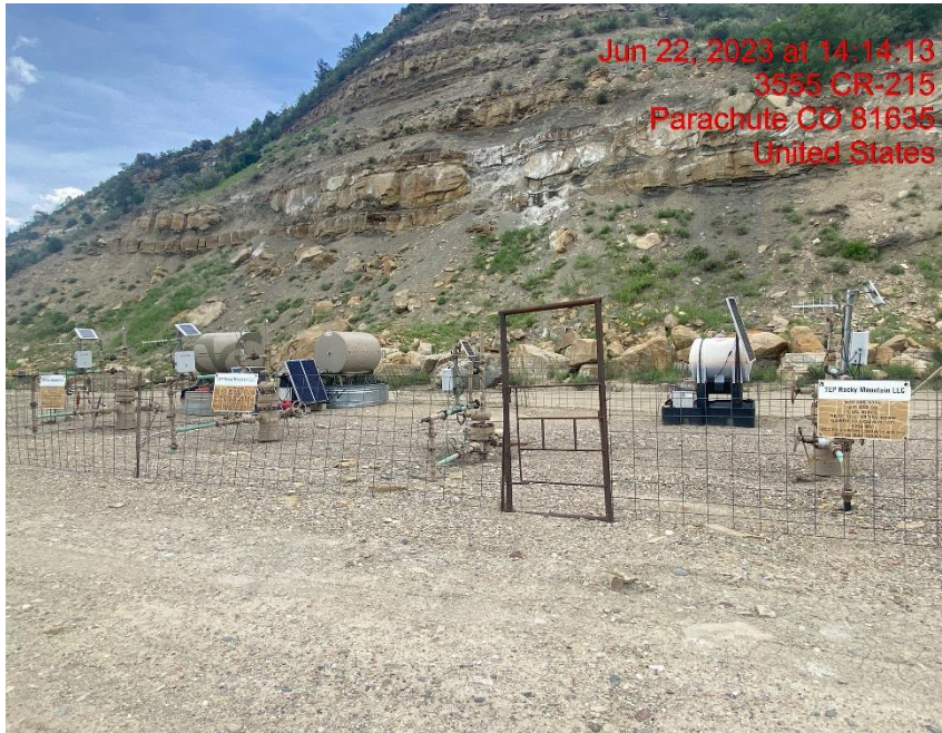
Wellheads – Photo #04729