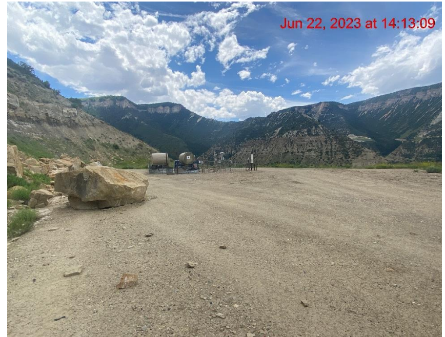
SE Corner of Location – Photo #04726