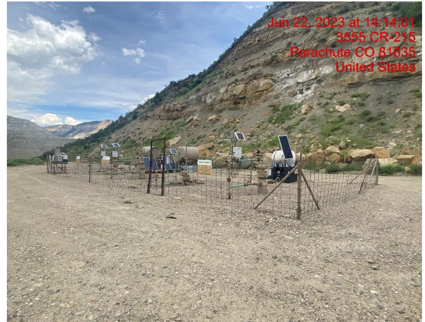
SW Corner of Location – Photo #04727