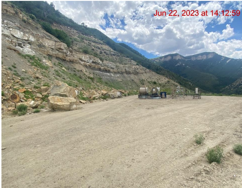
NE Corner of Location – Photo #04725