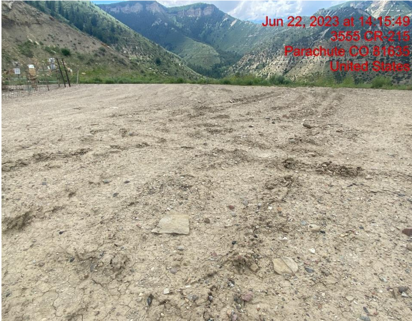
Location Lacks Stabilization – Photo #04736