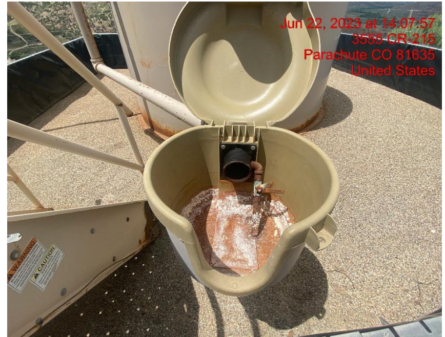
Tank Battery – Photo #04716