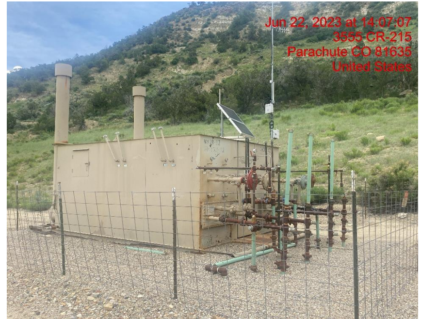
Separators – Photo #04714