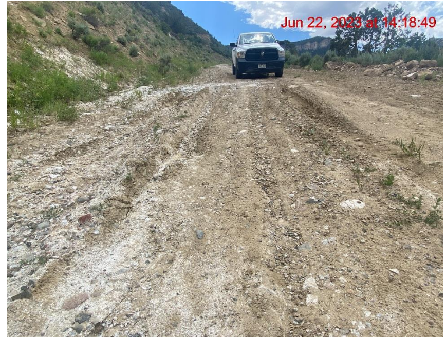
Access Road Lacks Stabilization – Photo #04739