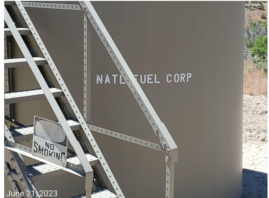
Photo 11: Labeling on tank does not comport with 605 rules; correct operator information and emergency number remains missing from tank.