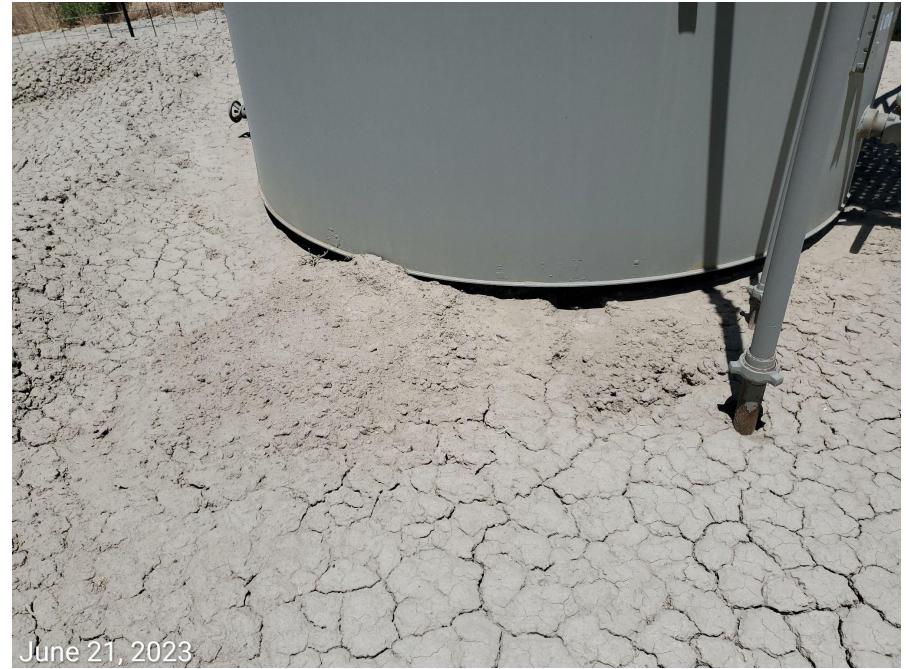
Photo 13: Photos taken from the tank battery on the north end of the Location. Photos example showing wildlife has burrowed into the walls, and the base of the secondary containment BMP. BMP no longer impervious to contain a spill or release.