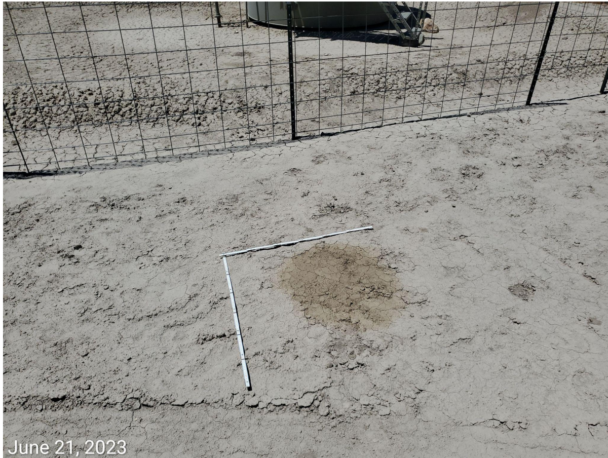
Photo 6: Photo example showing stained soils observed in previous inspections have not been cleaned/removed.