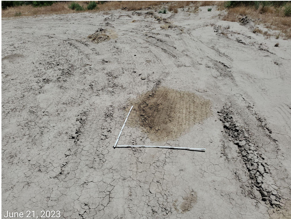
Photo 5: Photo example showing stained soils observed in previous inspections have not been cleaned/removed.