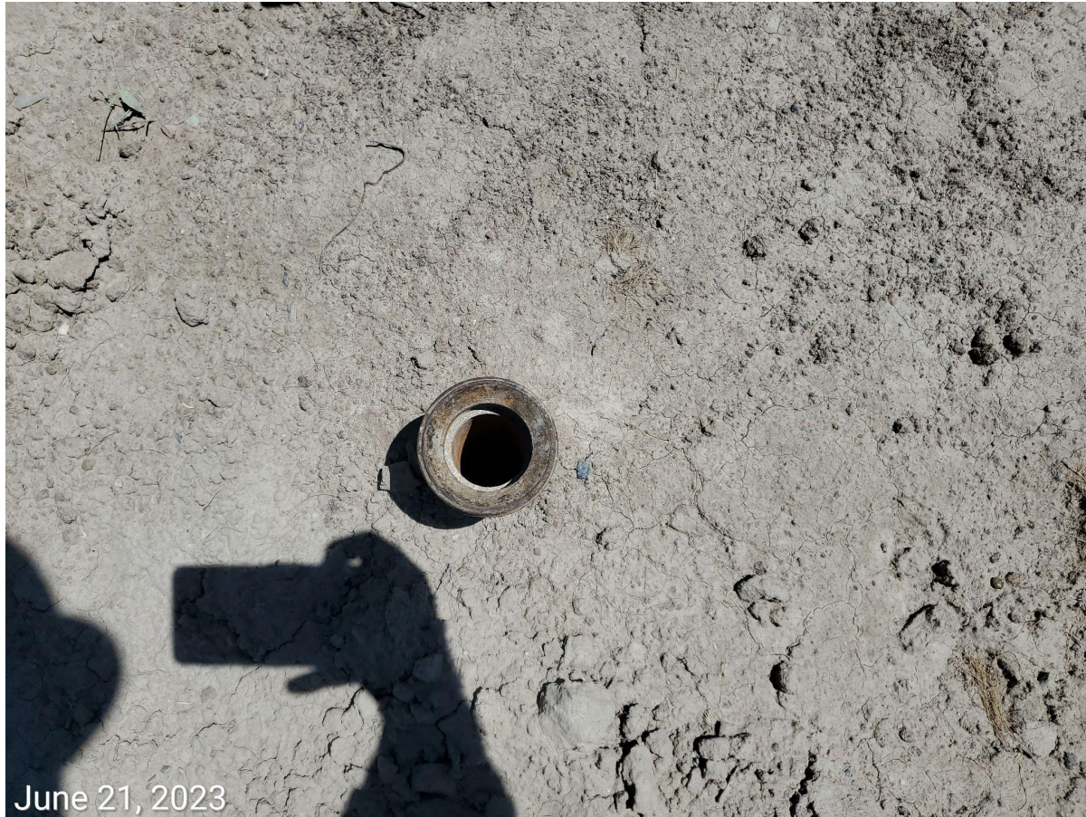
Photo 4: Photo taken from well. Photo shows flowline riser remains open/exposed.