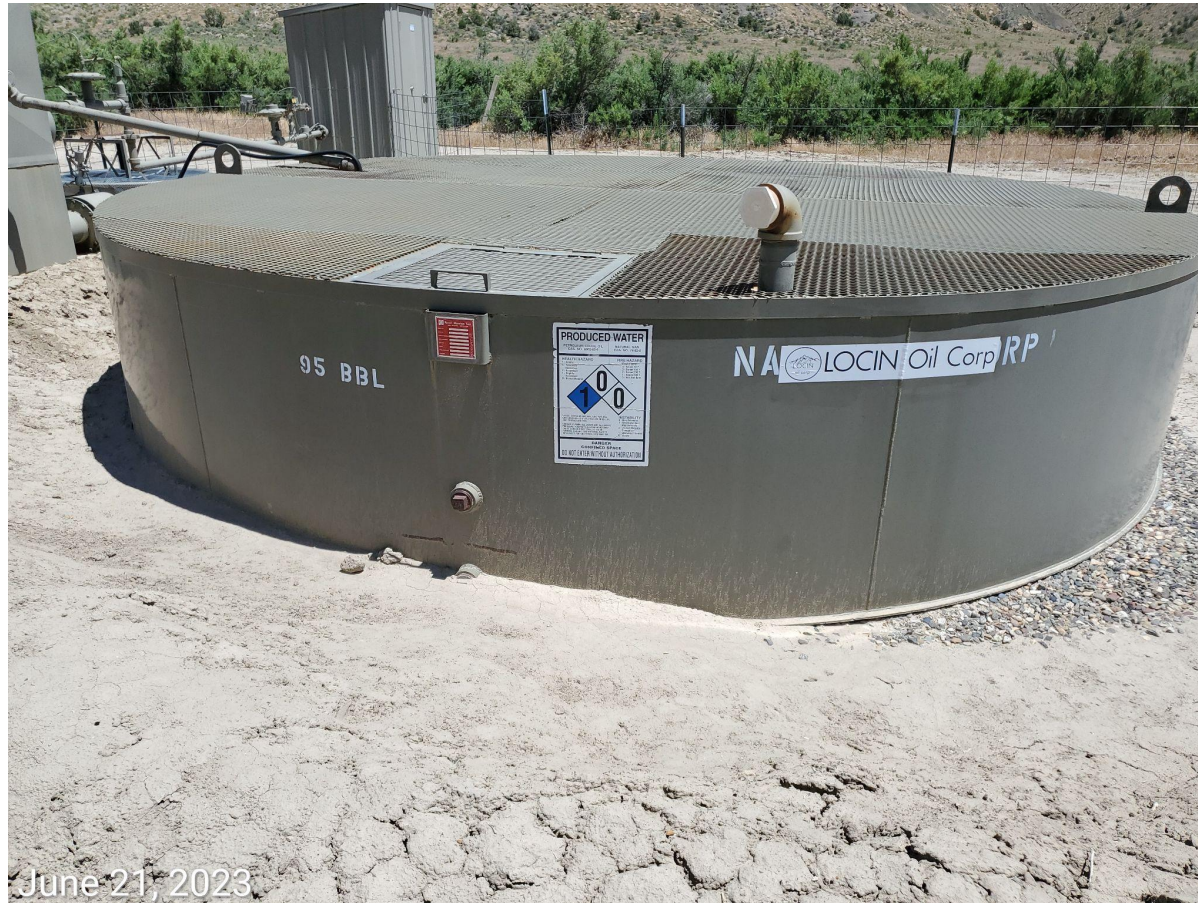
Photo 9: Labeling on tank does not comport with 605 rules- emergency contact number remains missing from tank.