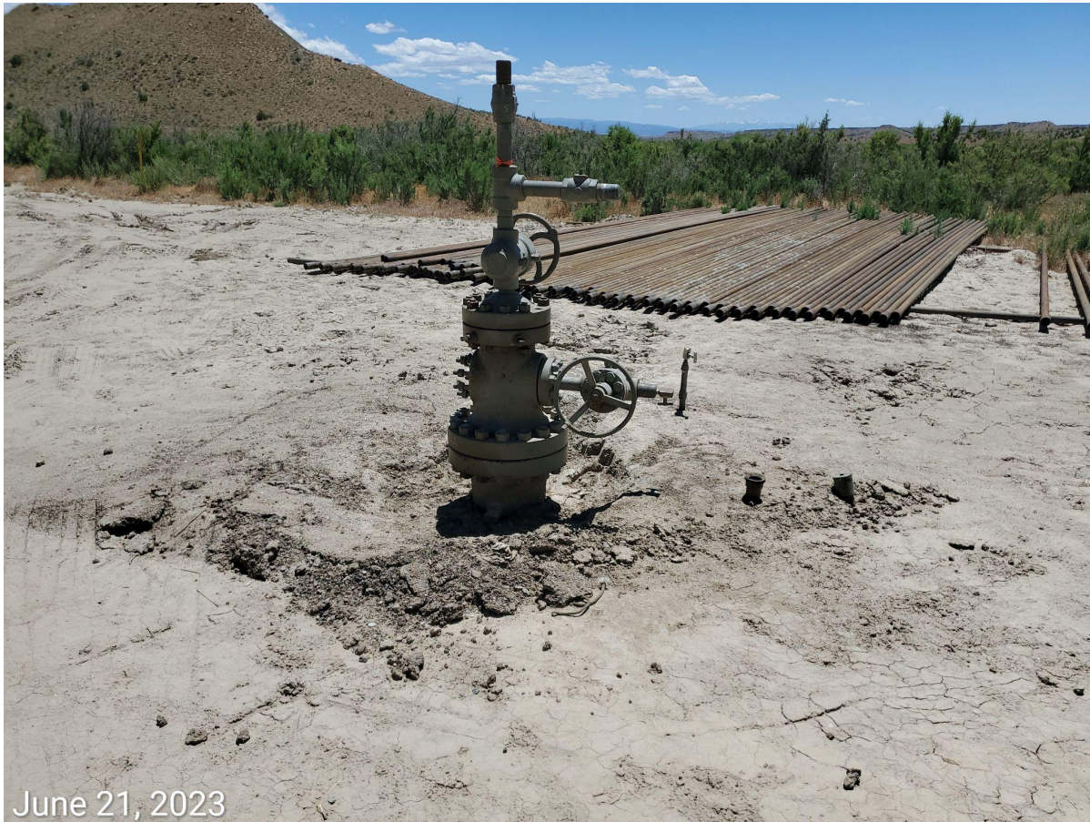
Photo 3: Photo taken from well. Well has not been P&A. Signage remains missing at well.