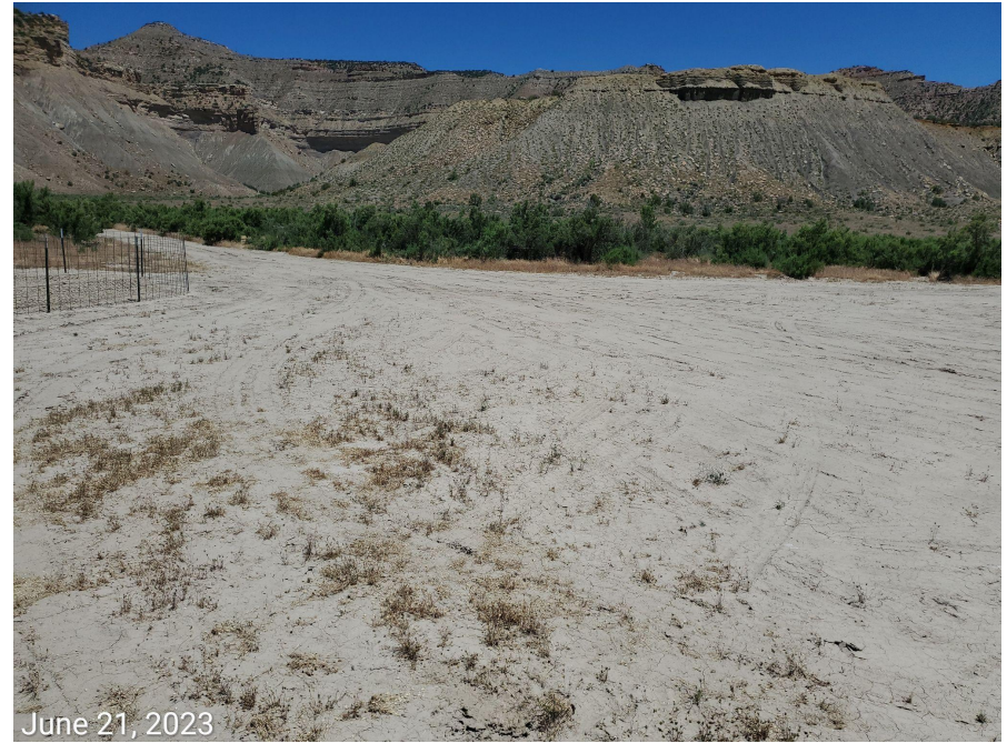
Photo 1: Photos 1-2 taken from the west end of the Location. Photos provide an overview from north, northeast, southeast to south.