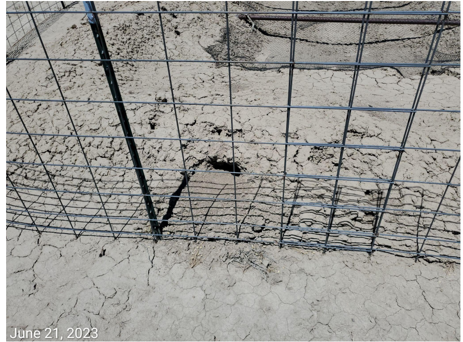
Photo 12: Photos taken from the tank battery on the north end of the Location. Photos example showing wildlife has burrowed into the walls, and the base of the secondary containment BMP. BMP no longer impervious to contain a spill or release.