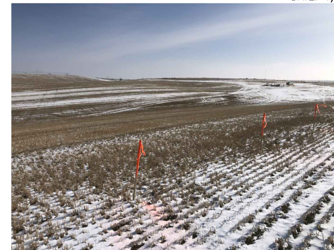
VIEW 4 — SOUTHEAST