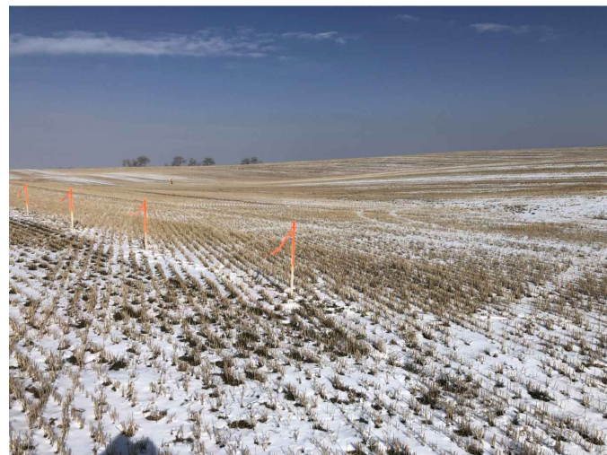
VIEW 2 — NORTHEAST