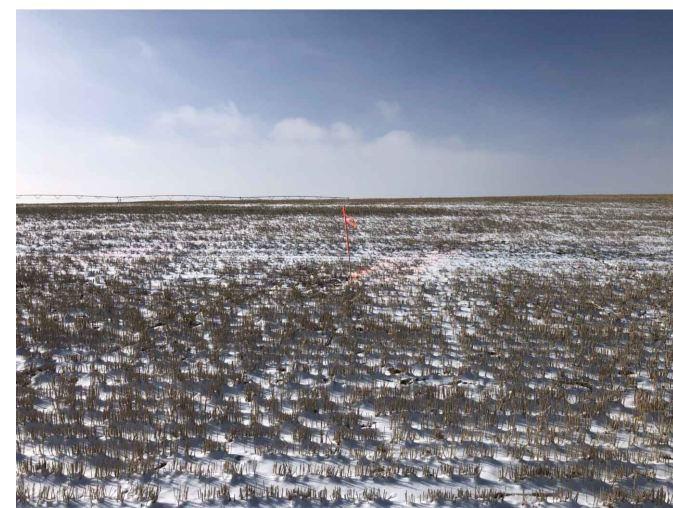
VIEW 7 — WEST