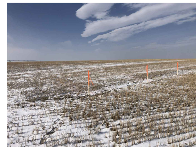
VIEW 8 — NORTHWEST