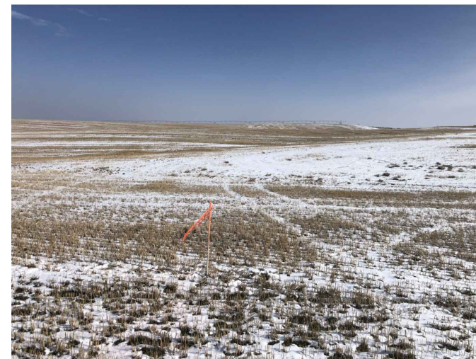
VIEW 3 — EAST