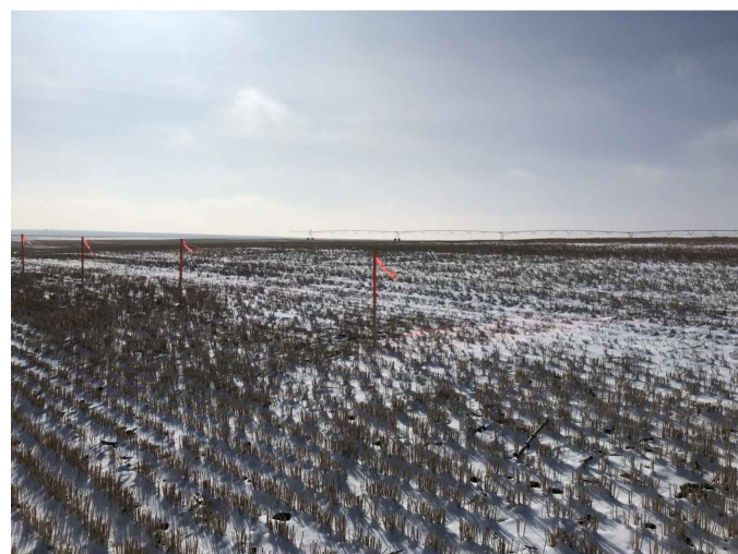
VIEW 6 — SOUTHWEST