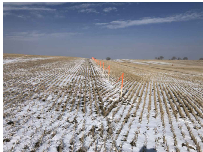
VIEW 1 — NORTH

Q-Q: SESW SECTION: 13 TOWNSHIP: 5N RANGE: 67W 6TH. P.M. WELD COUNTY, CO DATE: 1/27/2021