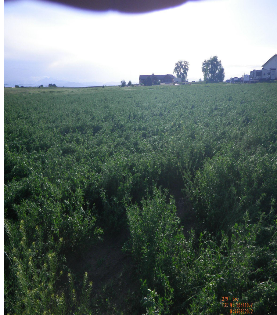
Photo 7. Cardinal photos taken from the middle of the well pad. Left photo facing south, right photo facing west. Note: well pad appears consistent with adjacent crop reference area (see photo 8).