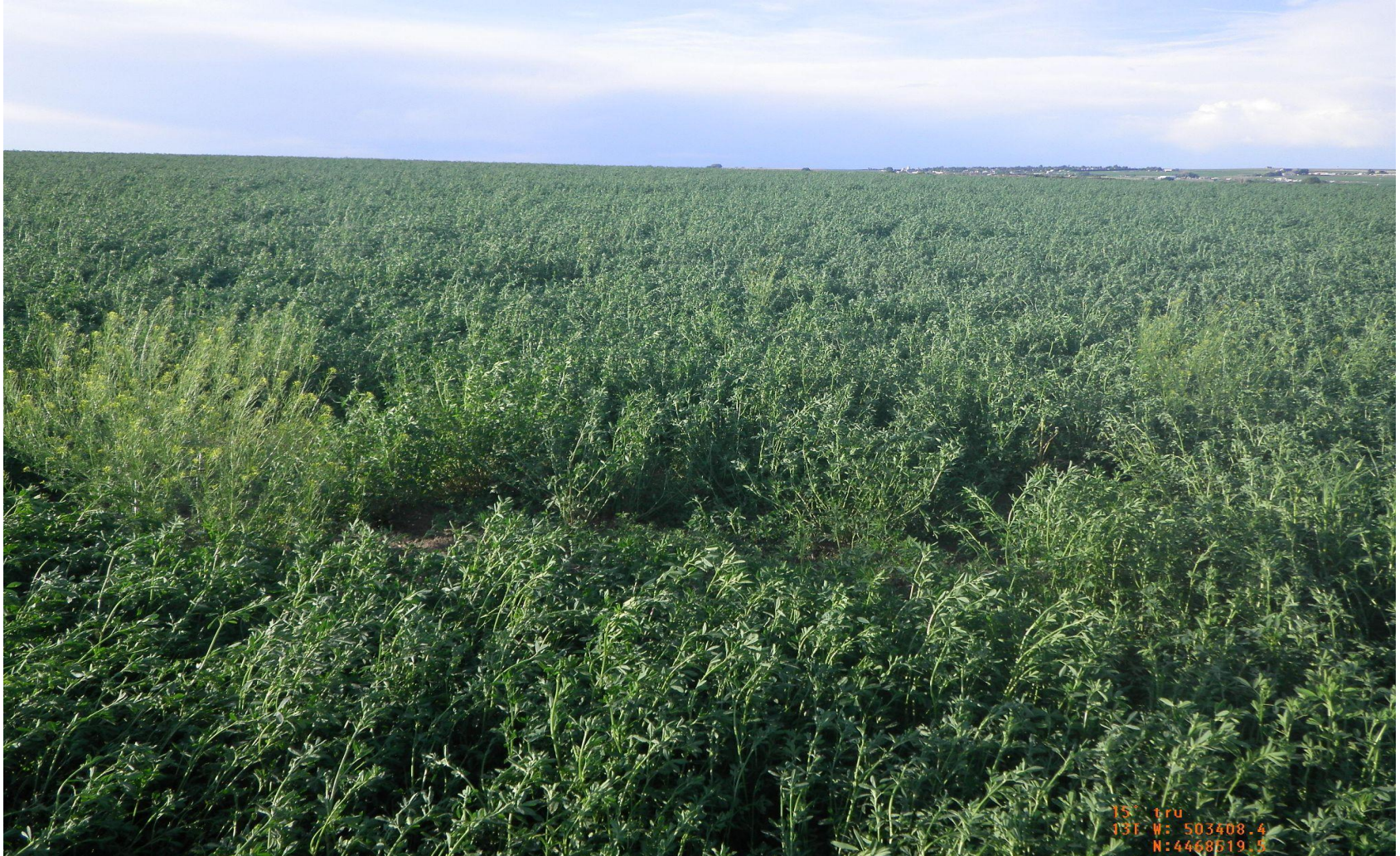
Photo 5. Overview photo of the well pad taken at ground level from the western edge facing northeast.