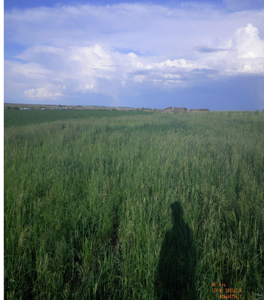
Photo 3. Cardinal photos taken from the middle of the tank battery. Left photo facing north, right photo facing east.