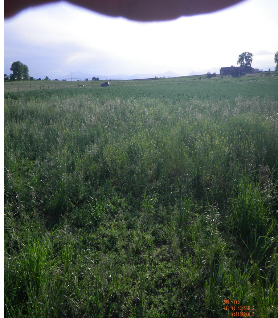
Photo 4. Cardinal photos taken from the middle of the tank battery. Left photo facing south, right photo facing west. Note: tank battery falls within an alfalfa but has 80% perennial grass cover.