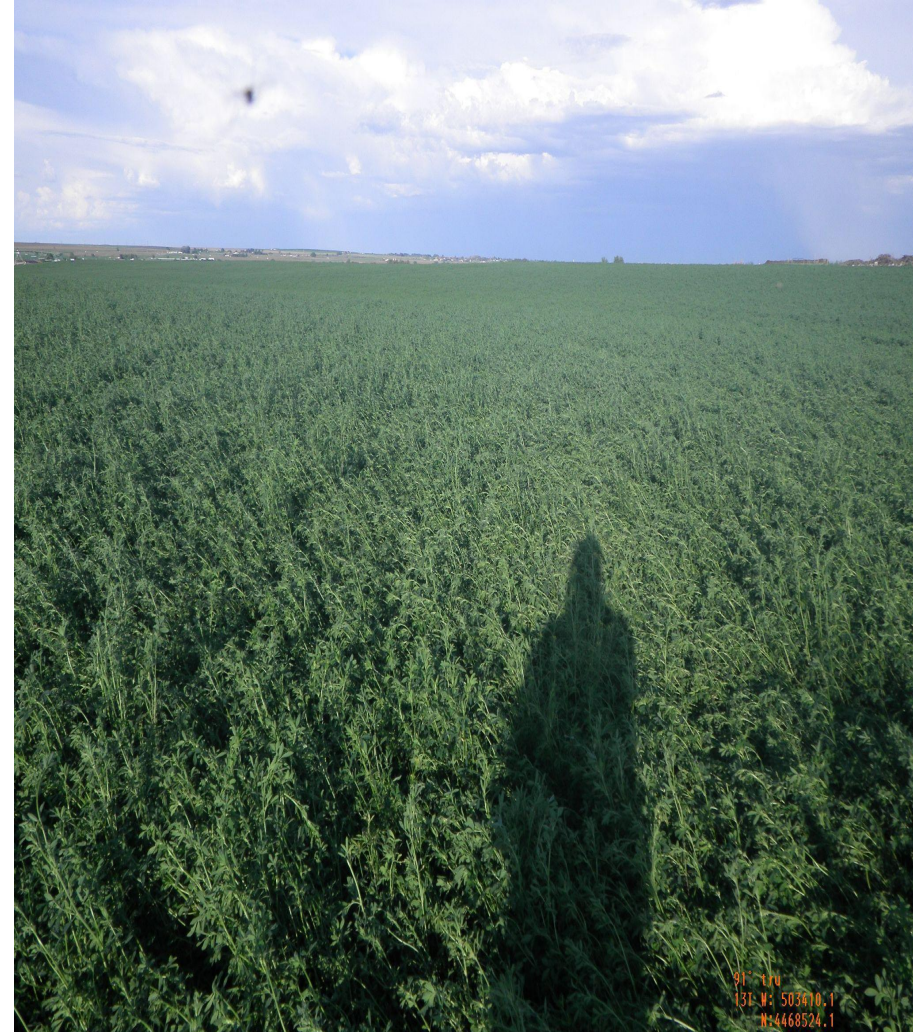
Photo 6. Cardinal photos taken from the middle of the well pad. Left photo facing north, right photo facing east.