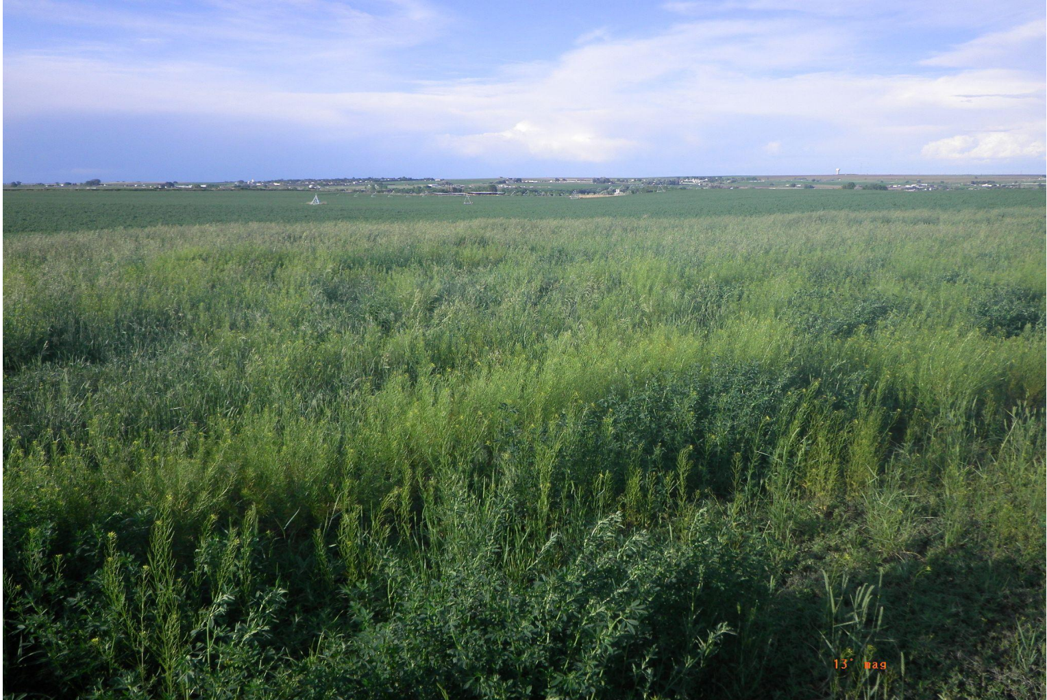
Photo 2. Overview photo of the tank battery taken at ground level from the southern edge facing north.