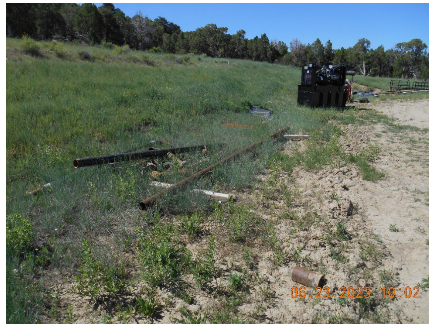
Unused equipment and junk pipe