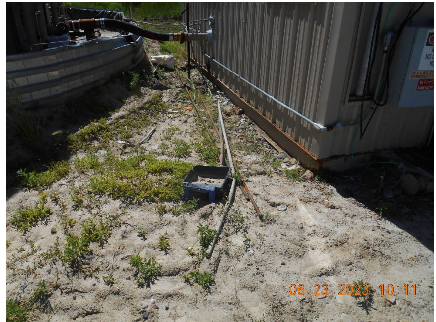
Trash and junk pipe