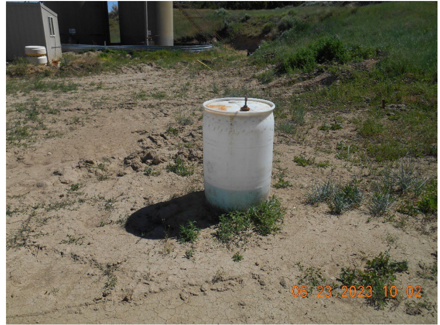
Unknown chemical drum with no secondary containment