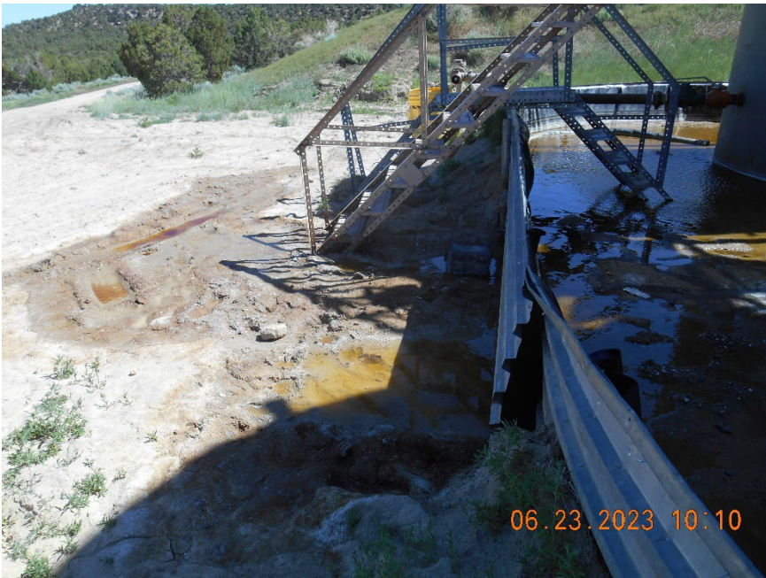
Tank Battery berm damaged and leaking