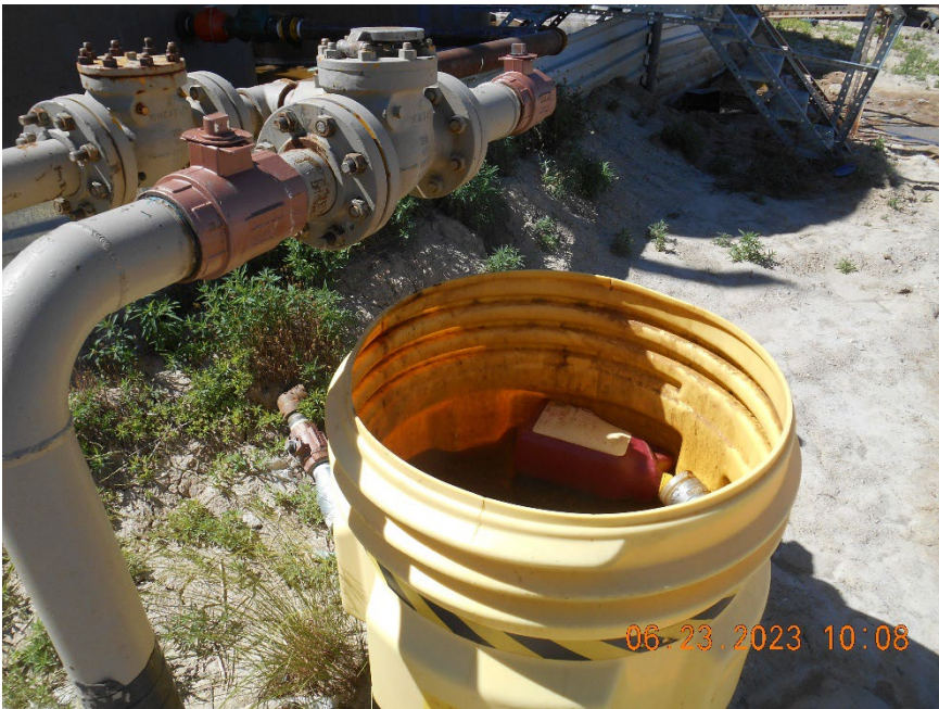
Open container with fluid and trash. No secondary containment