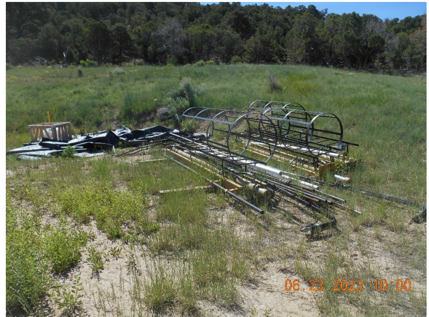
Unused equipment and junk pipe