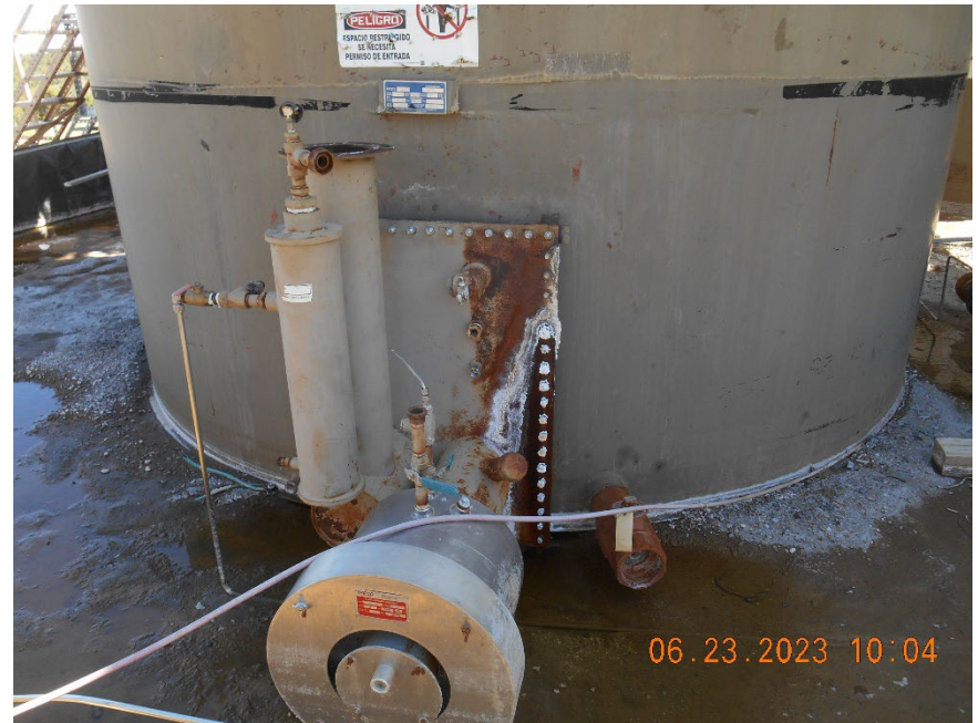
Tank heater hatch leaking