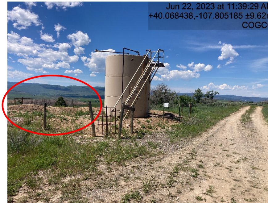
Recent photo of tank battery and open pit