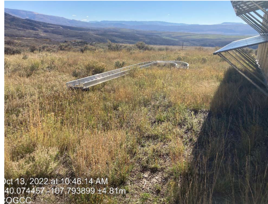
Previous inspection of debris