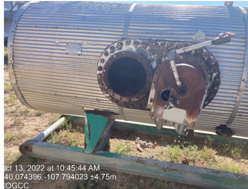
Previous inspection photo of stored equipment and open hole for wildlife.