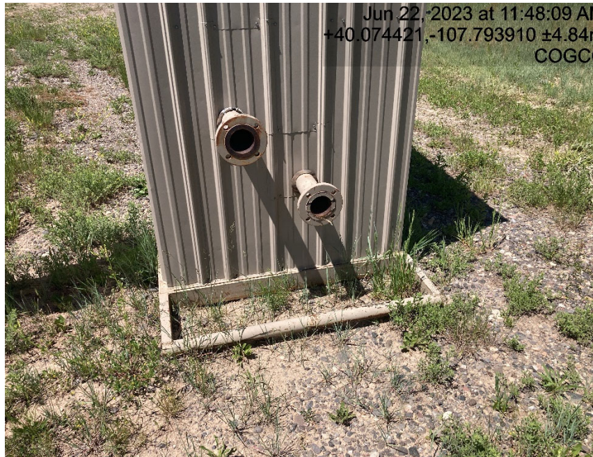
Recent photo of stored equipment and open holes for wildlife