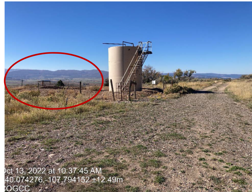
Previous inspection photo of tank battery and open pit