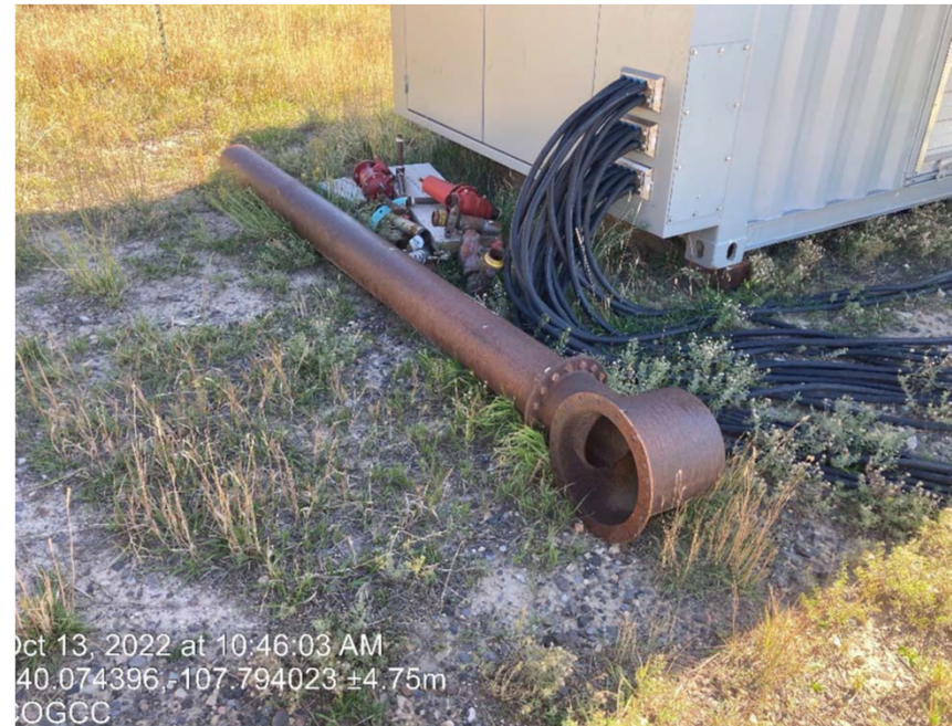
Previous inspection of debris