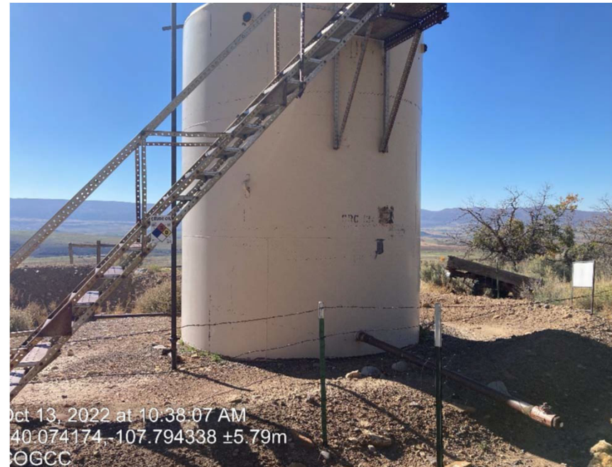
Previous inspection of tank lacking proper labeling