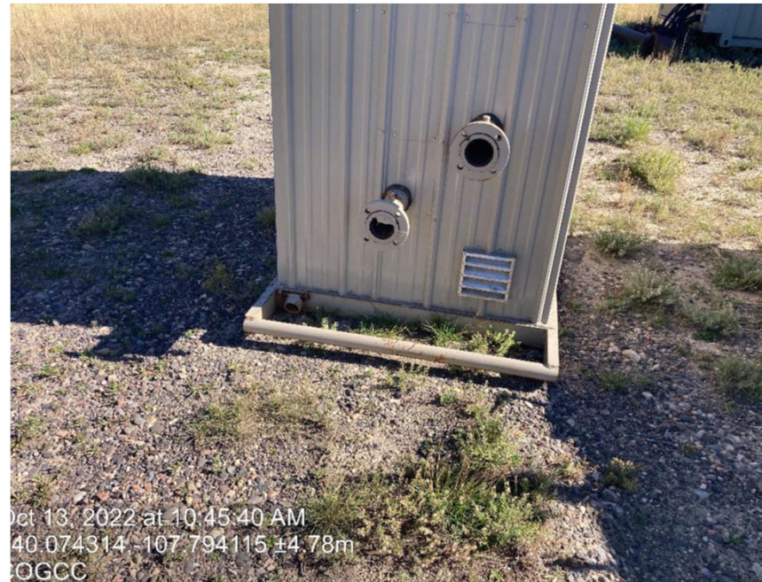
Previous inspection photo of stored equipment and open holes for wildlife