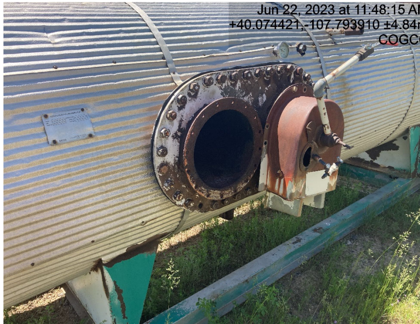
Recent photo of stored equipment and open hole for wildlife.