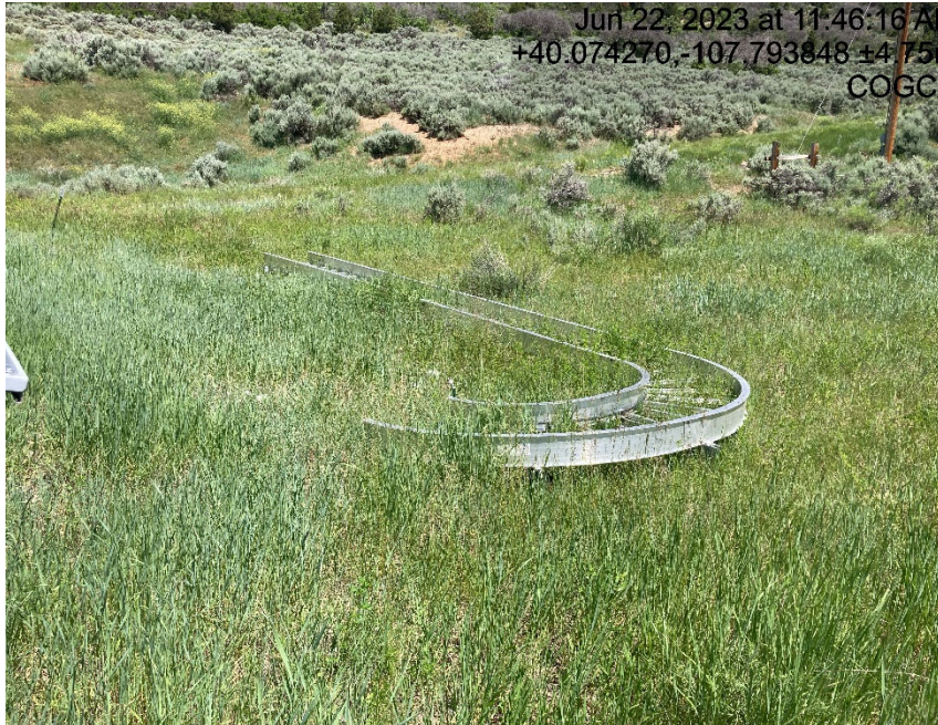
Recent photo of debris