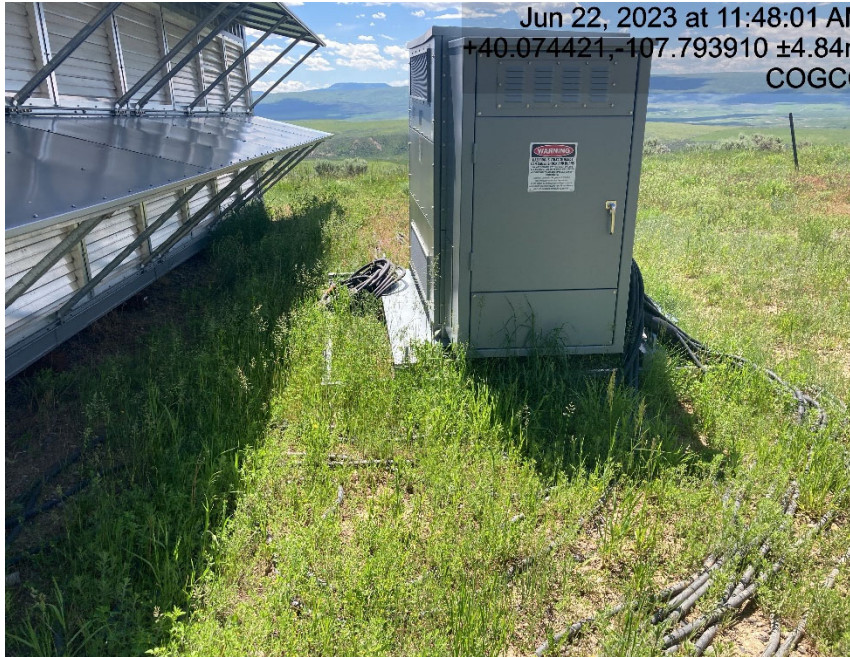
Stored equipment and Electrical wires on the ground