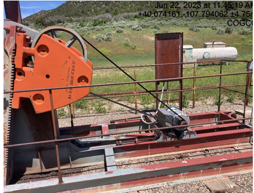
Guard is missing from pump jack, safety issue.