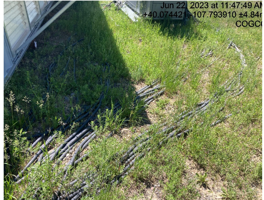
Electrical wires on the ground