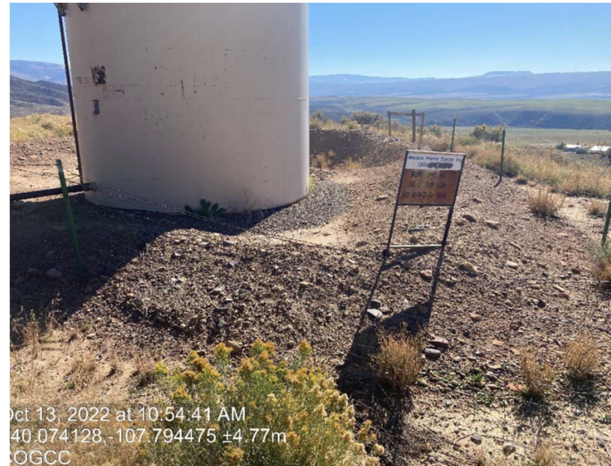
Previous inspection of battery signage not correct