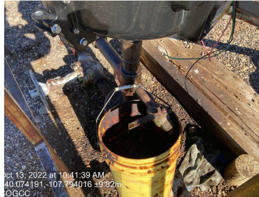
Previous inspection photo of bucket with fluid and debris