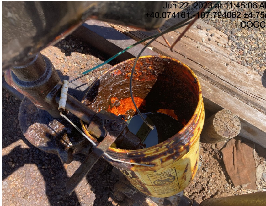
Recent photo of bucket with fluid and debris