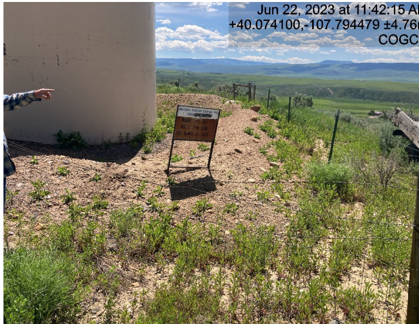
Recent photo of battery signage is still not correct