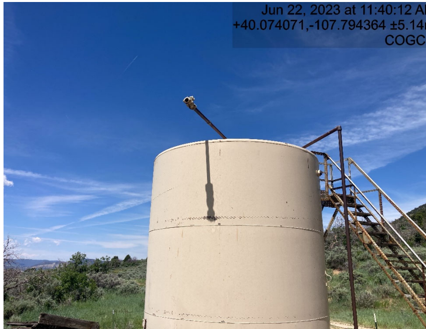
Recent photo of pipe on top of tank with a valve on it now