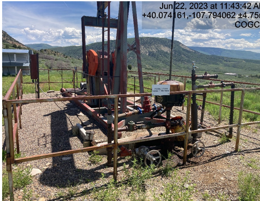
Weeds and well signage lacking information