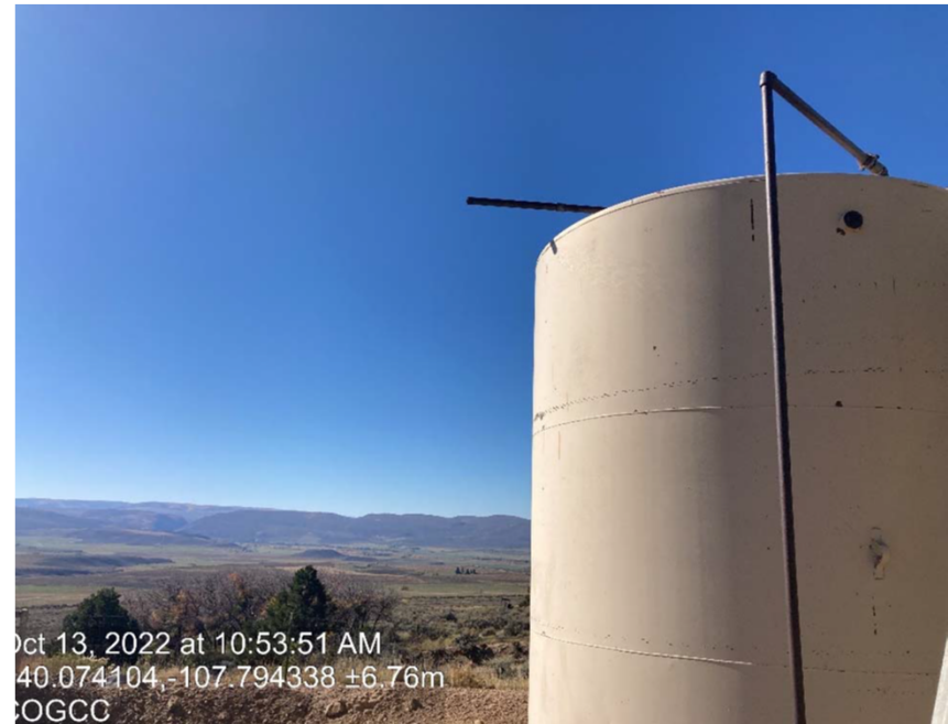
Previous inspection of pipe on top of tank with out a valve