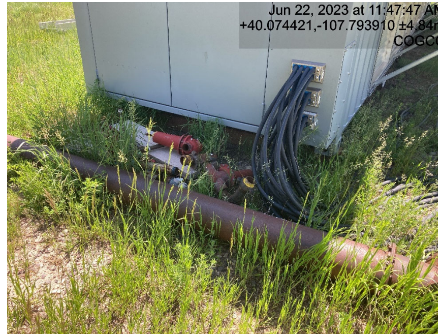
Recent photo of debris