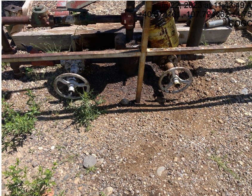
Staining, bucket and debris