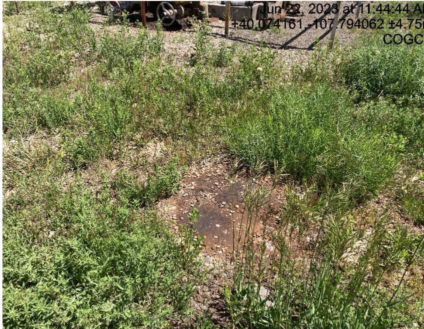
Stained material near well head and weeds.