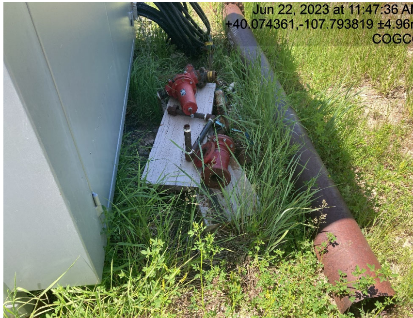
Recent photo of debris