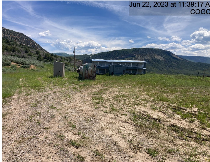
Location and stored equipment