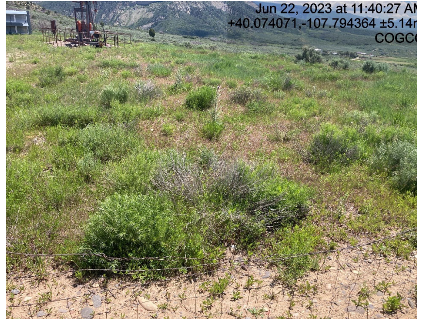
Throughout location is covered with weeds.