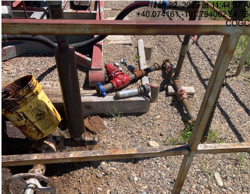
Recent photo of debris