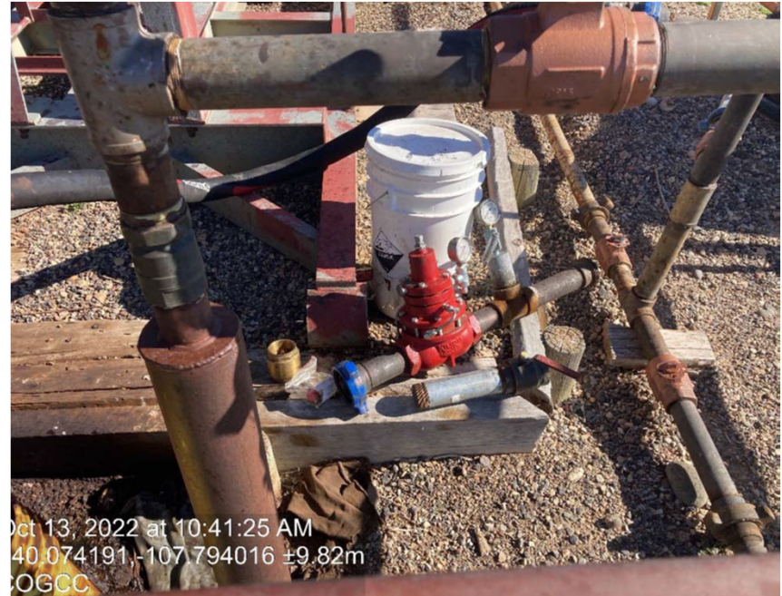
Previous inspection photo of debris