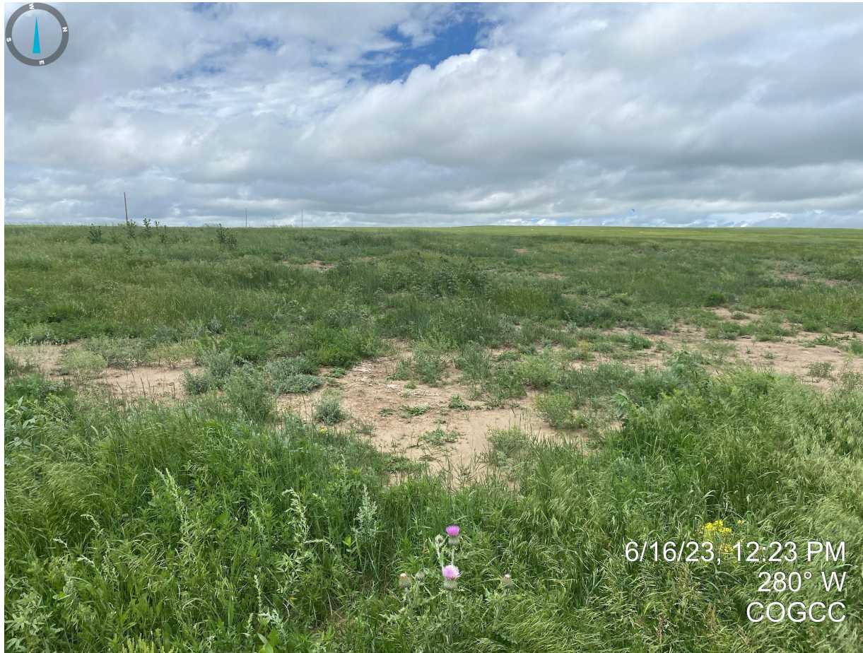
Photo 1. Taken from the eastern edge of the apparent salt kill area. During this inspection staff observed Colorado List B & C Noxious weeds (musk thistle, and cheatgrass) growing throughout the impacted area. These undesirable species were not observed in adjacent reference areas. Also pictured, non-uniform vegetation cover resulting in areas of exposed soils.