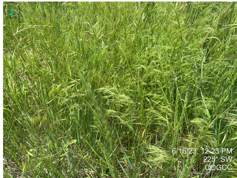
Photo 2. Close up photos of Colorado List B Noxious Weed musk thistle (left) and Colorado List C Noxious Weed cheatgrass (right) observed within the apparent salt kill area. Management of these undesirable species is required to prevent spread onto adjacent lands.