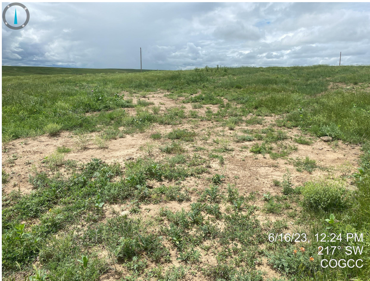
Photo 3. Taken from the midpoint of the salt kill impacts, facing southwest; see comments in Photo 1.