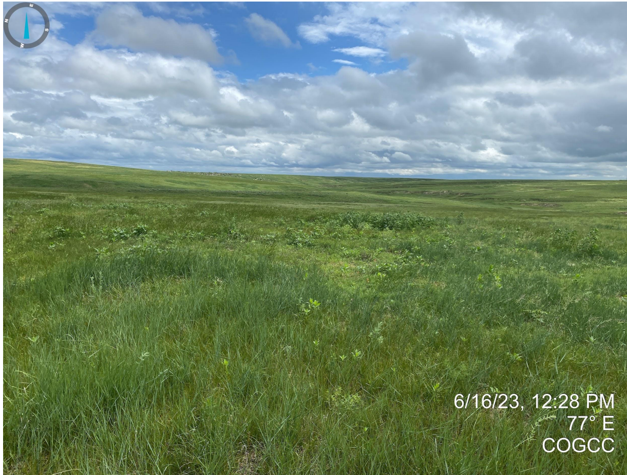
Photo 10. The former well location appears to be progressing towards Rule 1004 standards with the presence of native perennial vegetation reflective of adjacent reference areas. Further reclamation activities are required south of this well location, within the impacted salt kill area, in order for the location to pass final reclamation.