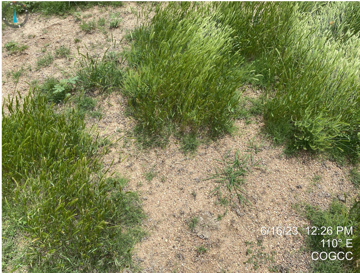
Photo 8. Close up of gravel/road base observed around the former equipment foundation, on the western side of the salt kill area.