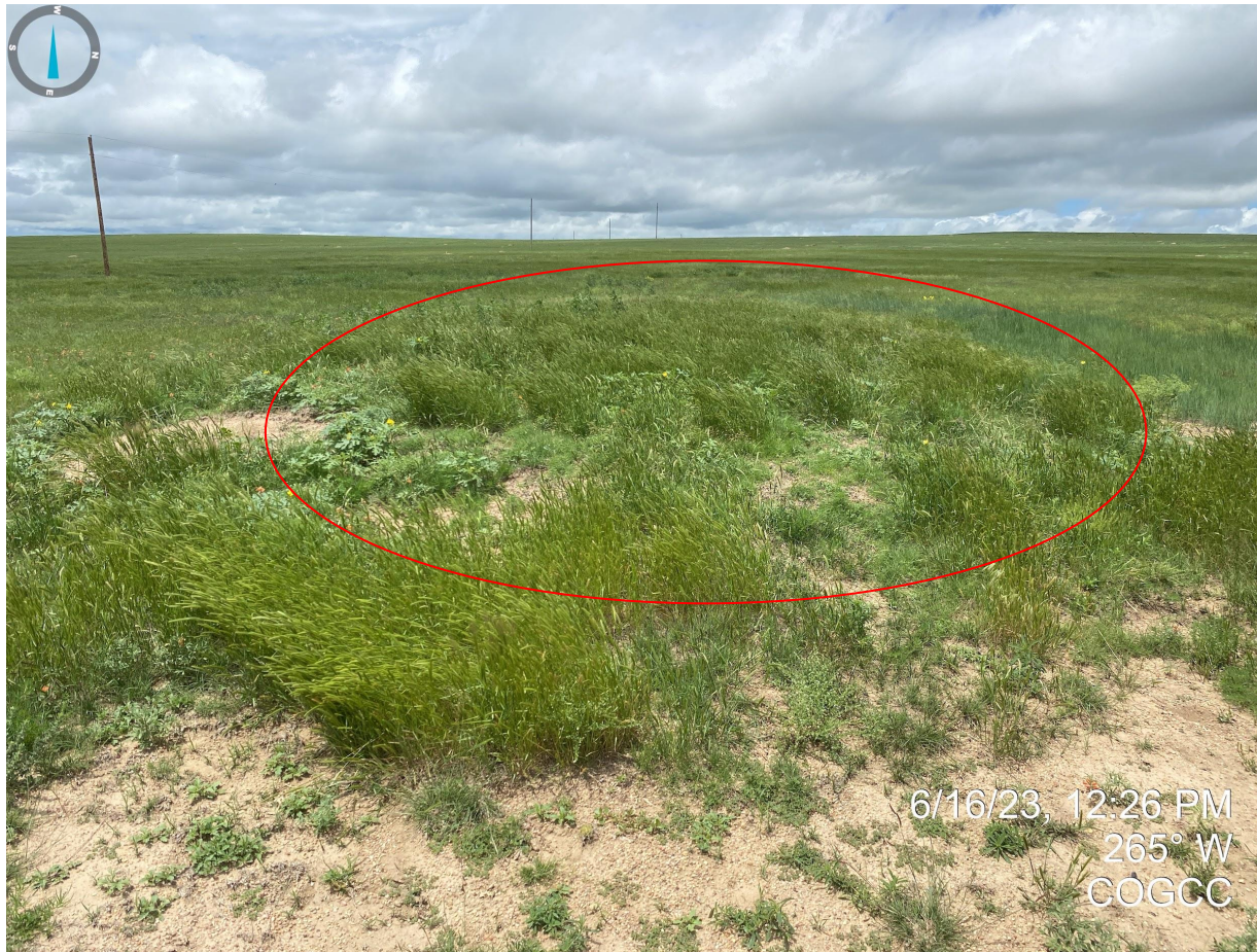
Photo 7. Taken near the western edge of the salt kill area. Red outline illustrates an apparent foundation used for equipment that has not been recontoured/graded to reflect adjacent topography. Presence of gravel/road base was evident (see Photo 8).