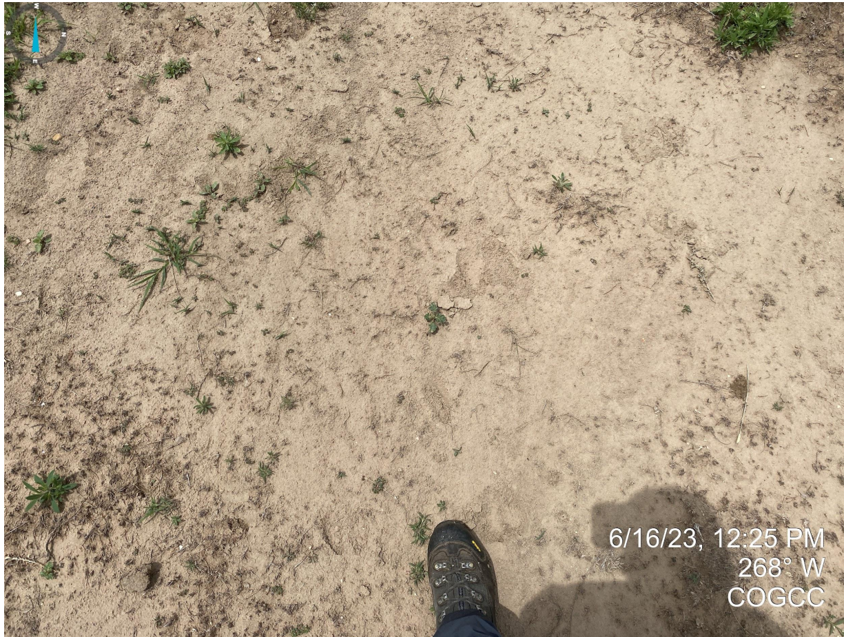
Photo 6. Close up of exposed soils.