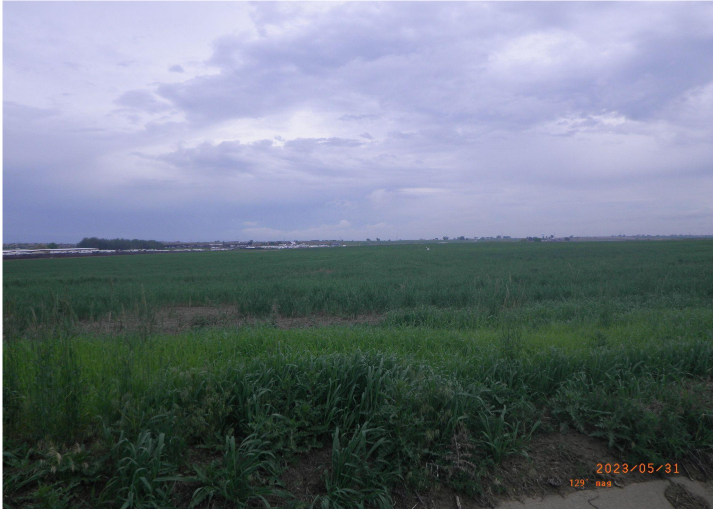
Photo 3. Overview ground photo of the well pad crop field.