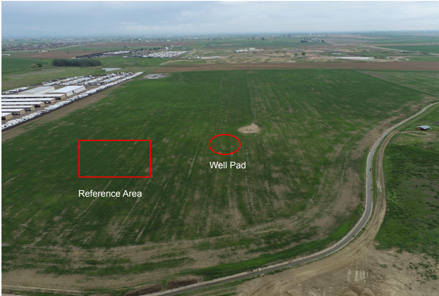
Photo 2. Overview photo of the well pad and reference area taken with a drone from the southern edge facing north. Note: well pad appears consistent with adjacent crop reference area.