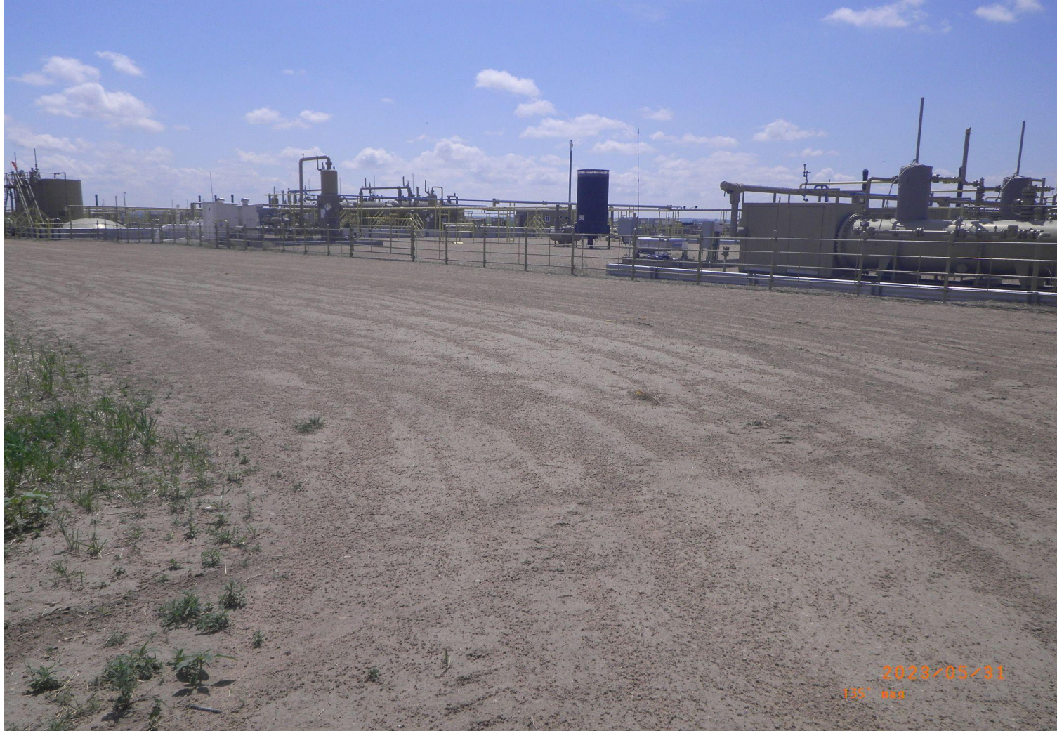
Photo 5. Overview photo of the tank battery taken at ground level from the northern edge facing south. Note: tank battery disturbance has been absorbed my new active facility to the south.