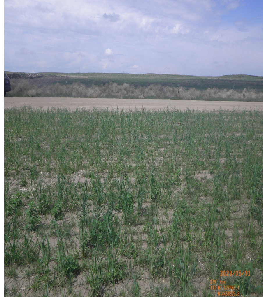
Photo 4. Cardinal photos taken from the middle of the well pad. Left photo facing south, right photo facing east. Note: well pad has a higher density of perennial grass cover compared to reference area which is dominated by cheatgrass (see photo #6).