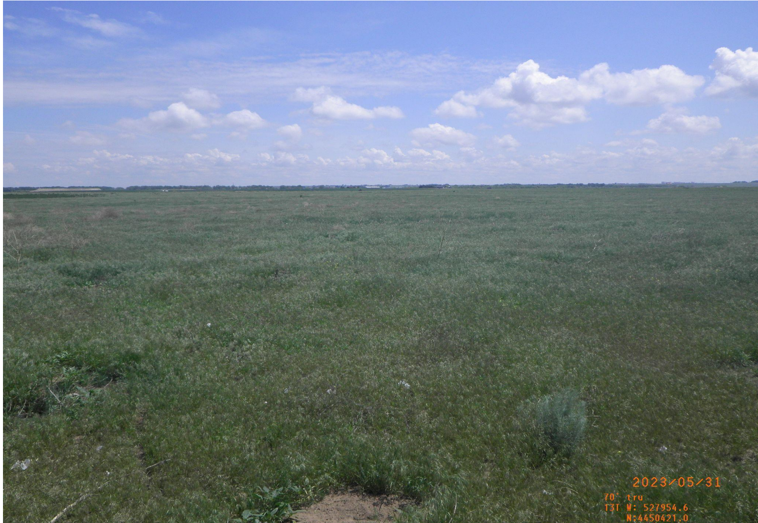
Photo 6. Well pad reference area to the north of the shared disturbance.