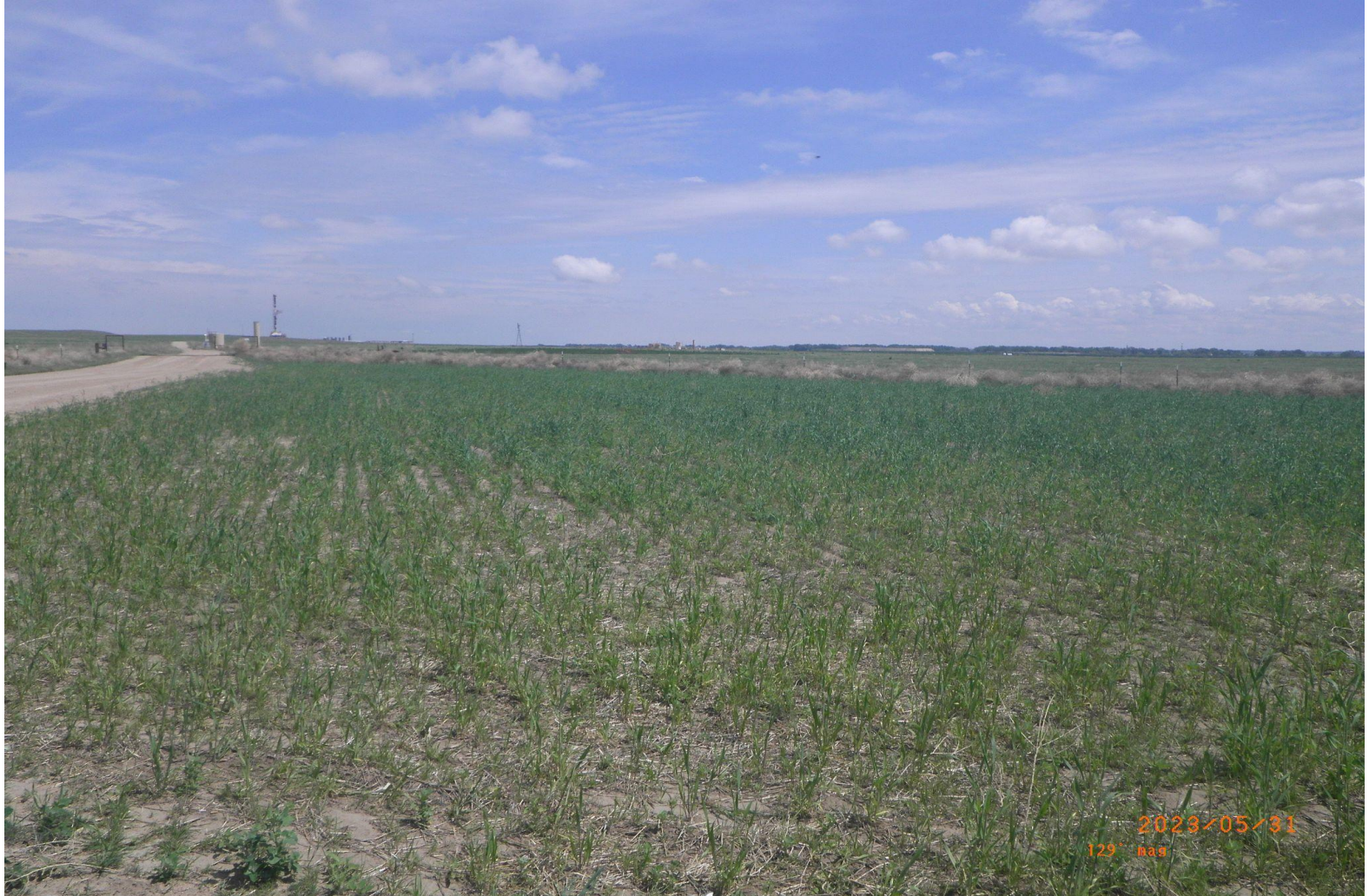
Photo 2. Overview photo of the well pad taken at ground level from the southern edge facing north.