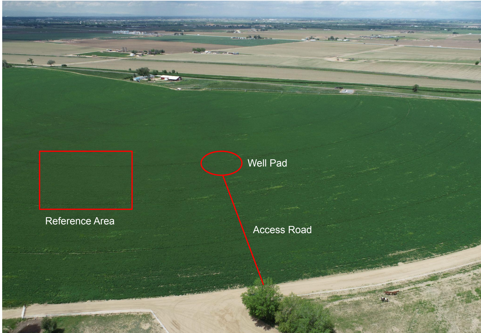
Photo 2. Overview photo of the well pad, access road and reference area taken with a drone from the northern edge facing south. Note: well pad and access road appear consistent with adjacent crop reference area.