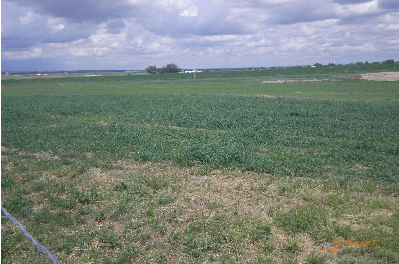
Photo 3. Overview photo of the tank battery taken at ground level from the western edge facing east. Note: tank battery falls within a corner crop area and appears consistent with reference corner crop (see photo #4).