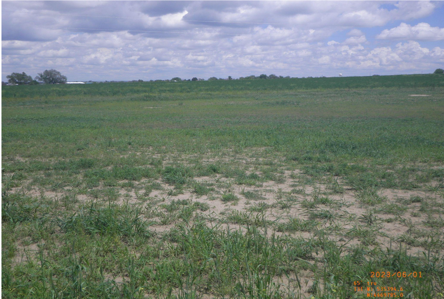
Photo 4. Tank battery reference area.