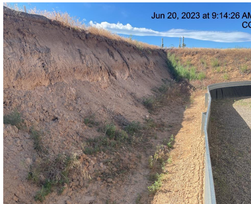
Photo # 1044 Slope stabilization BMP's insufficient/Run on to location not being controlled