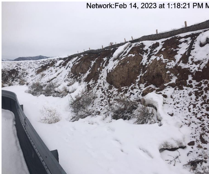
Photo # 9010 From Inspection 699805442 conducted on 02/14/2023 Run on to location not being controlled