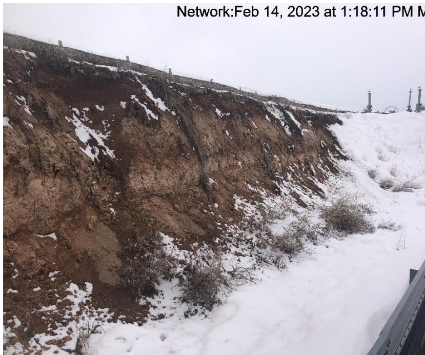
Photo # 9008 From Inspection 699805442 conducted on 02/14/2023 Slope stabilization BMP's insufficient