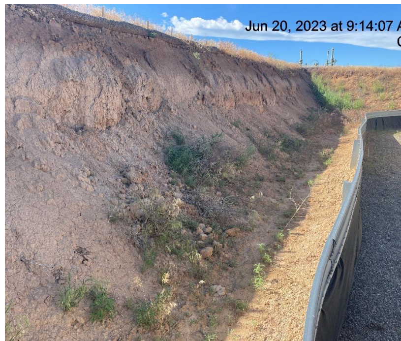
Photo # 1042 Slope stabilization BMP's insufficient/Run on to location not being controlled