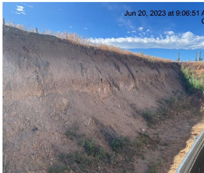
Photo # 1024 Slope stabilization BMP's insufficient Run on to location not being controlled