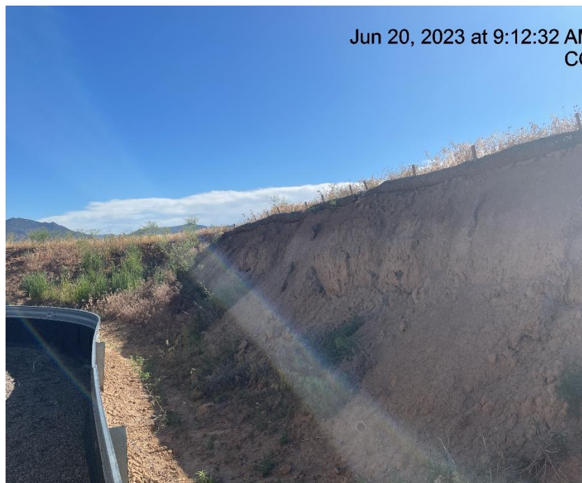
Photo # 1033 Slope stabilization BMP's insufficient/Run on to location not being controlled