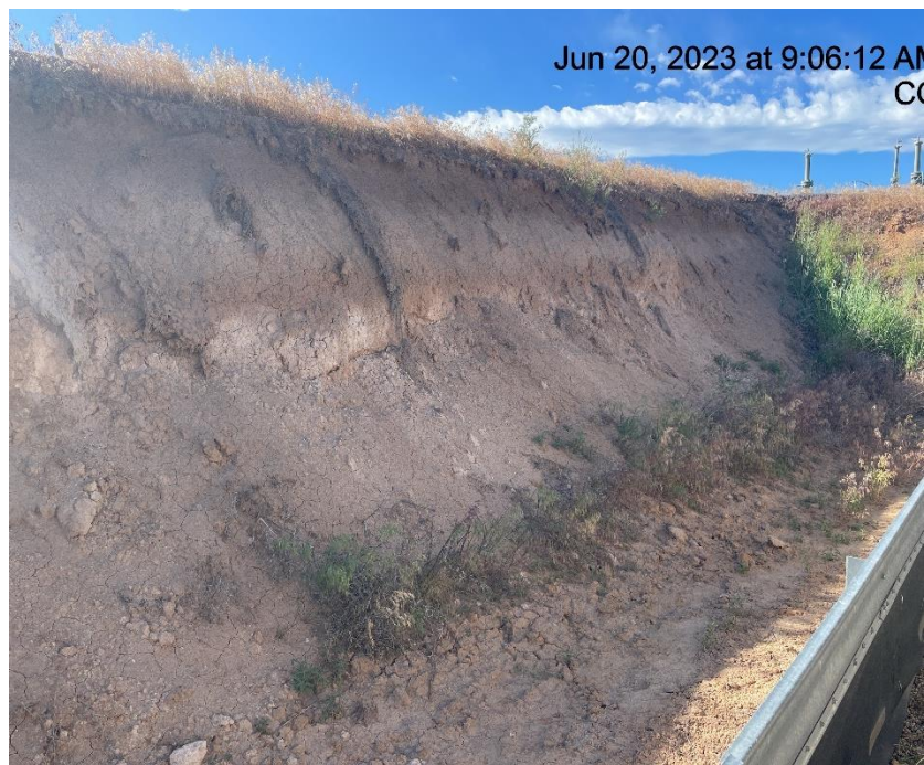
Photo # 1020 Slope stabilization BMP's insufficient/Run on to location not being controlled