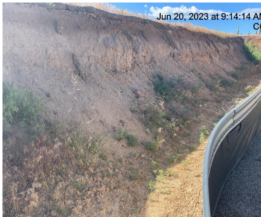
Photo # 1043 Slope stabilization BMP's insufficient/Run on to location not being controlled