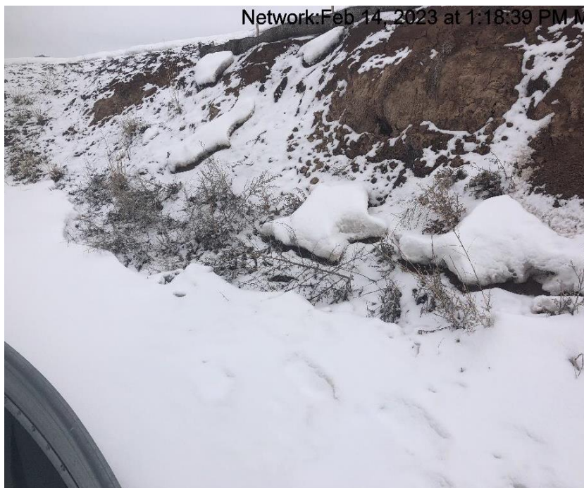
Photo # From Inspection 699805442 conducted on 02/14/2023 Slope stabilization BMP's insufficient