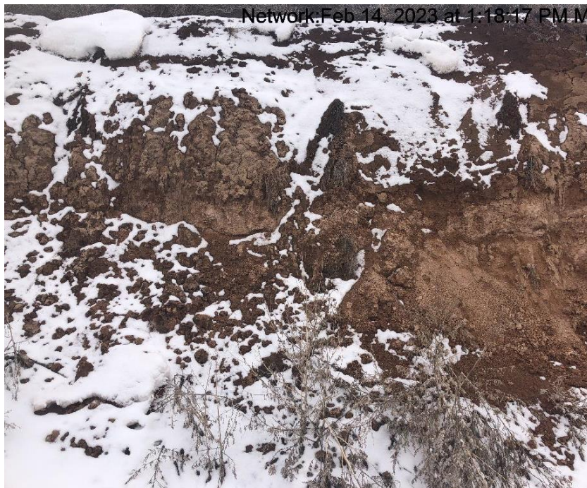
Photo # 9009 From Inspection 699805442 conducted on 02/14/2023 Slope stabilization BMP's insufficient