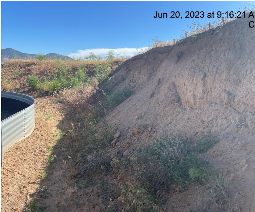
Photo # 1052 Slope stabilization BMP's insufficient/Run on to location not being controlled