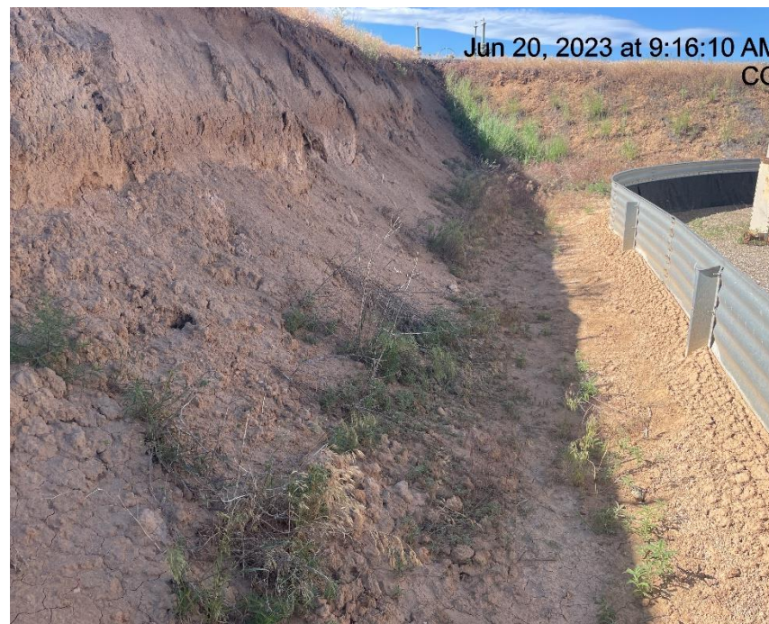
Photo # 1051 Slope stabilization BMP's insufficient/Run on to location not being controlled