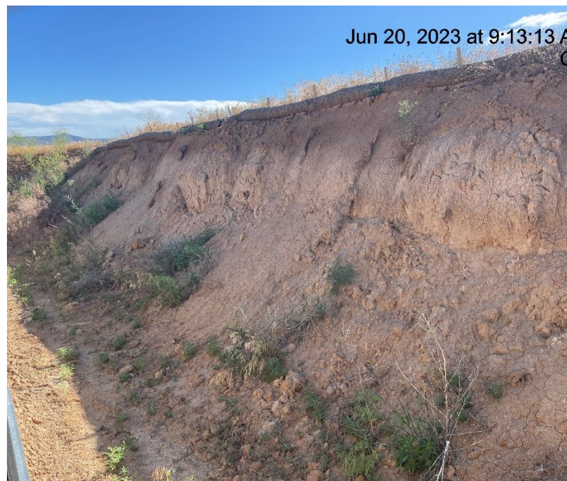
Photo # 1037 Slope stabilization BMP's insufficient/Run on to location not being controlled