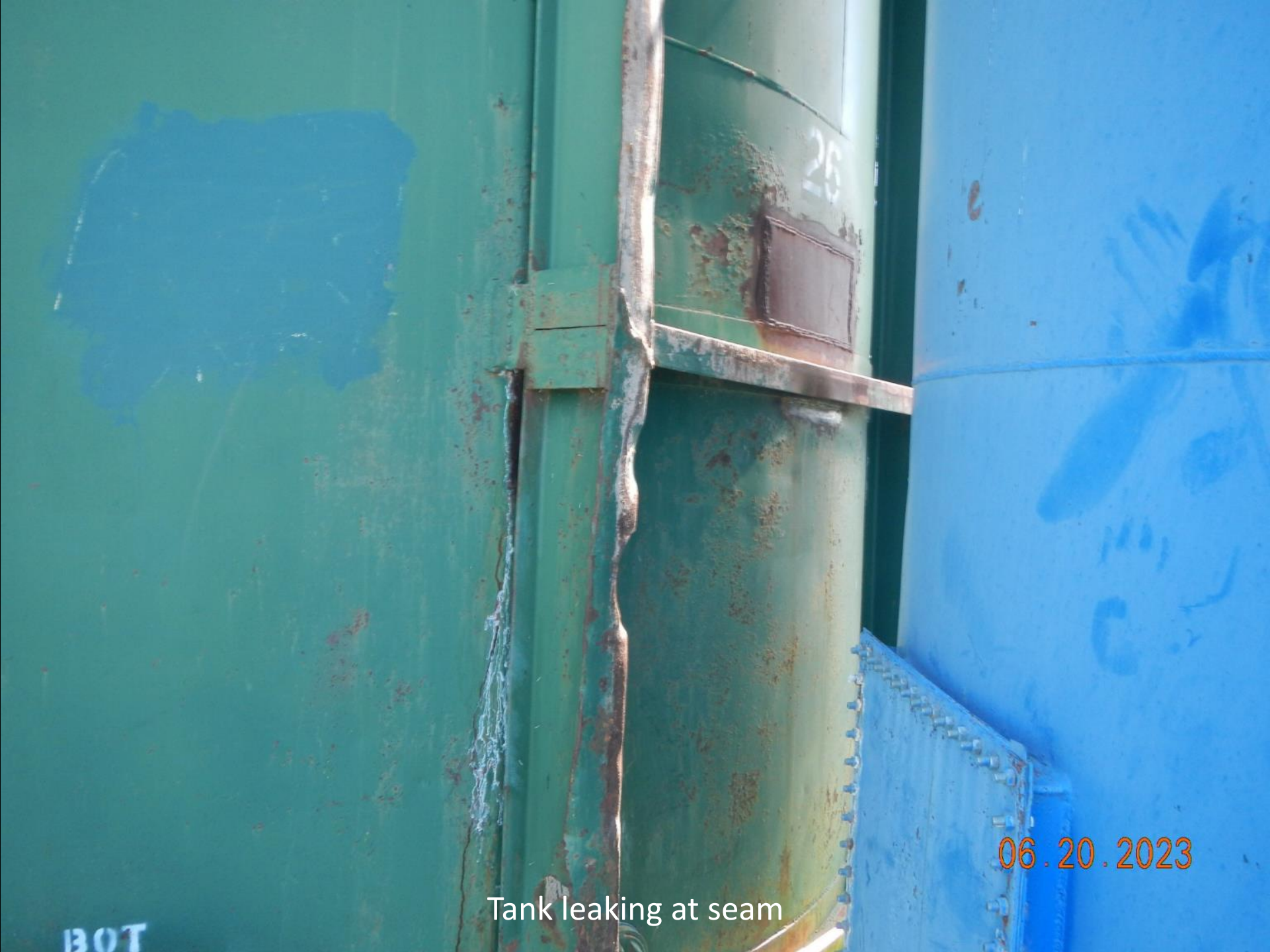
Tank leaking at seam