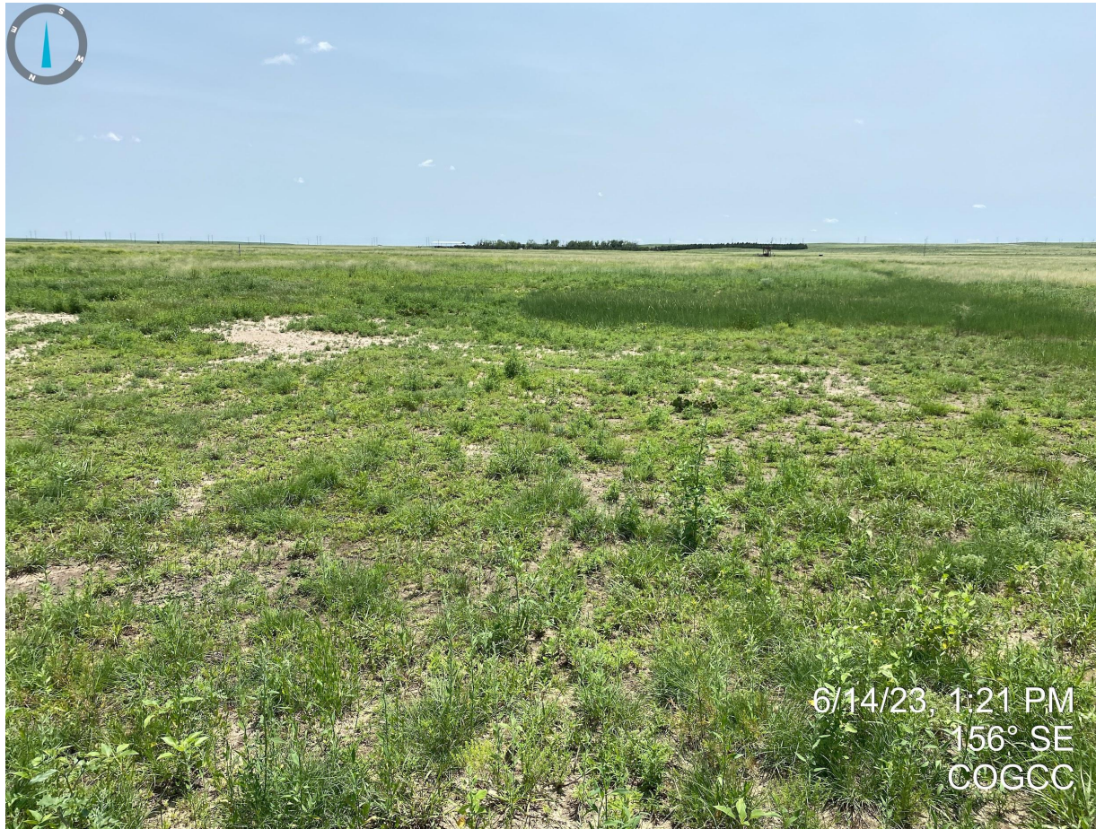
Photo 2. The location does not appear to be progressing towards Rule 1004 standards. Staff observed that debris remains on location, the presence of undesirable vegetation (e.g. kochia and CO List C Noxious Weed-cheatgrass), and areas of exposed soil were observed throughout.