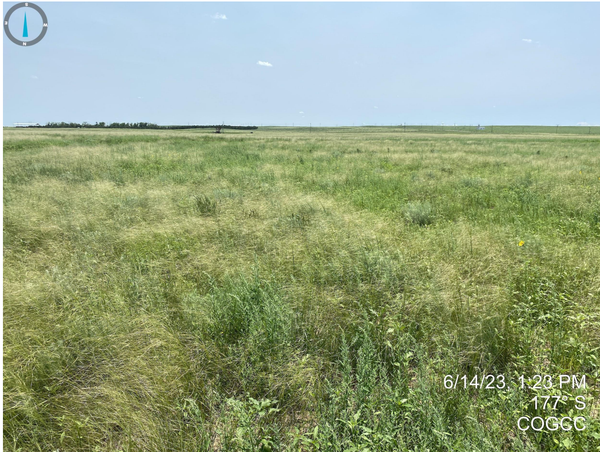
Photo 7. Reference area photo taken west of location.