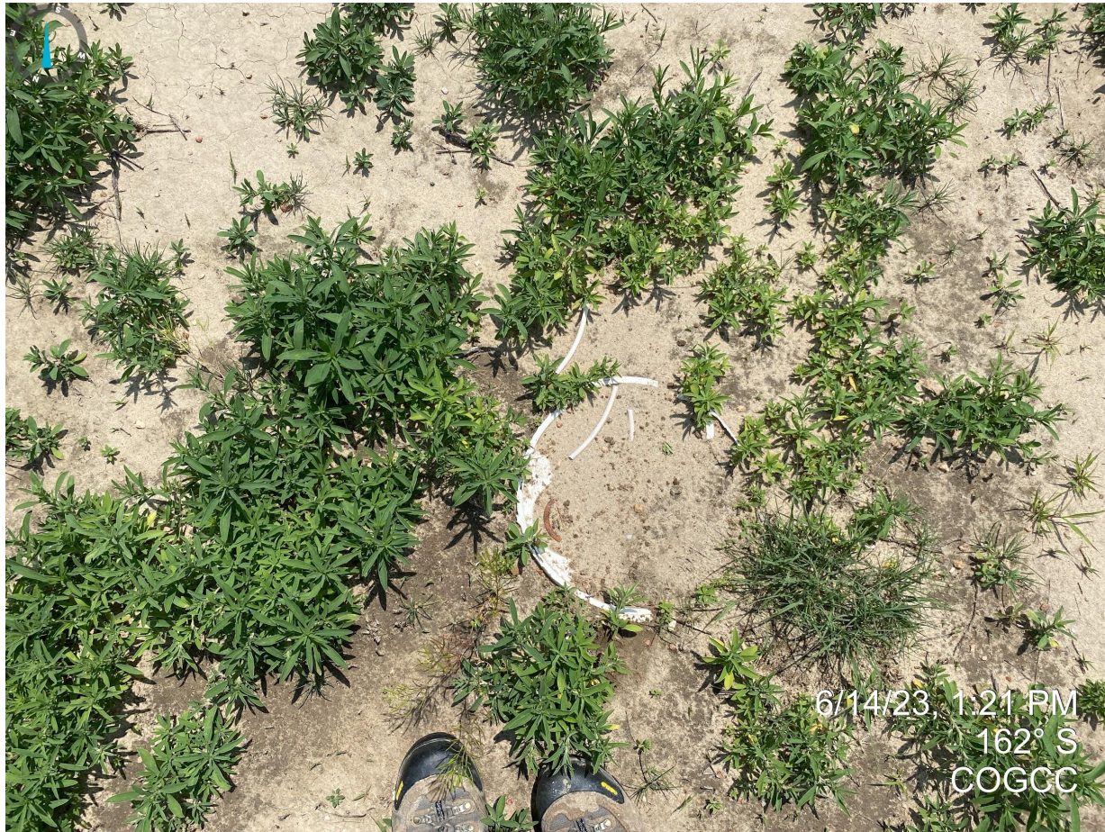
Photo 6. Close up of debris and undesirable vegetation (e.g. kochia).