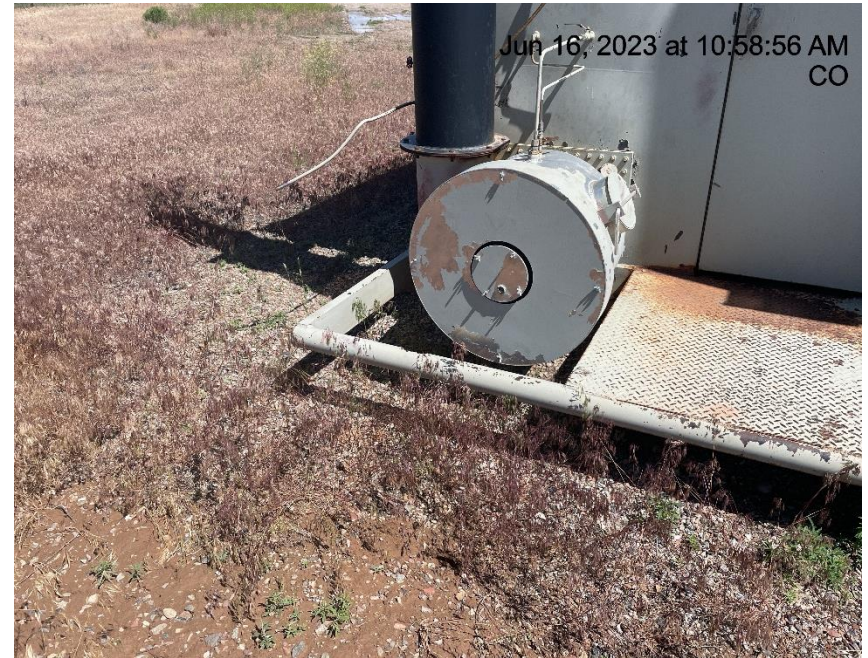
Photo # 798 Weeds/undesirable plant species encroaching on production unit & burner assembly