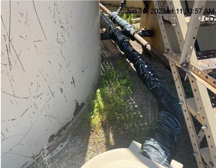
Photo # 811 Weeds/undesirable plant species in secondary containment