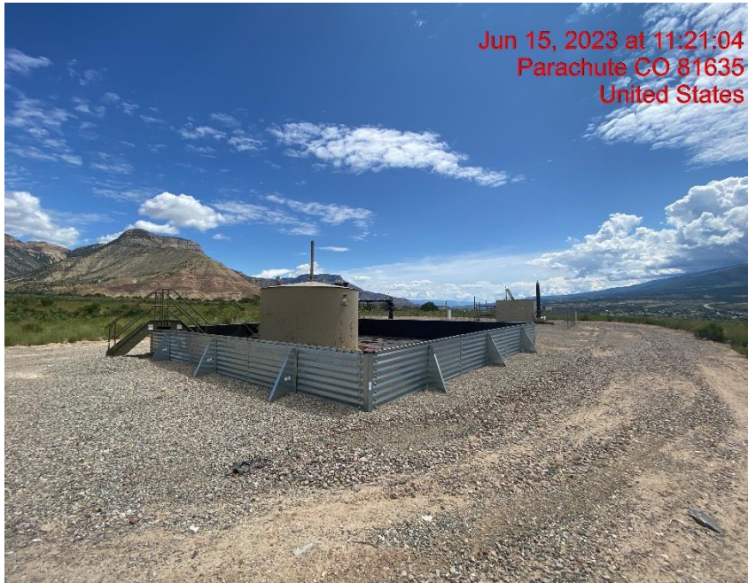
NW Corner of Location – Photo #04554