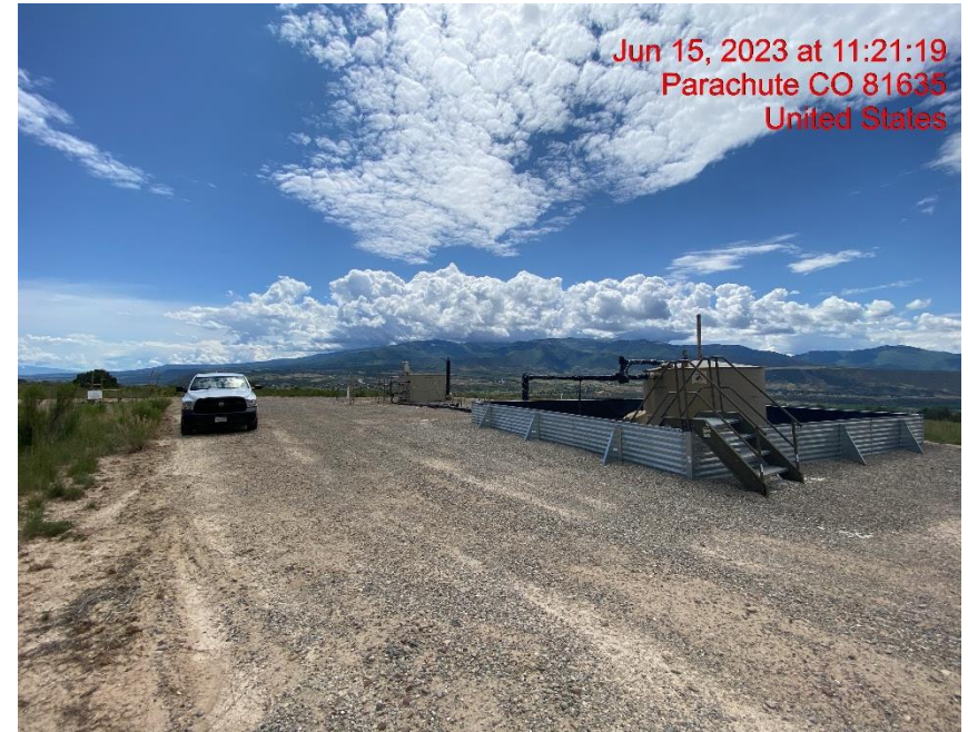
NE Corner of Location – Photo #04555