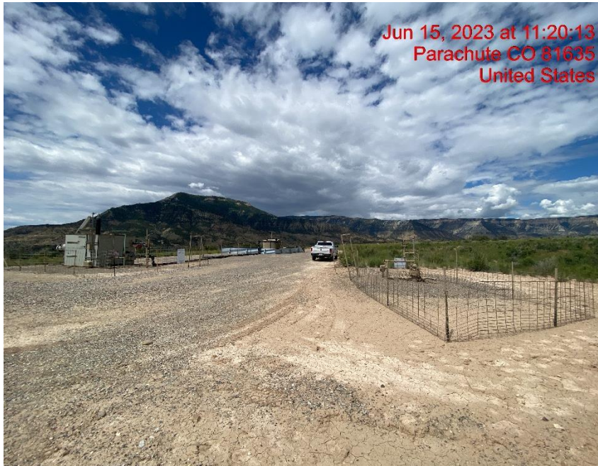
SE Corner of Location – Photo #04552