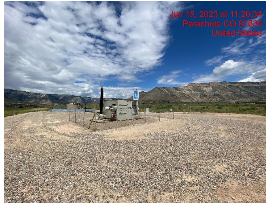
SW Corner of Location – Photo #04553