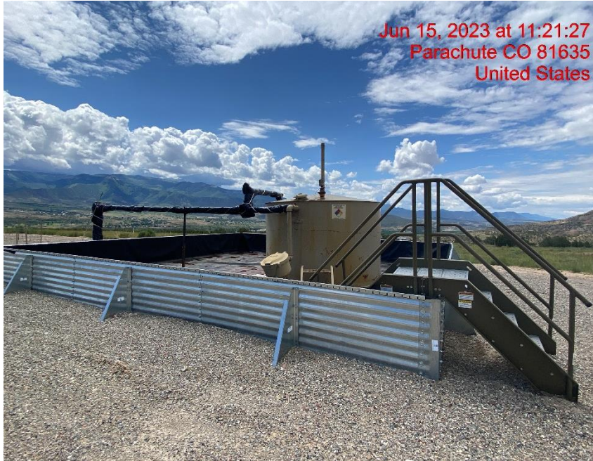
Tank Battery – Photo #04556