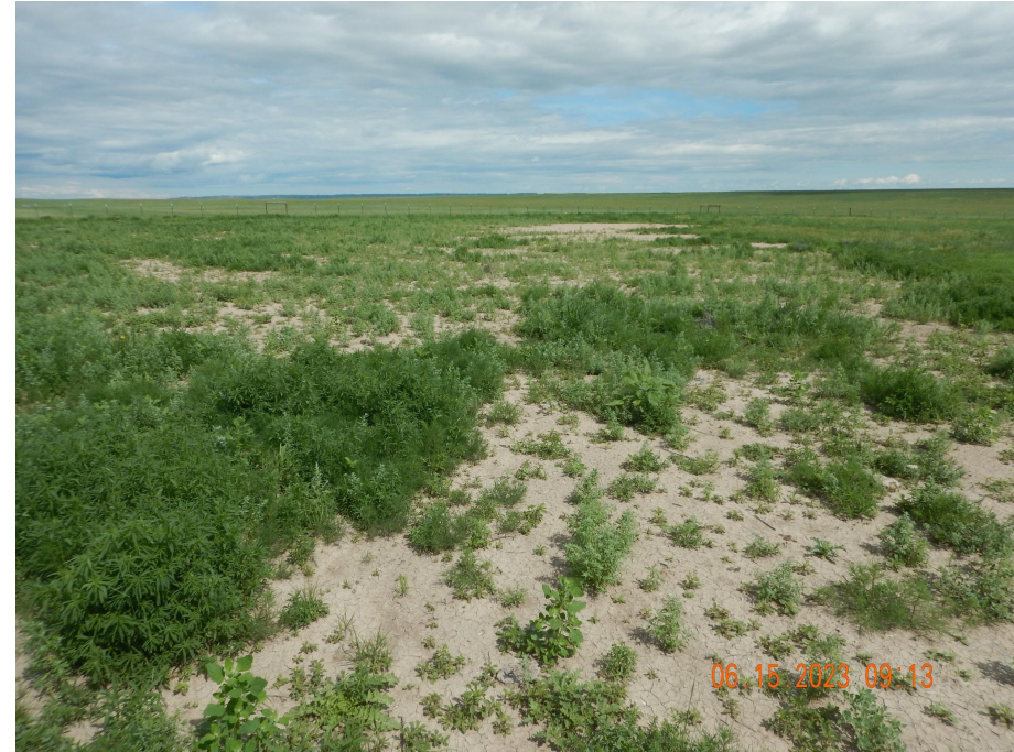
Photo 5. Photo taken from the central location, facing North. See comments under Photo 2.