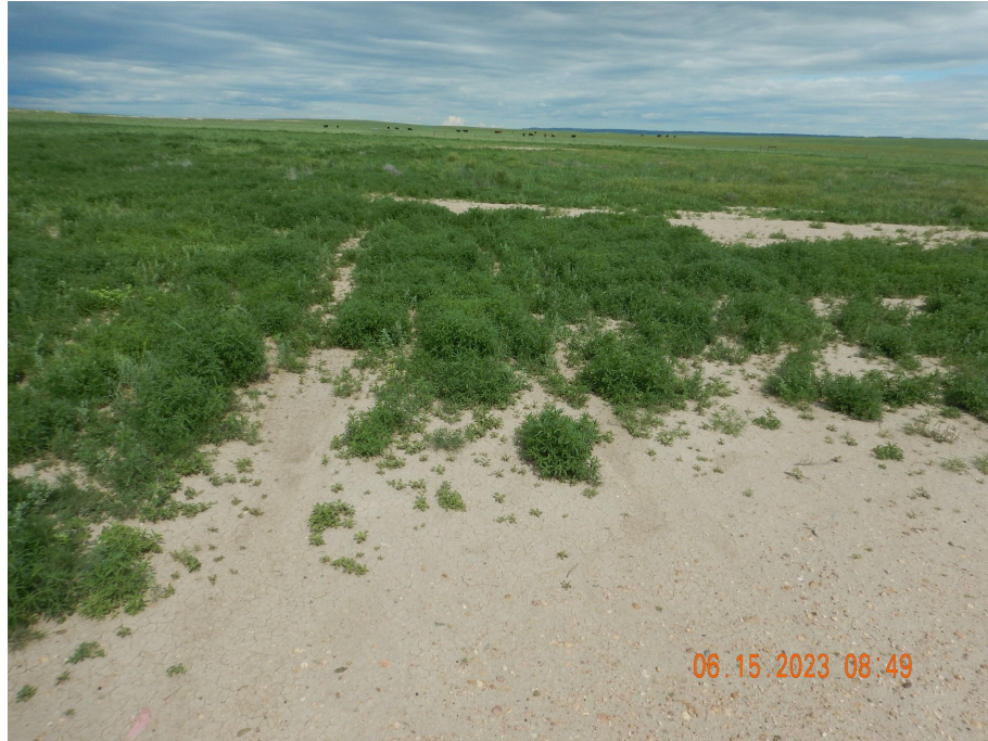
Photo 2. Photo taken from the entrance of location, facing West. Photo illustrates the location consists mostly of weeds with little to no perennial vegetation that is not reflective of reference areas.