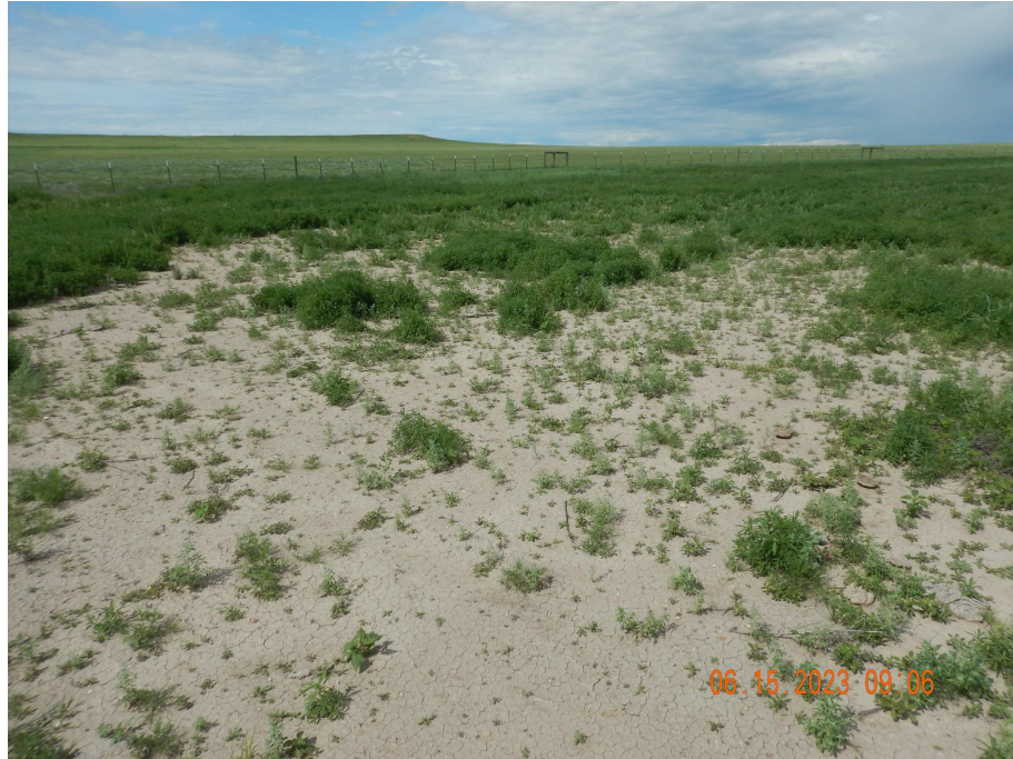
Photo 4. Photo taken from the southern location, facing West. See comments under Photo 2.