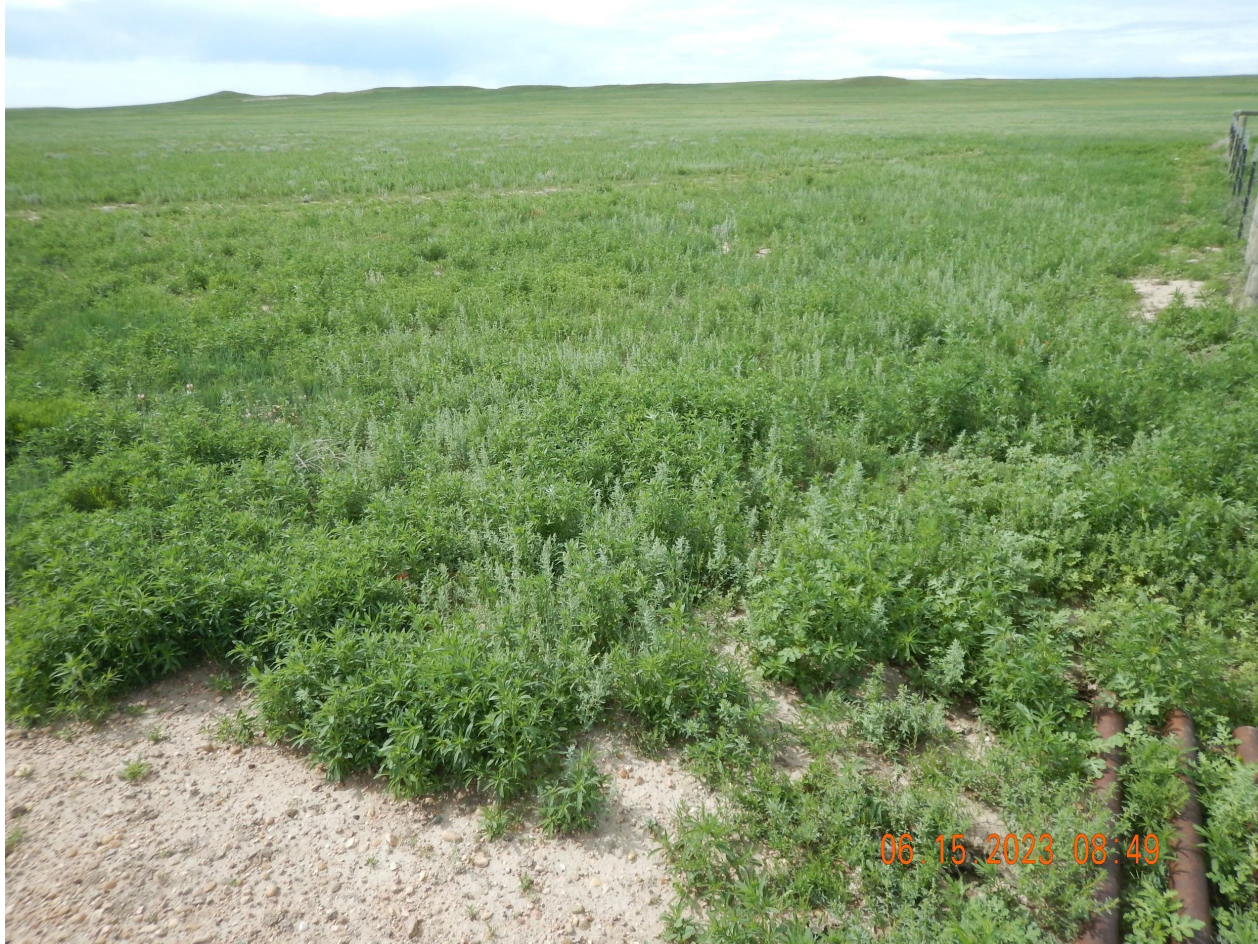
Photo 6. Photo taken from the entrance of location just outside of the location fencing, facing South. Photo illustrates weedy annual vegetation has spread off location.