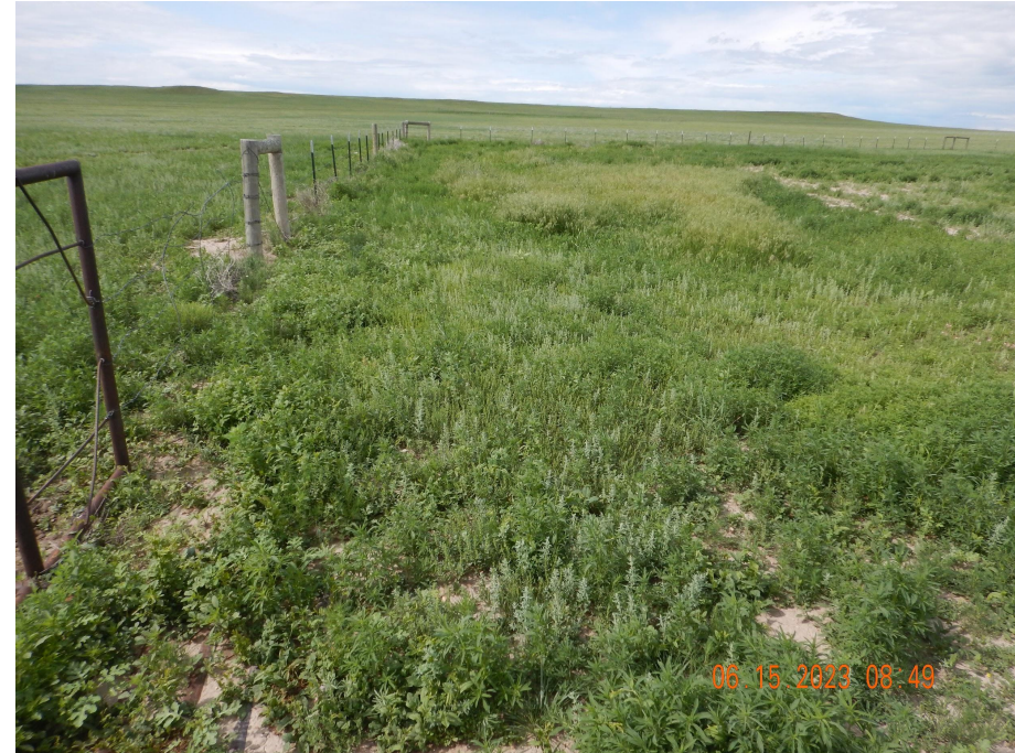
Photo 3. Photo taken from the entrance of location, facing South. See comments under Photo 2.