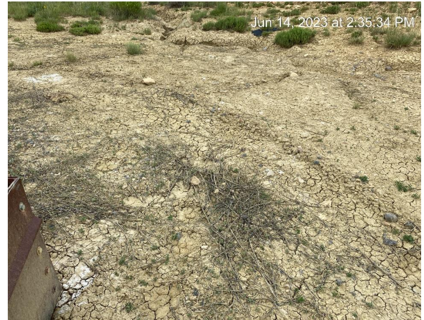
Erosion away from corner of containment