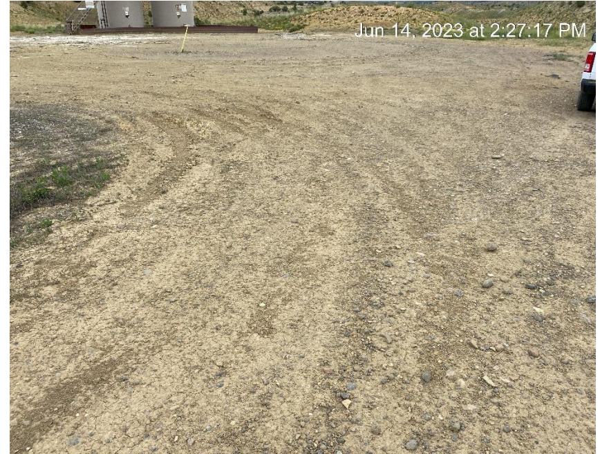
Entrance to location