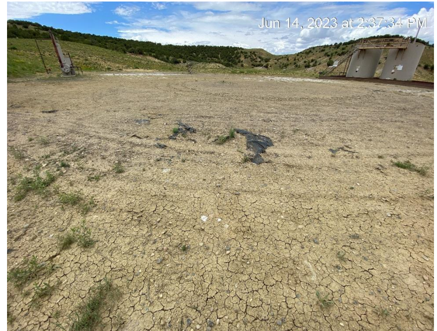
Location view from Southeast corner