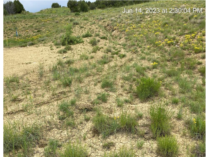
Erosion and soil migration entering location