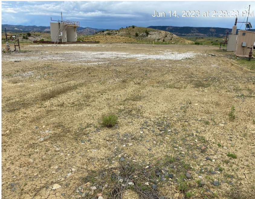
Location view from Southwest corner