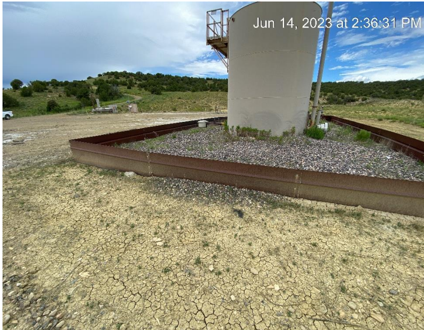
Location view from Northeast corner