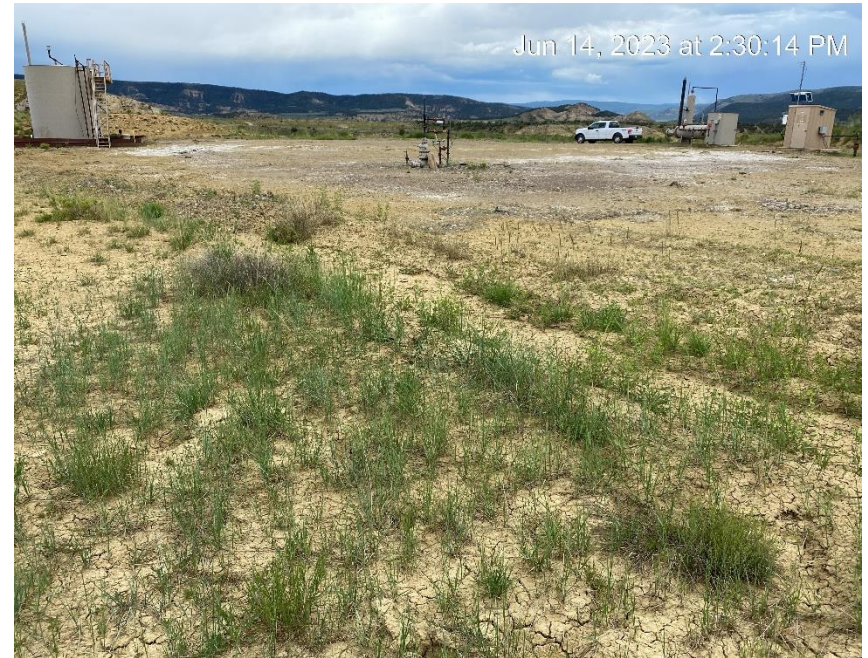
Location view from Northwest corner