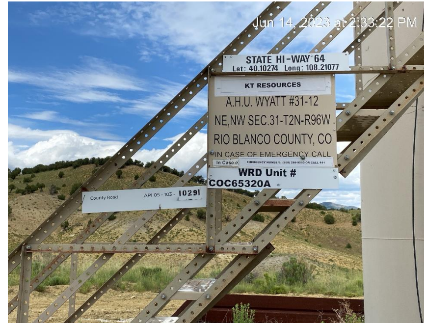
Tank battery signs