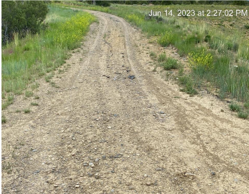
Access road to location