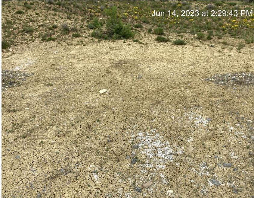
Soil migration on to location