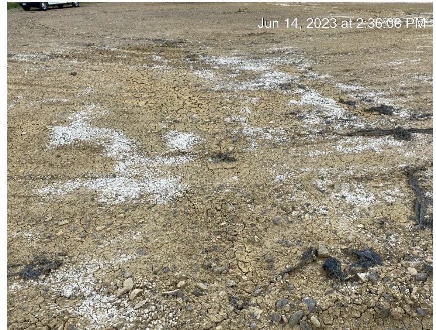
Lack of staibilization