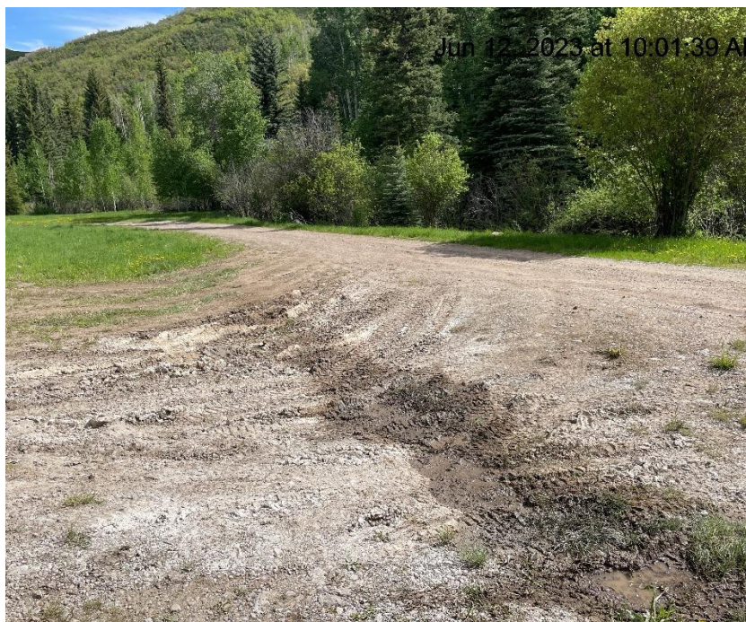
Photo # 108 Lack of stabilization/compaction/ Insufficient tracking BMP's