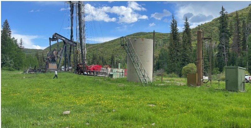
South West corner of location.