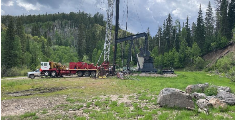
North West corner of location.