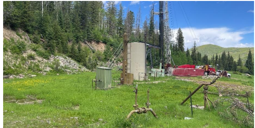
South East corner of location.