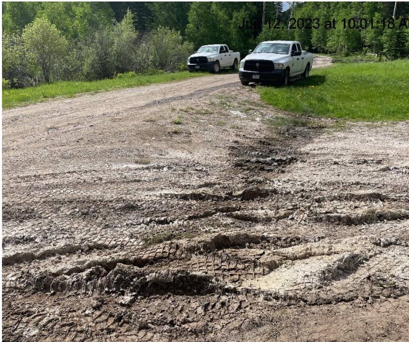
Photo # 106 Lack of stabilization/compaction/ Insufficient tracking BMP's