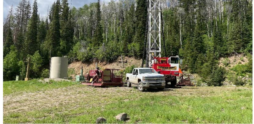
North East corner of location.