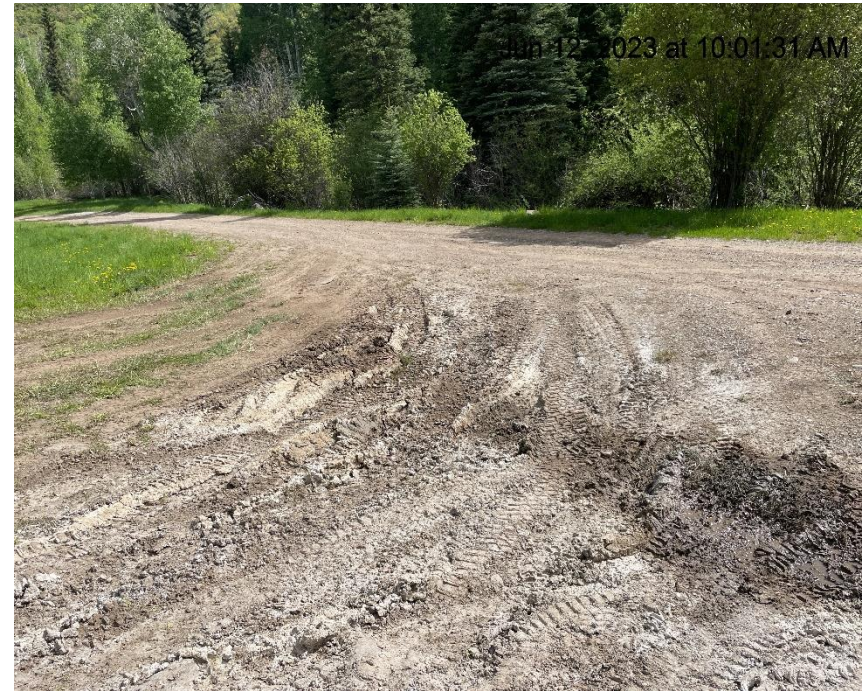
Photo # 107 Lack of stabilization/compaction/ Insufficient tracking BMP's