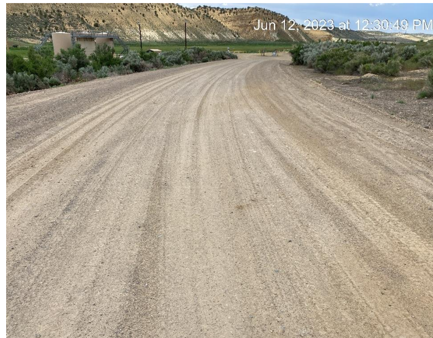
Tank battery from Southeast entrance