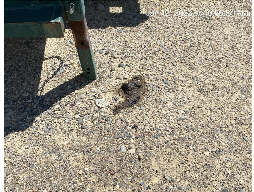
Stained soil from oily waste