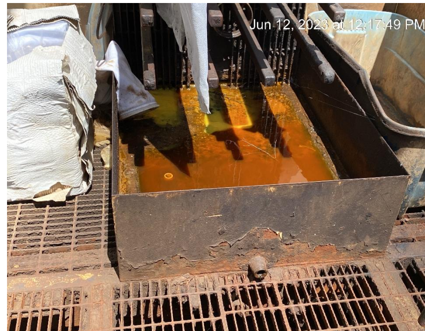
Open to wildlife