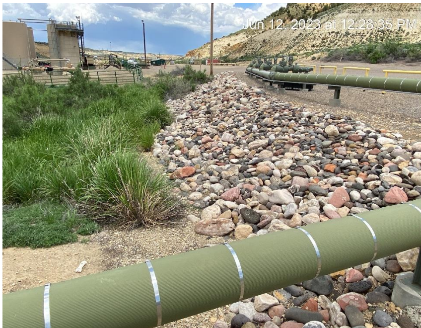
Tank battery from Southwest corner