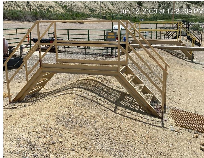
Tank battery from Northwest corner