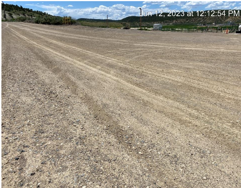
Tank battery from Northeast corner