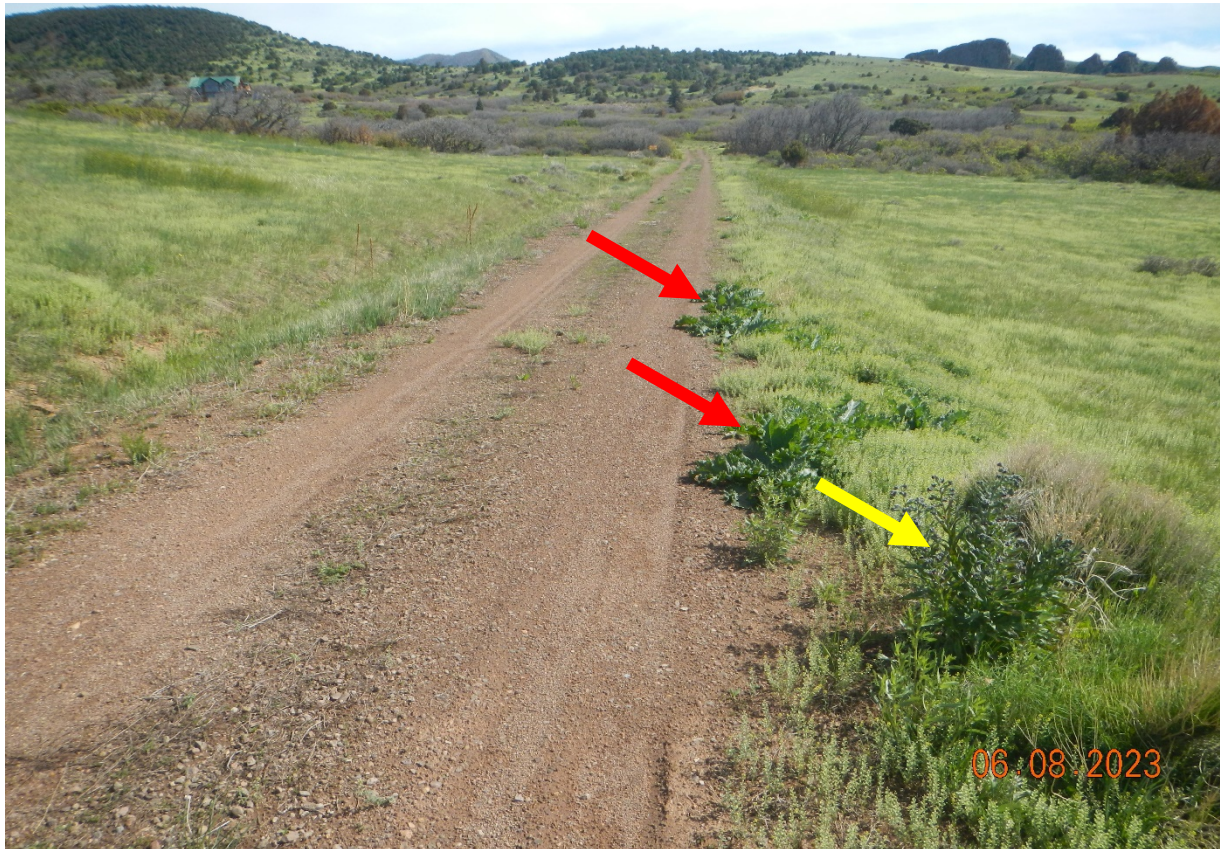
Photo 1. Facing north along the access road. There are noxious weeds along the road that need to be controlled. Red arrow → Scotch thistle Yellow arrow → Houndstongue