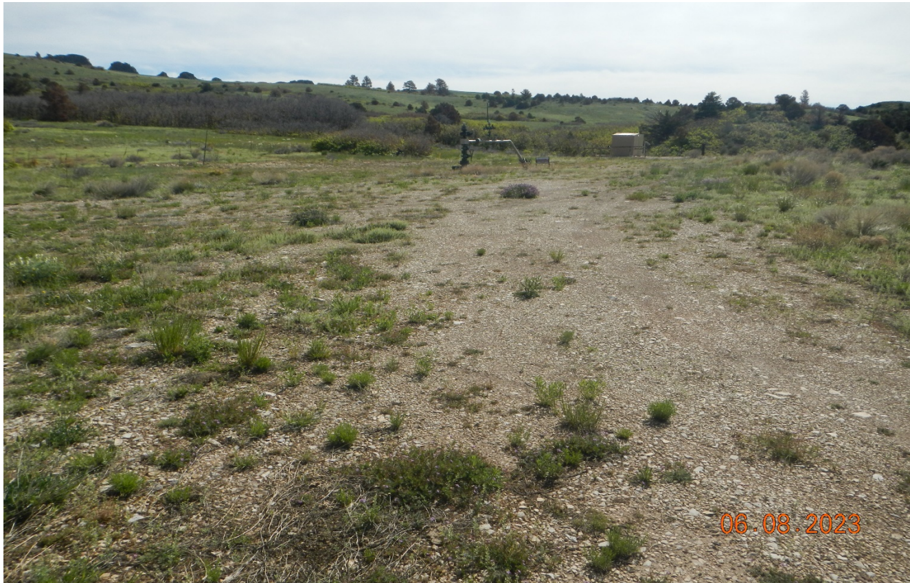
Photo 2. Facing northeast toward the multi well site.