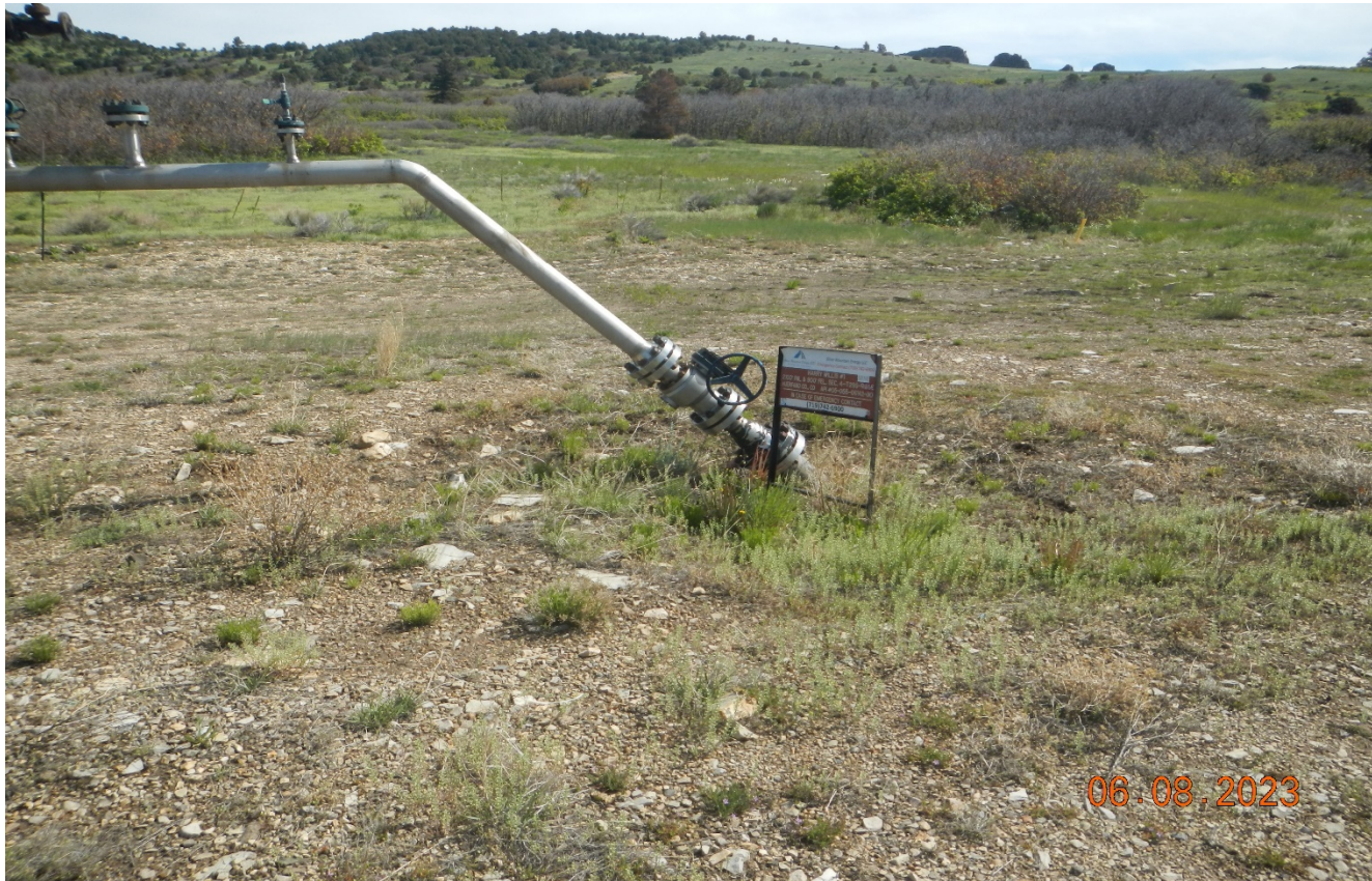
Photo 3. Well sign is posted at the well head and has been updated with current operator INFO.