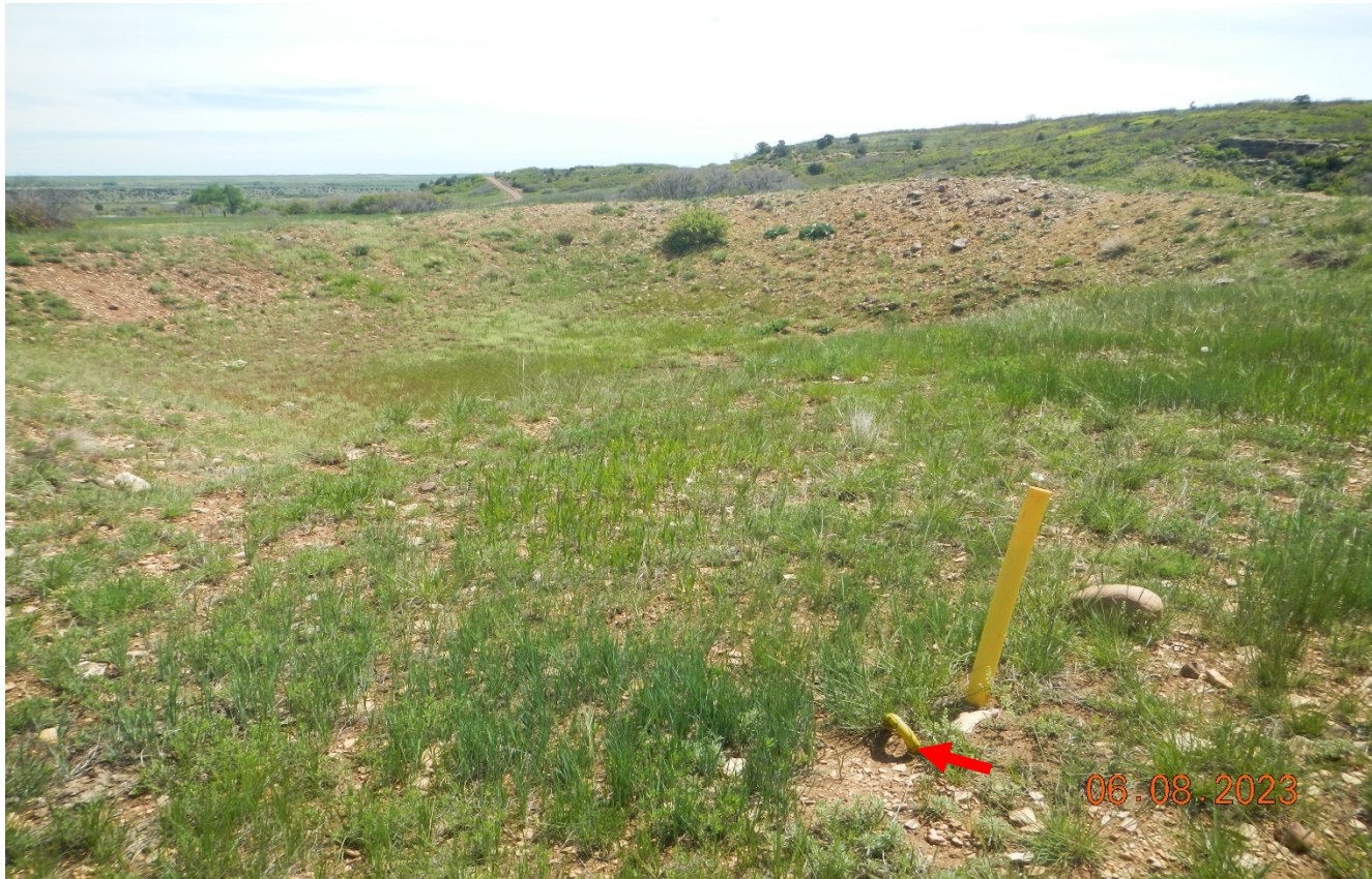
Photo 4. Facing northeast toward the pit which is approximately 100'x100' in size. Guyline anchor remains at red arrow.