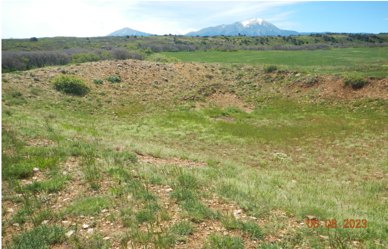
Photo 3. Facing southeast toward the pit which is approximately 100'x100' in size.