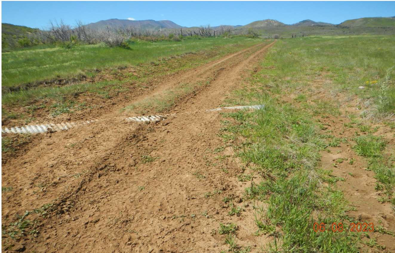
Photo 1. The culvert installed along the access road is not maintained and stormwater is bypassing the culvert. Lat/Long:37.50521,-105.07444. Previous corrective action has not been completed.