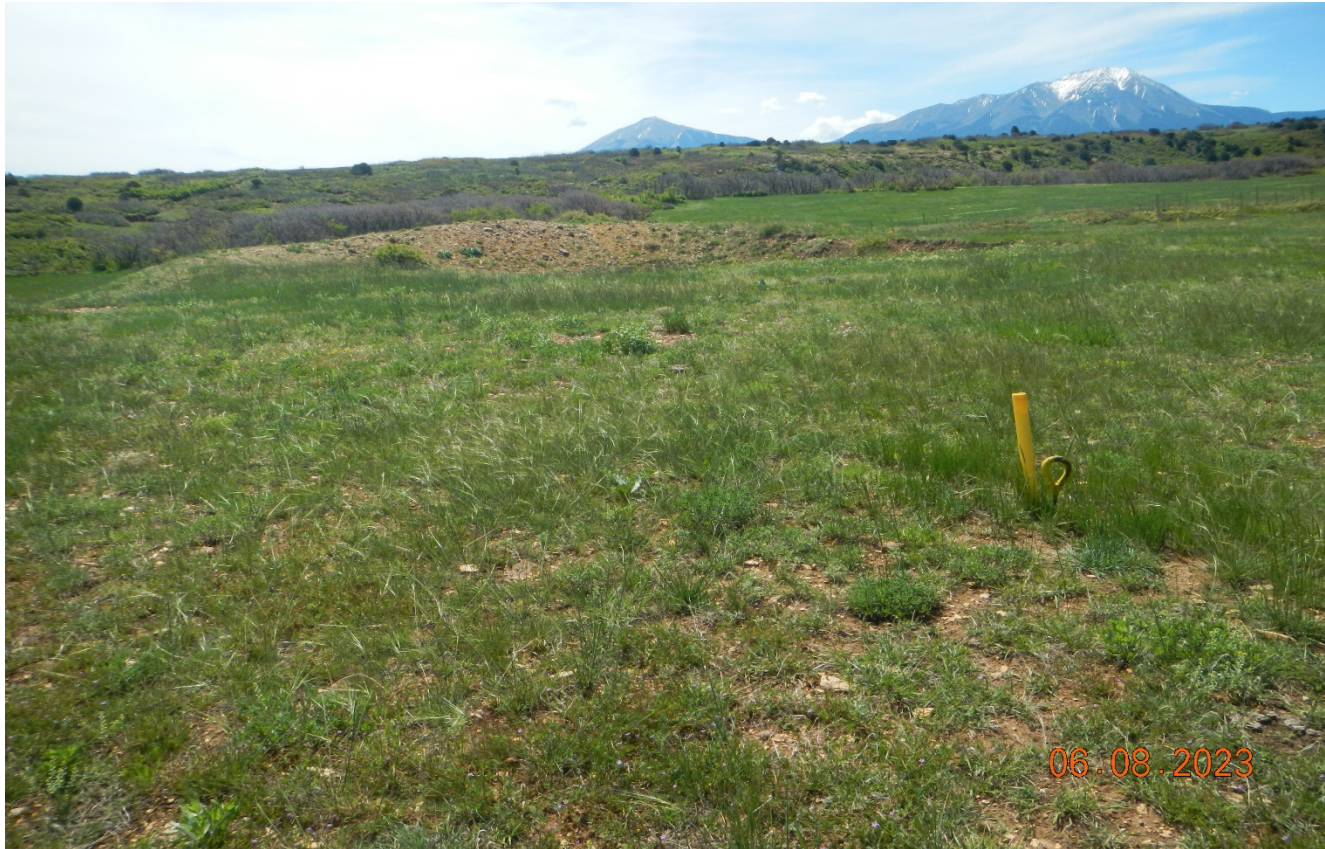
Photo 2. Facing southeast toward the location which was never recontoured and reclaimed per 1004 Rules. There are four guyline anchors that remain and the pit was not backfilled and reclaimed. Previous corrective action has not been completed.