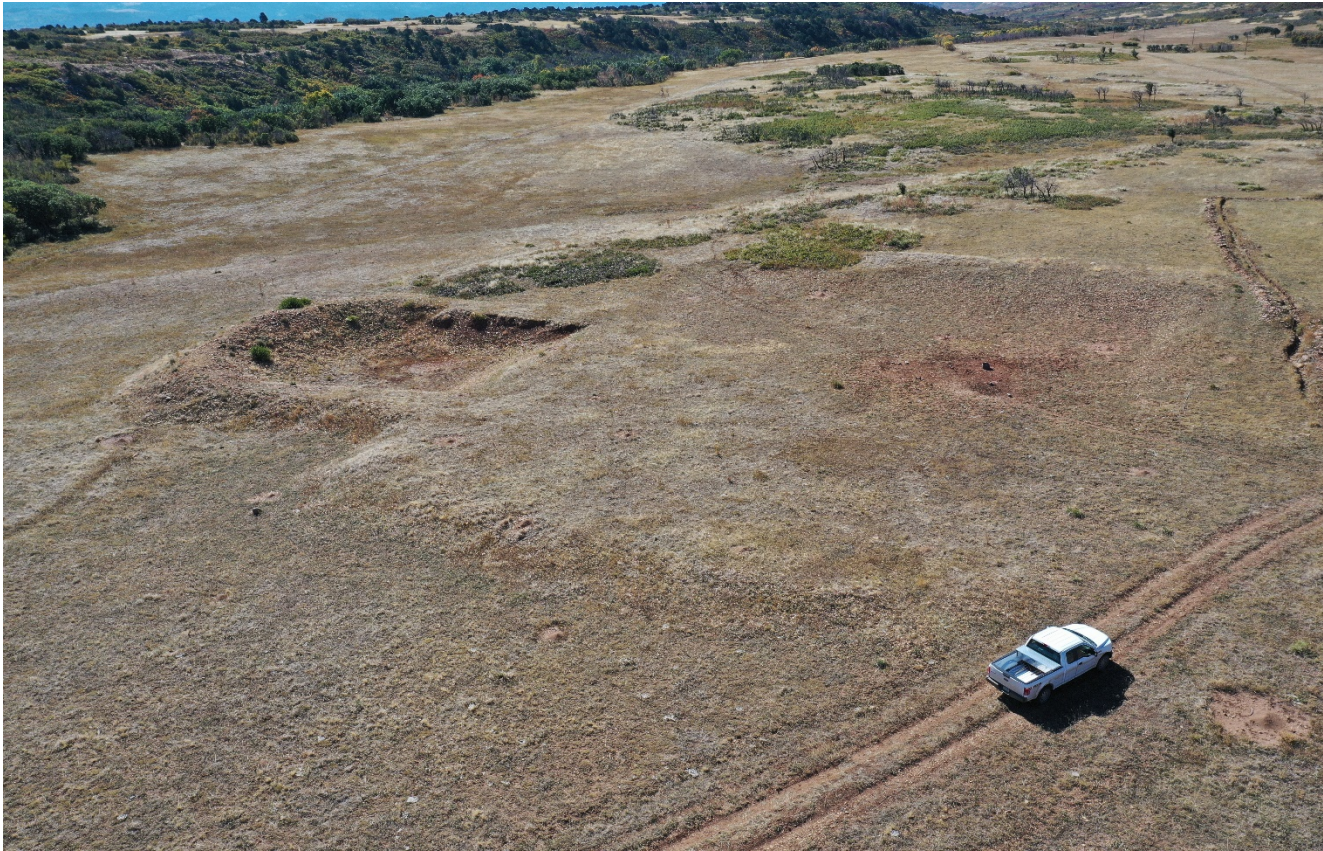
Photo 5. 2021 Drone aerial photo facing southeast toward the location disturbance which is approximately 1.3 acres.