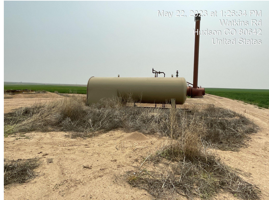
Photo 3. Photo taken of weeds on location.