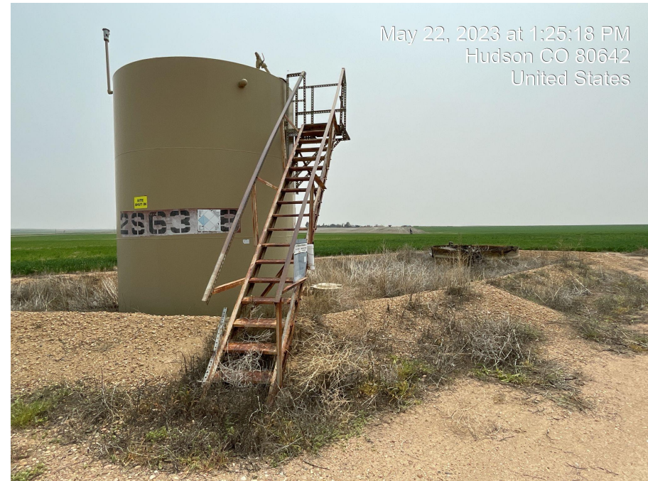
Photo 1. Photo taken of location sign.