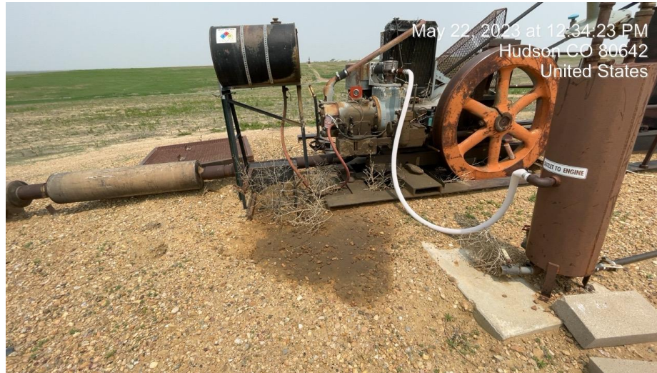
Photo 3. Photo taken of Weeds on location.