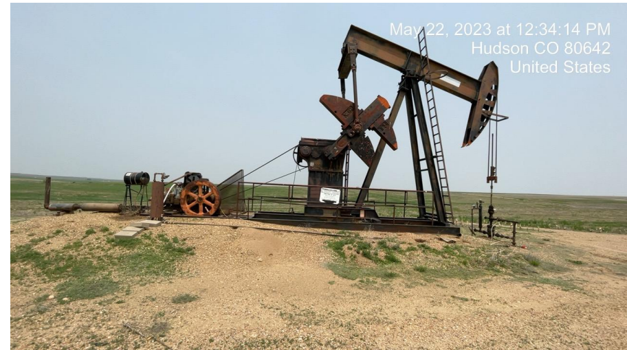
Photo 1. Photo taken of location sign.