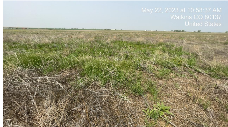
Photo 2. Photo of weeds and debris on location.