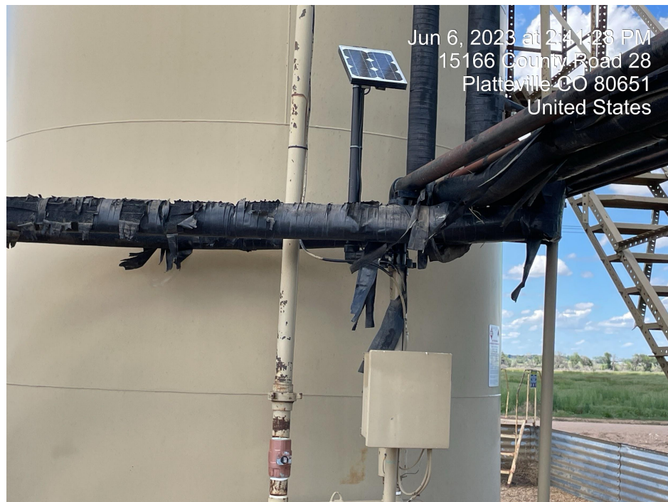
Photo 11. Photo taken from the associated offsite tank battery. Photo illustrates tape that is degrading. Tape and foam coming off piping, which is contributing to trash around the location.