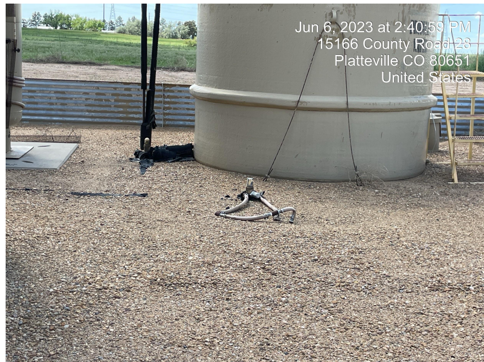
Photo 12. Photo taken from the associated offsite tank battery. Photo illustrate unused equipment being stored within secondary containment.