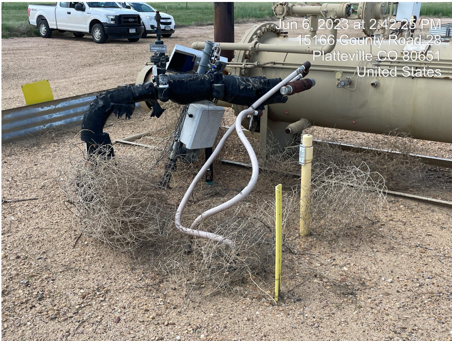
Photo 9. Photo taken from the associated offsite tank battery. Photo illustrates weed debris around equipment that appears to have blown in from the surrounding area.