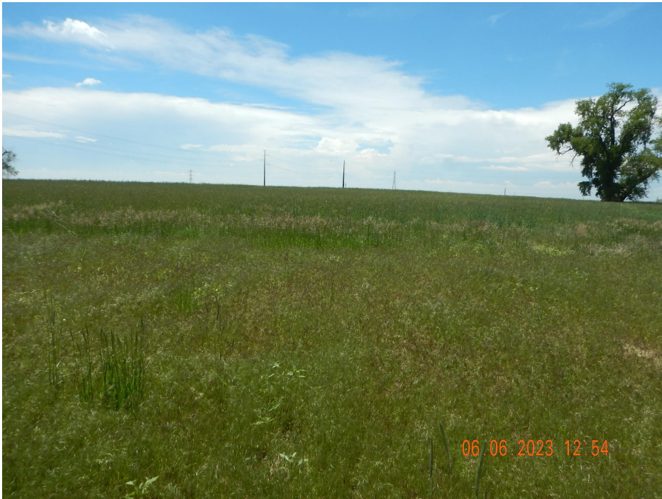
Photo 7. Photo taken south of the wellhead, facing West. See comments under Photo 6.