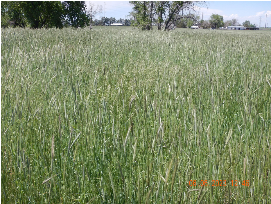
Photo 3. Photo taken from the northeastern area, facing West. Photo illustrates the current vegetation which is predominantly undesirable annual vegetation, Common rye.

Smooth brome was observed in small patches along the north-central and northwestern interim areas.