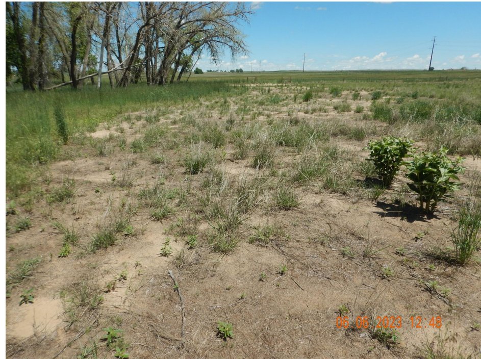
Photo 4. Photo taken north of the wellhead, facing East. Photo illustrates the area that was described in Photo 1 as being actively managed for weeds.

Smooth brome was observed in small patches along the north-central and northwestern interim areas.