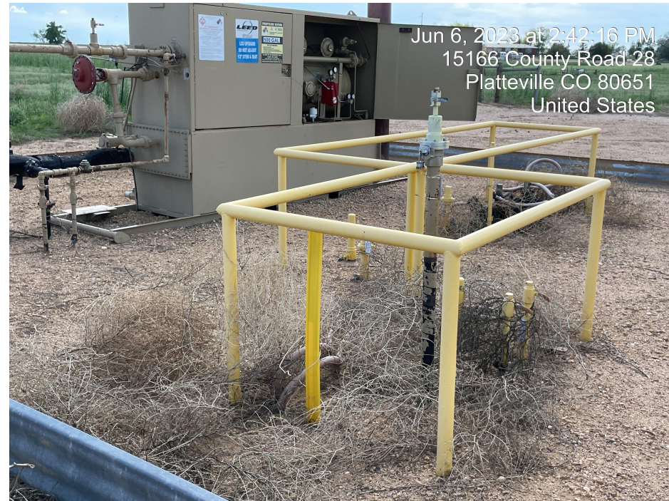
Photo 10. Photo taken from the associated offsite tank battery. See comments under Photo 9.