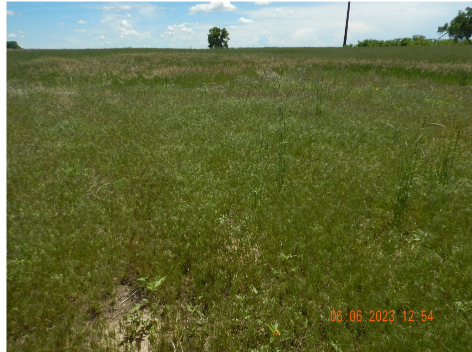
Photo 6. Photo taken south of the wellhead, facing South. Photo illustrates an area of cheatgrass establishment. It appears this area has decreased in Smooth brome presence.