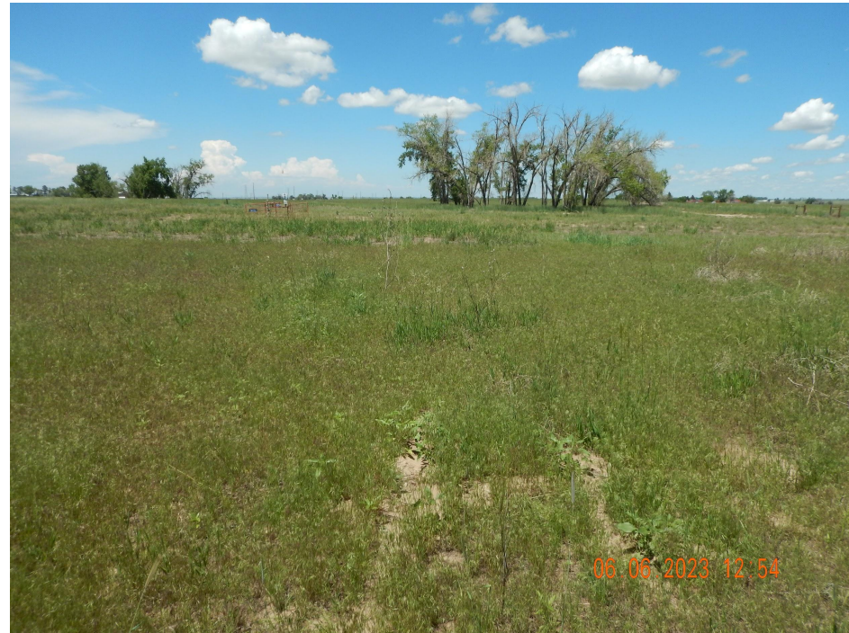
Photo 8. Photo taken south of the wellhead, facing North. See comments under Photo 6.