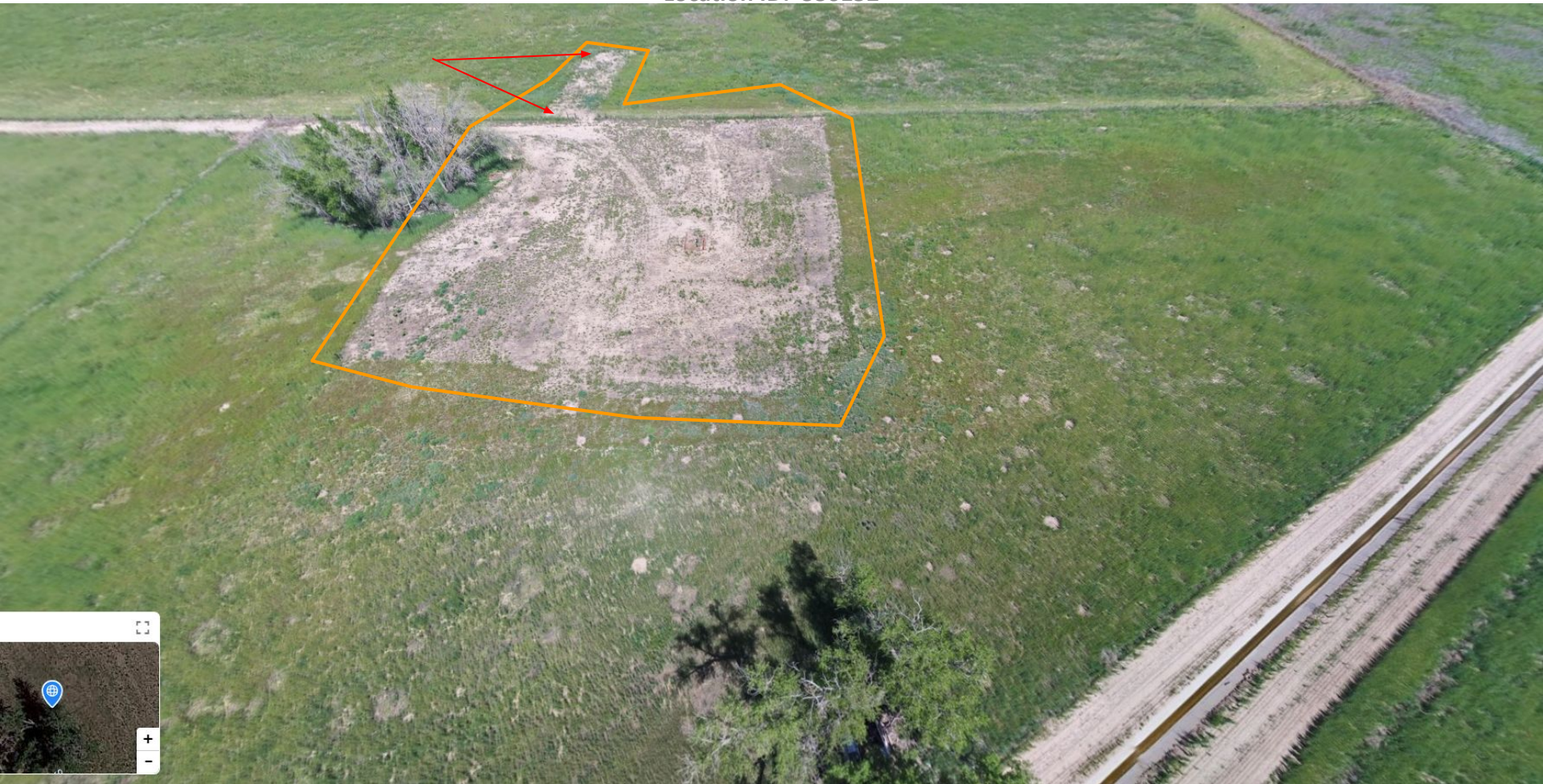
Photo 1. Drone aerial imagery illustrates the interim reclamation area for the HSR-Vadney location, a portion of the associated access road, and the Lorraine Adams property (red arrows). Photo illustrates weed management is being performed around the wellhead and Lorraine property (orange polygon), but the remainder of the interim area consists mostly of Common rye and Cheatgrass was observed in patches but more persistent south of the wellhead (reddish vegetative color). Smooth brome has established along portions of the northern interim area but has diminished around the wellhead and south of the wellhead where Cheatgrass was observed.