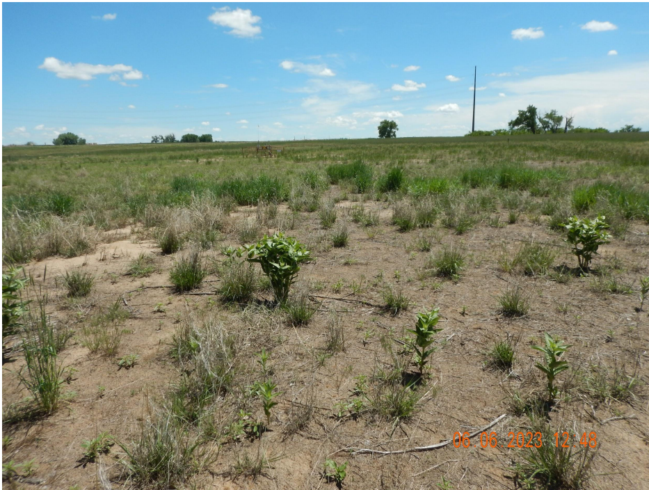
Photo 5. Photo taken north of the wellhead, facing South. See comments under Photo 4.