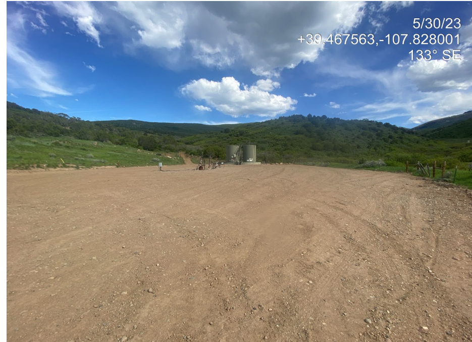
Photo 1. Photos taken from the north shows an overview of the location.