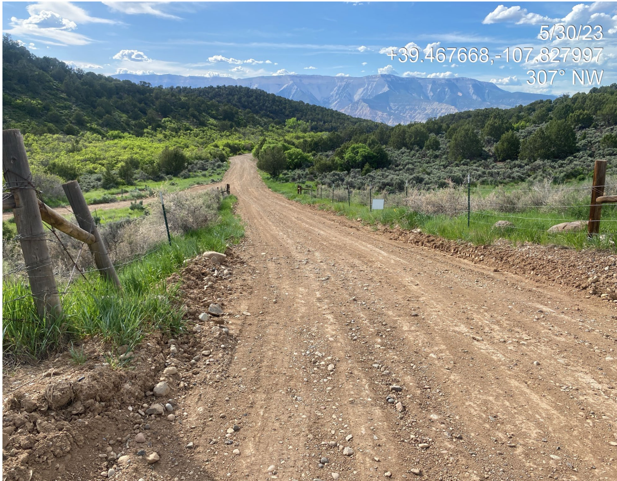
Photo 2. Photo shows the access road directly to the north of the location.