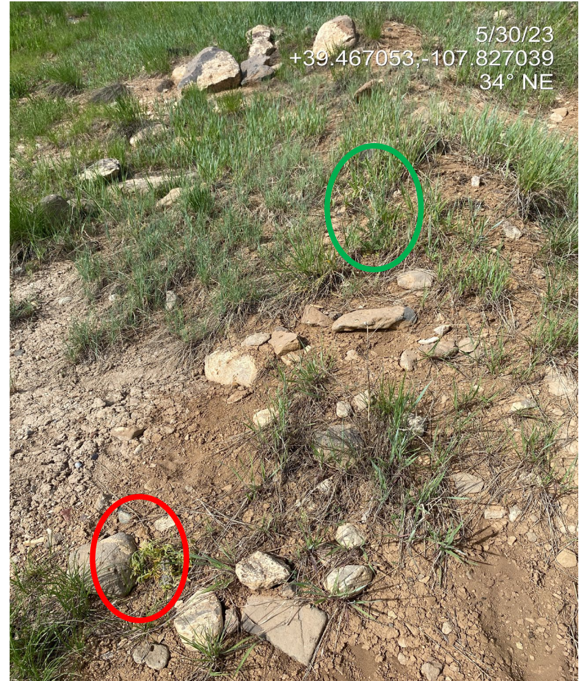
Photo 4. Photos show spotted knapweed in the southeast interim area. Photo left shows an untreated plant. Photo right shows treated (red) directly next to untreated (green) plants.