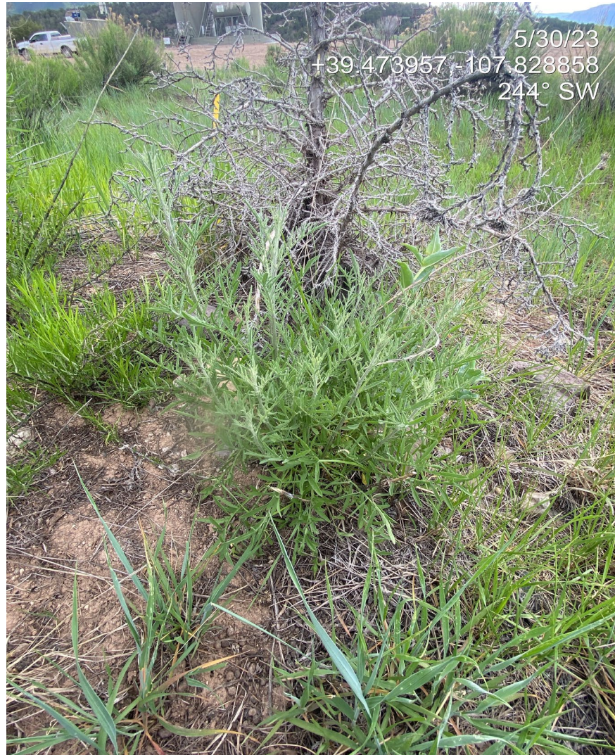
Photo 3. Photo shows untreated spotted knapweed (List B Noxious) in the eastern interim area.