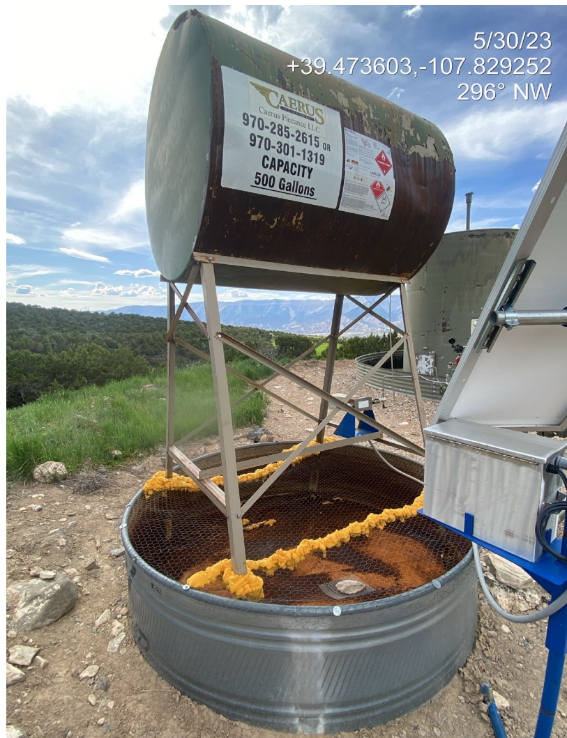
Photo 2. Photo shows impacted fluid within the methanol tank secondary containment has been removed and holes in the wire mesh wildlife protection BMP have been repaired.