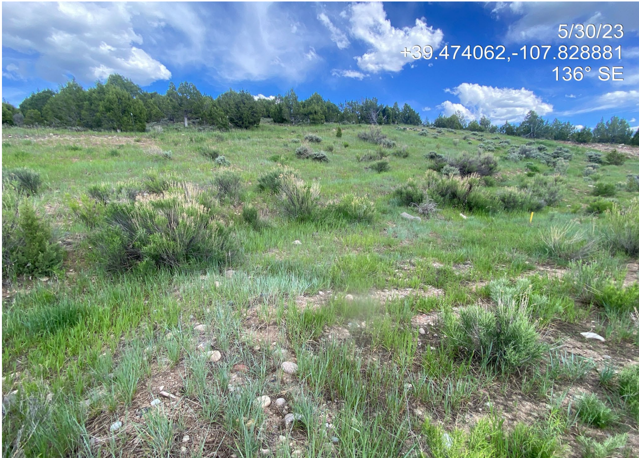
Photo 5. Photo shows an example of interim areas to the south.