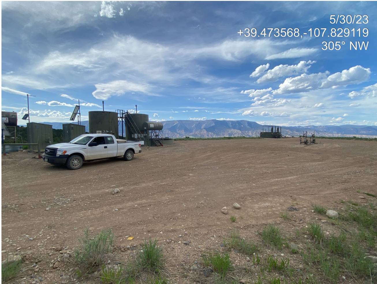
Photo 1. Photo taken from the east shows an overview of the location.