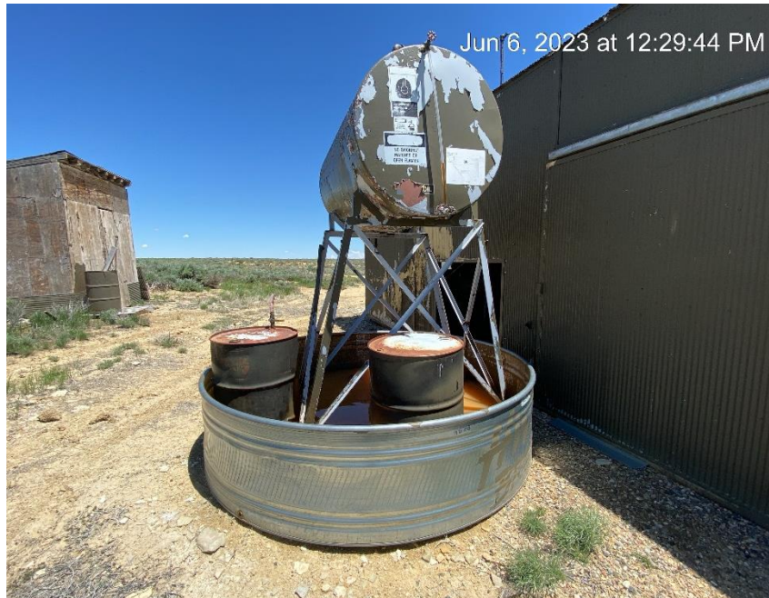
Unidentified tank missing required labels