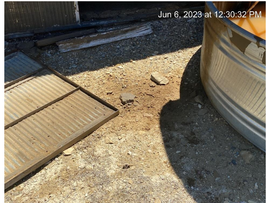
Debris. Stained soil