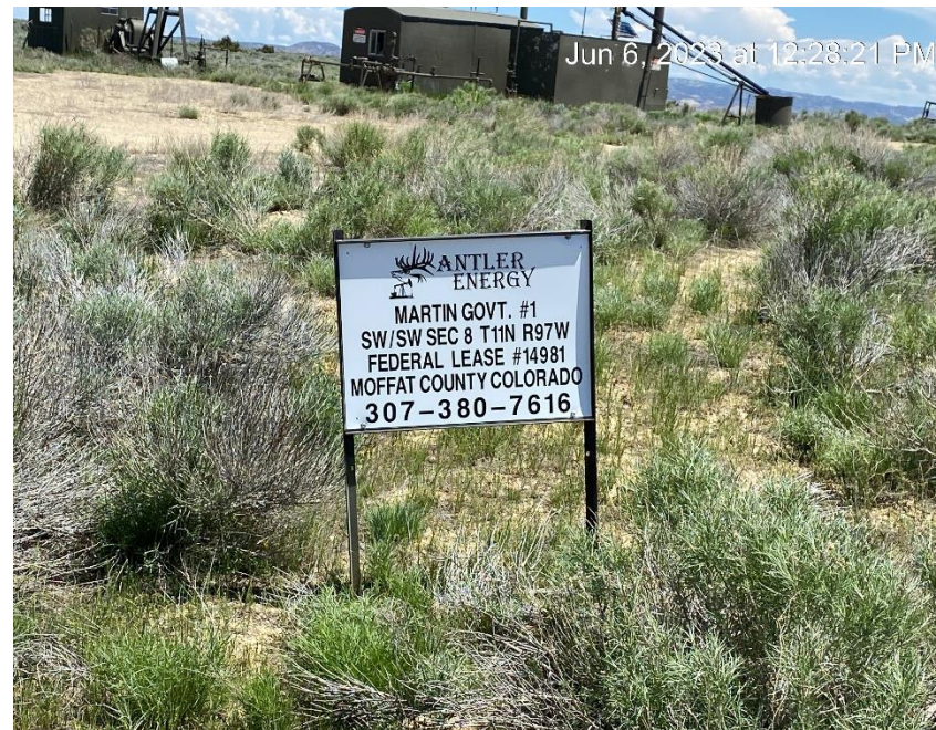
Sign entering location. No tank battery sign