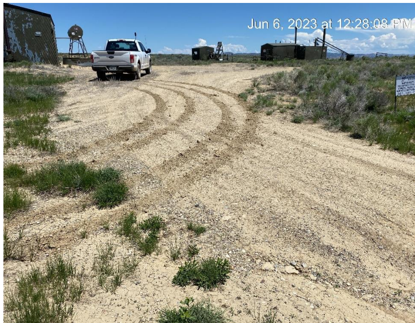
Entrance to location