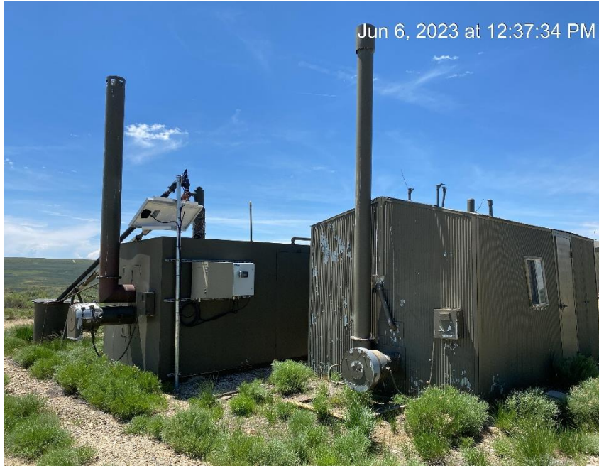
Stacks open to wildlife. Unused equipment.