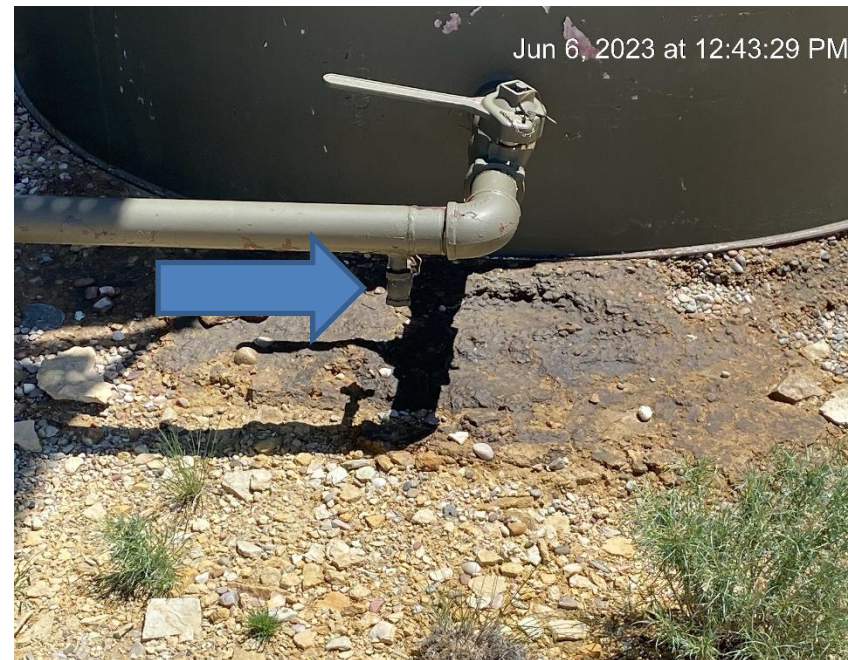
Open end tank valve. Stained soil