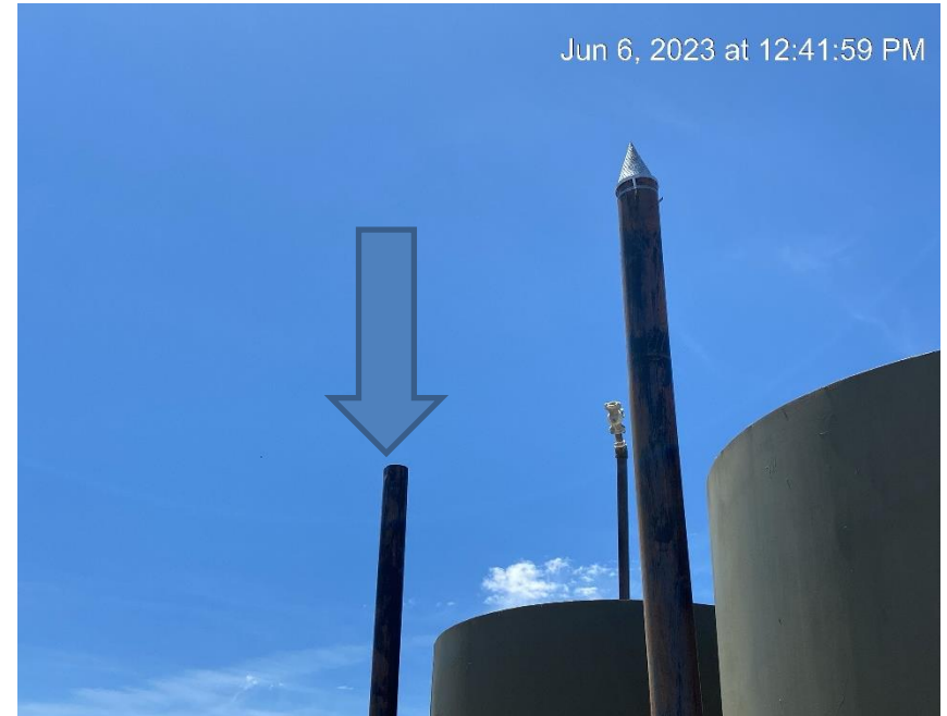
Missing wildlife protection