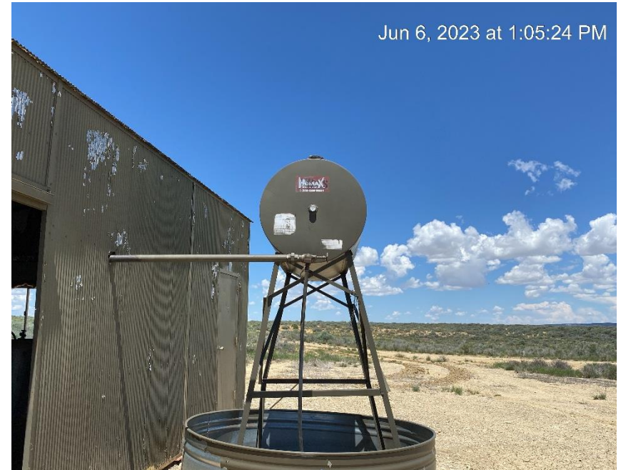
Unidentified tank missing required labels