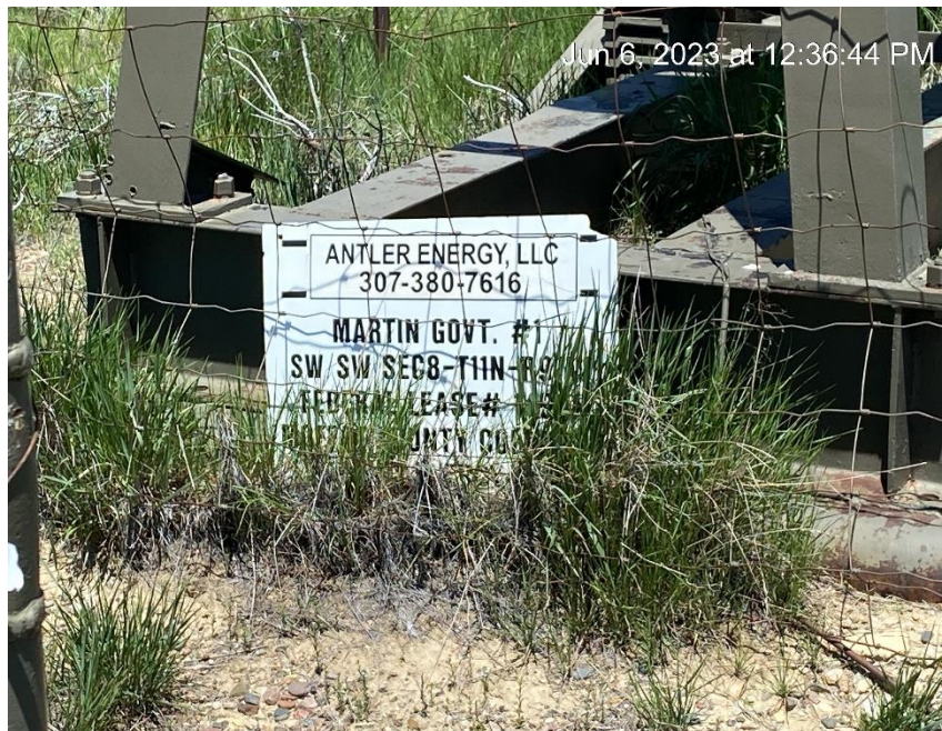
Wellhead sign on the ground missing required information