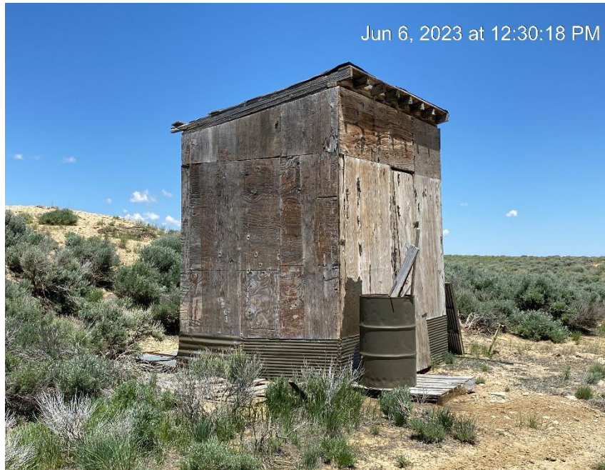
Unused equipment. Debris