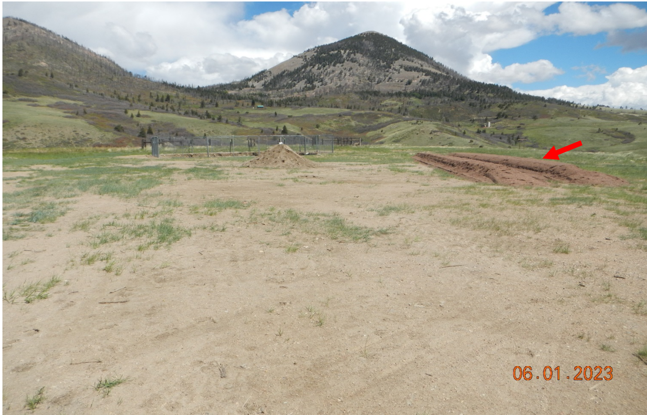
Photo 4. Facing north at the location. It appears impacted soils were removed and road base material has been hauled in shown at red arrow.