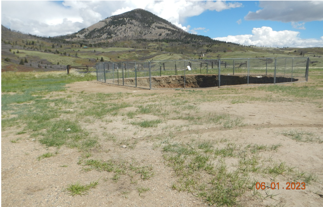
Photo 1. Facing northeast toward the wellsite. There is a large excavation around the wellhead has been fenced off to prevent entry.