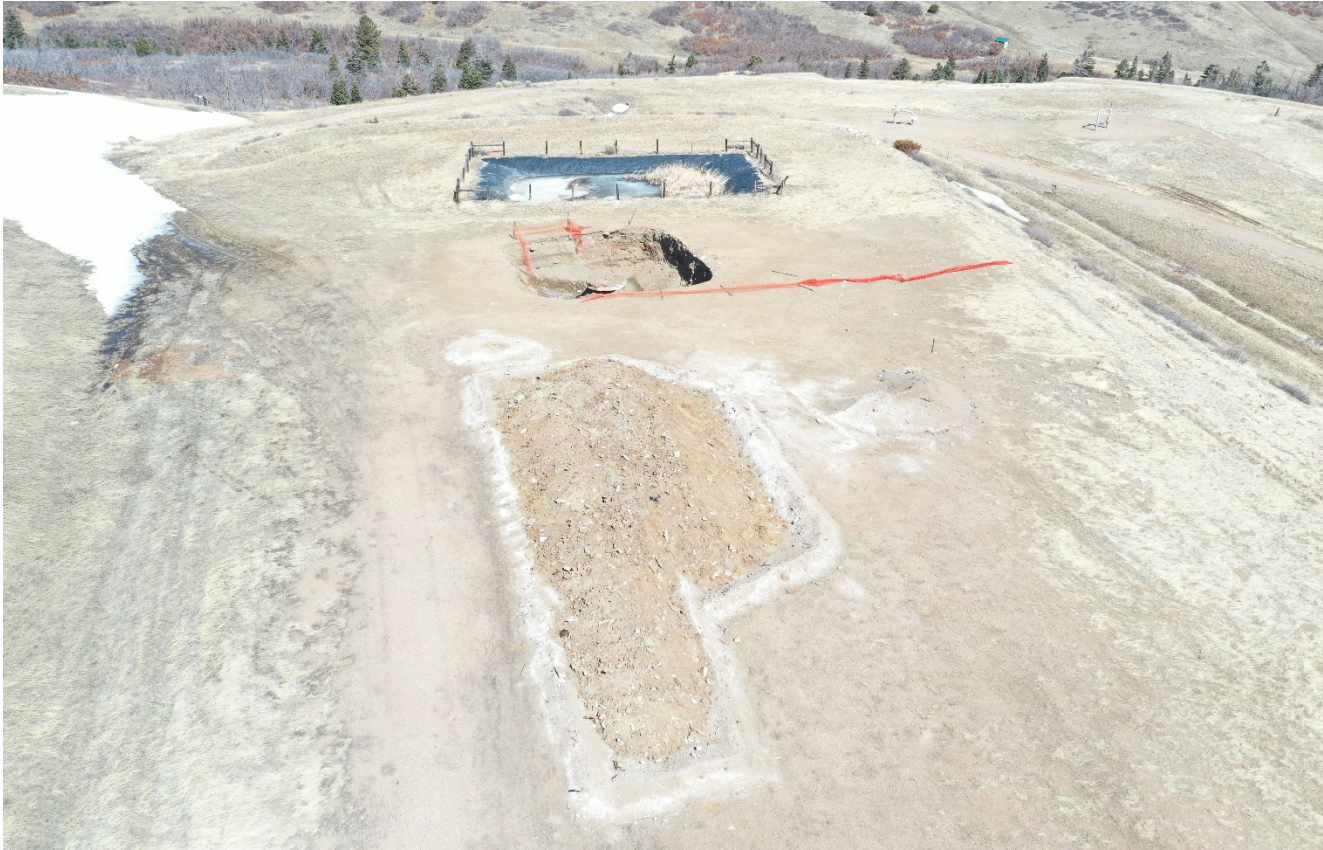
Photo 5. Taken during previous inspection on 4/10/2023. Drone aerial photo facing northwest toward the wellsite.