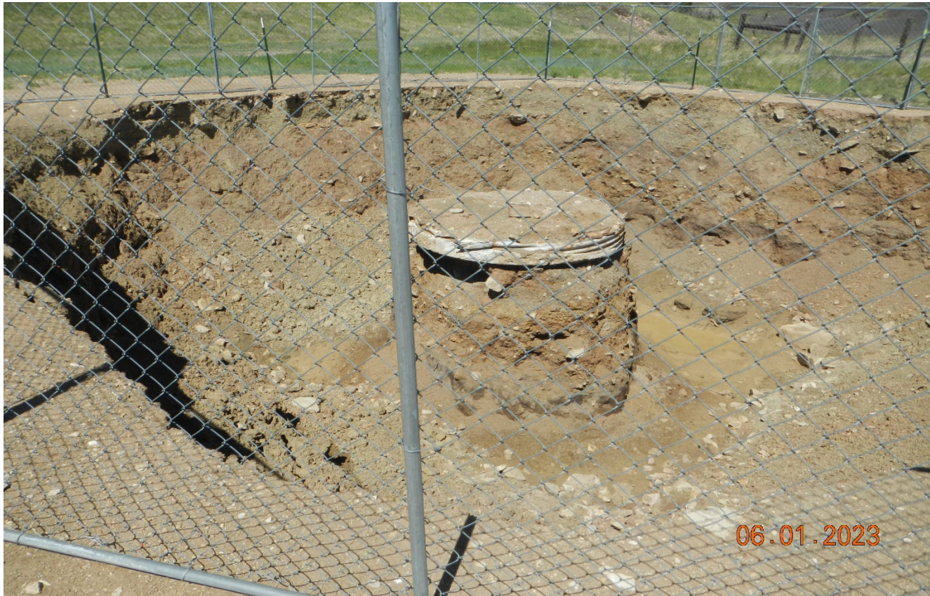
Photo 2. There is a large excavation around the wellhead approx. 15ft deep by 15'w. The wellhead will need to be cut an capped far enough below grade to allow proper recontouring.