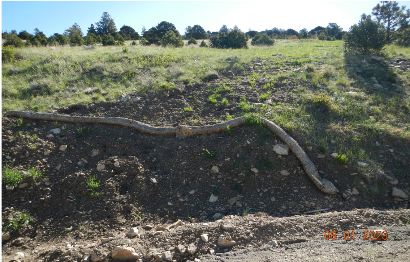
Photo 10. Facing opposite from previous phot across the road. There is a displaced wattle that needs maintenance.