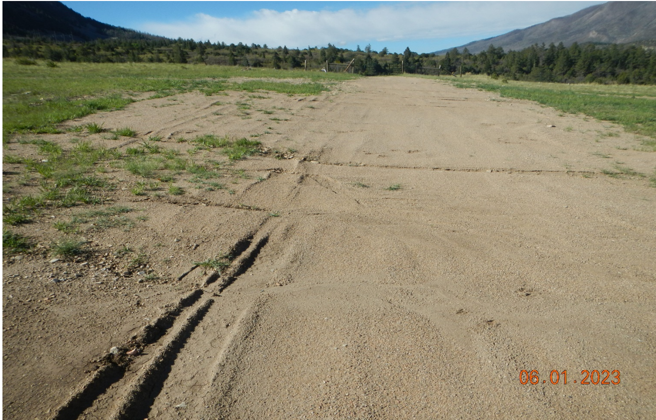
Photo 3. Facing south toward the access road. There is a lot of backfill material that remains and is not stabilized.