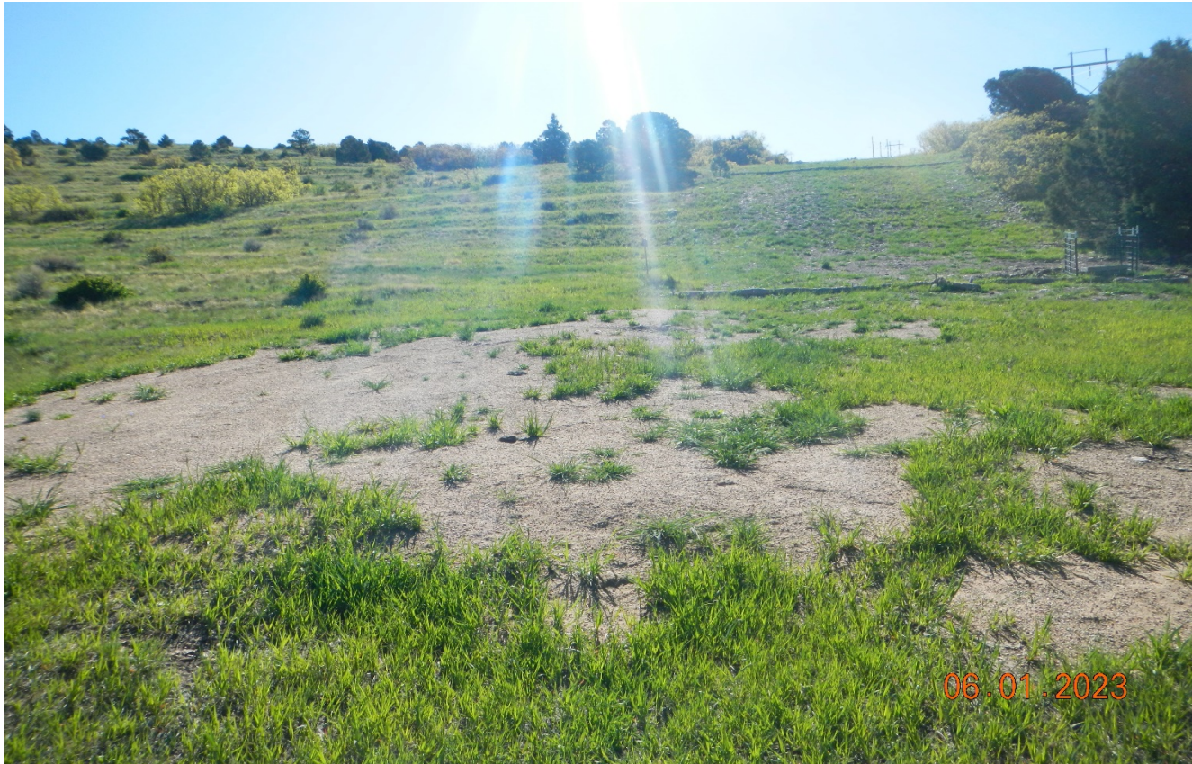
Photo 1. Just west wellsite along the flowline where there was recent disturbance and reclamation. This area has not established vegetation and there is still backfill gravel that remains. This area needs additional reclamation and gravel removal. Lat/Long: 37.6997, -105.20816.