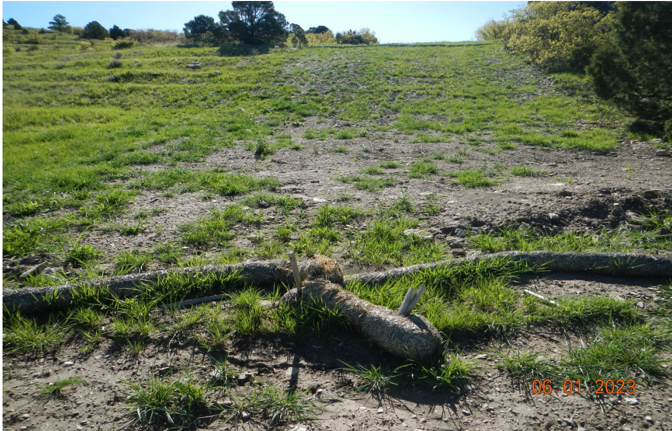
Photo 2. Facing east along the flowline. There is a displaced wattle that needs to be repaired or removed. Lat/Long:37.6997,-105.20816.