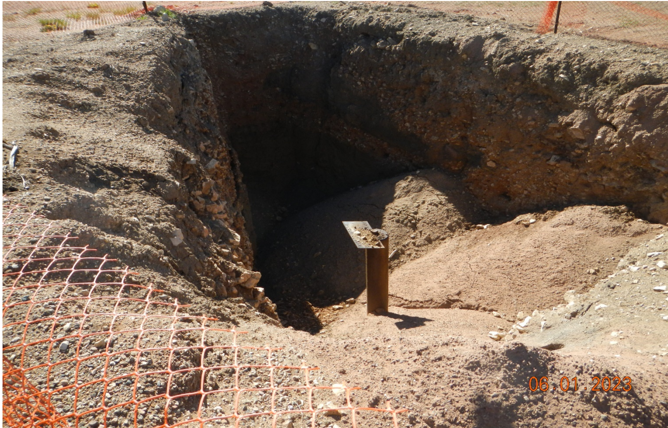
Photo 7. The wellhead has been cut and capped. The wellhead should be cut low enough to accommodate recontouring of the location.