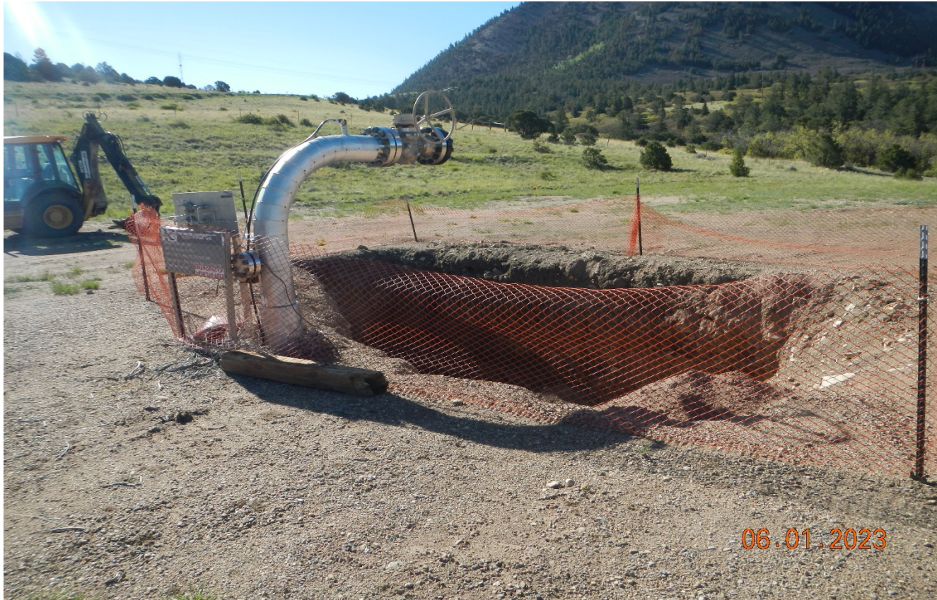
Photo 6. Facing toward the wellsite which has been excavated and plugged and abandoned.