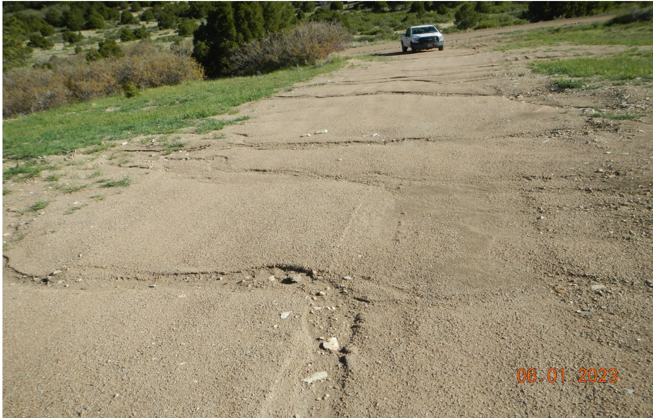
Photo 4. Facing back north toward the access road. There is erosion occurring across the road which is transporting sediment material offsite.