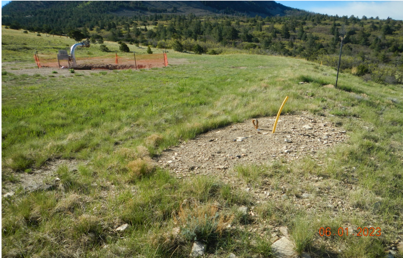
Photo 8. Facing southeast toward the location.