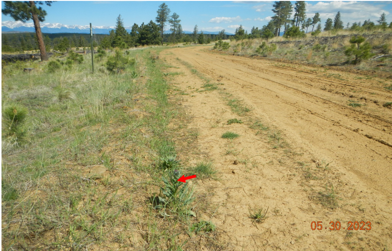
Photo 1. Facing northwest along the access road. There are numerous noxious weeds along the access road that have not been controlled. The red arrow points to List B noxious weed - Houndstongue.