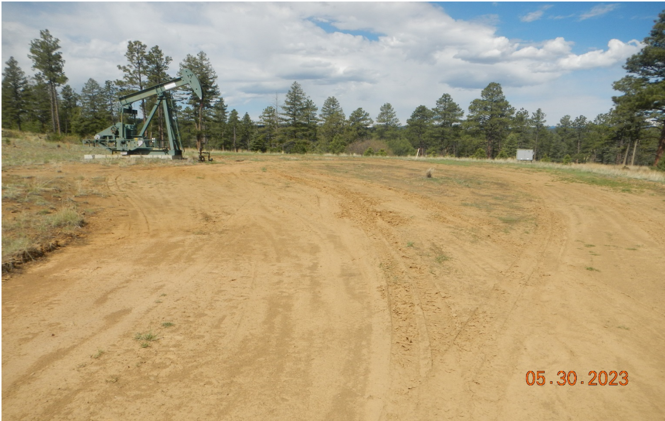
Photo 4. Facing northwest toward the wellsite.