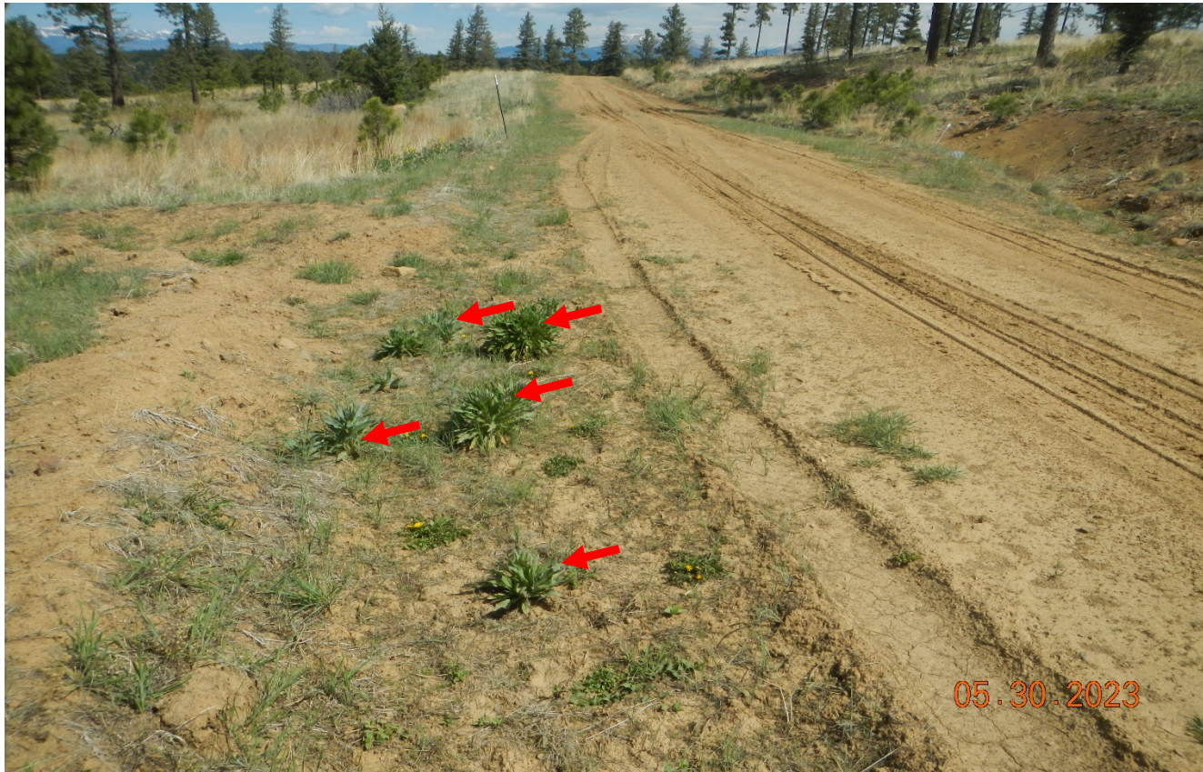
Photo 2. There are numerous noxious weeds along the access road that need to be controlled. The red arrows points to List B noxious weed - Houndstongue.