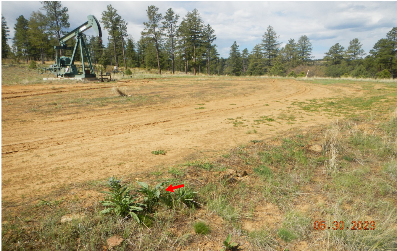
Photo 5. There are numerous noxious weeds at the location that need to be controlled. The red arrow points to List B noxious weed - Houndstongue.