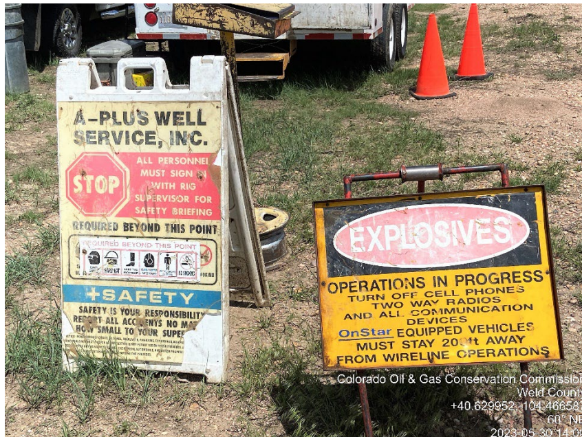
Photo #3 Bethyl GW 29-12 Wellsite Plugged & Abandoned | PA Plugging Ops: Cementing: 2ndry plugs Site safety signage