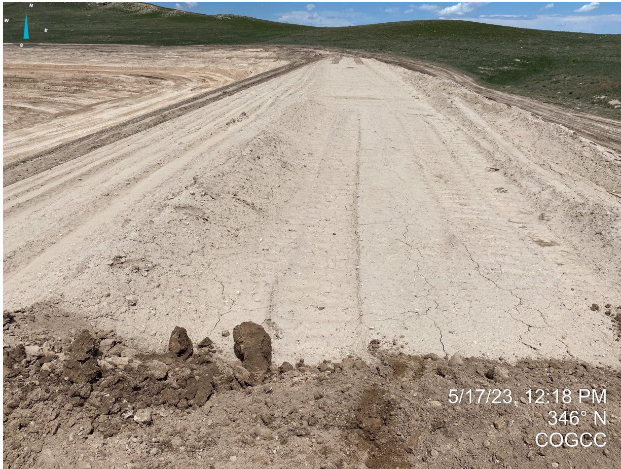
Photo 9. Taken from the southern end of the stockpile; see comments in Photo 5.