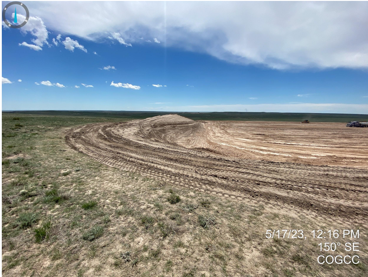
Photo 4. Northeast corner. See comments in Photo 2. Also pictured, topsoil stockpile in the background.