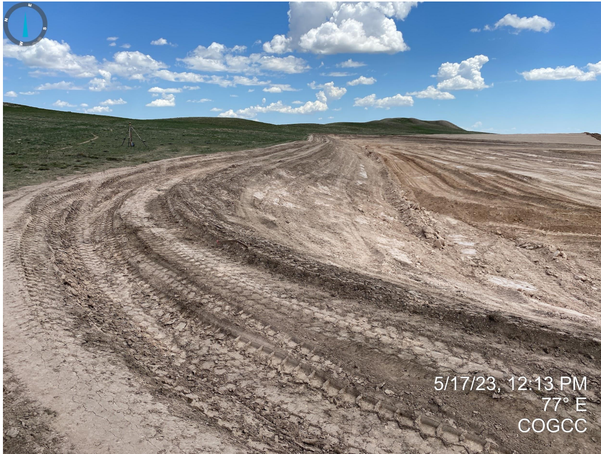
Photo 2. Northwest corner. Stormwater ditch and berm BMP installed. Also pictured, cut and fill operations after the topsoil has been salvaged.