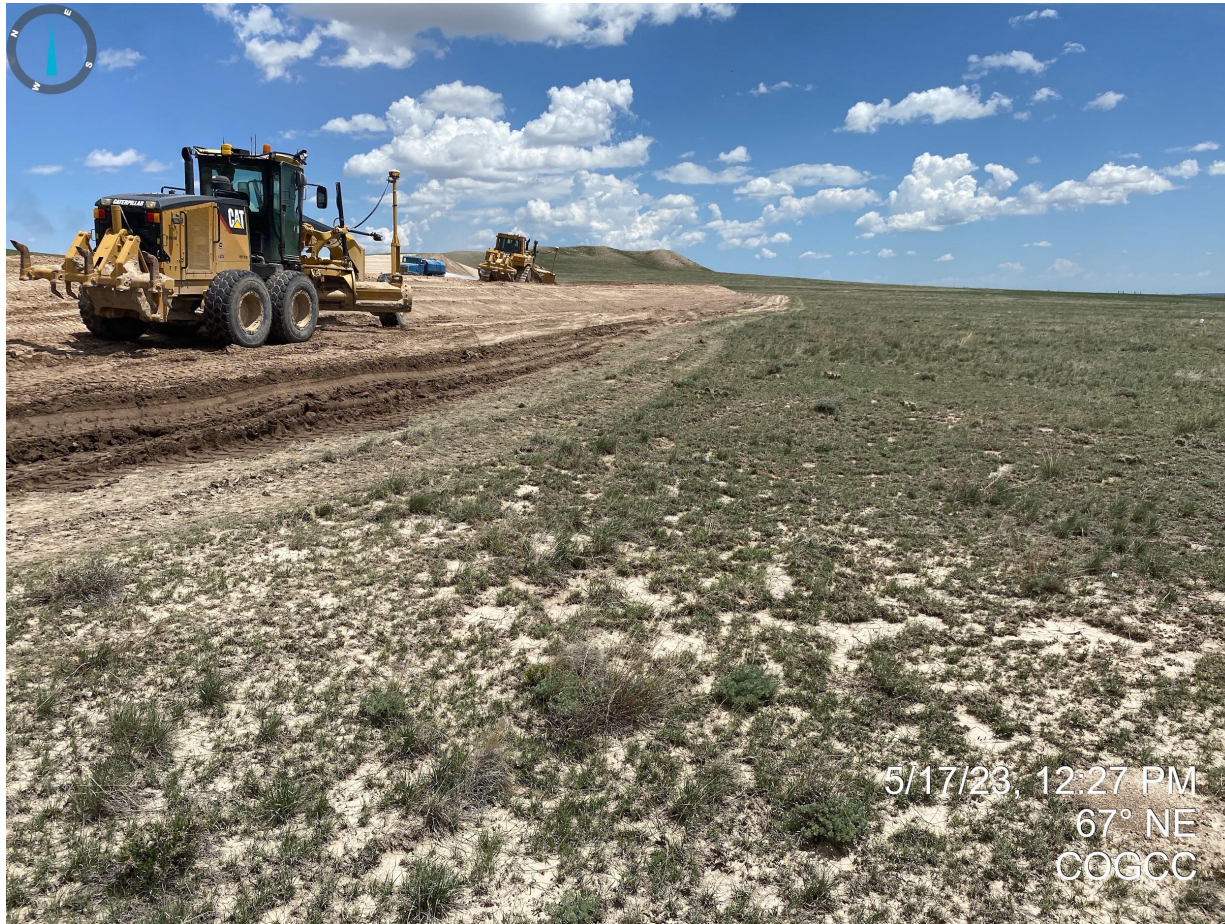
Photo 11. Southwest corner. On site crews were in the process of shaping fill areas and constructing the sediment trap/detention area at the time of this inspection. A follow-up inspection will be conducted at a later date to ensure compliance with 1002.f Rules and Operator submitted stormwater management plan.