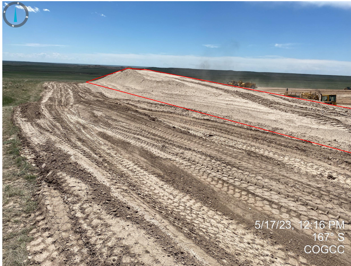
Photo 5. Facing south towards the topsoil stockpile. Photo illustrates that at the time of this inspection, the stockpile did not and any evidence of stabilization BMPs (e.g. equipment tracking). Subsequent photos illustrates evidence of rill erosion on the stockpile.