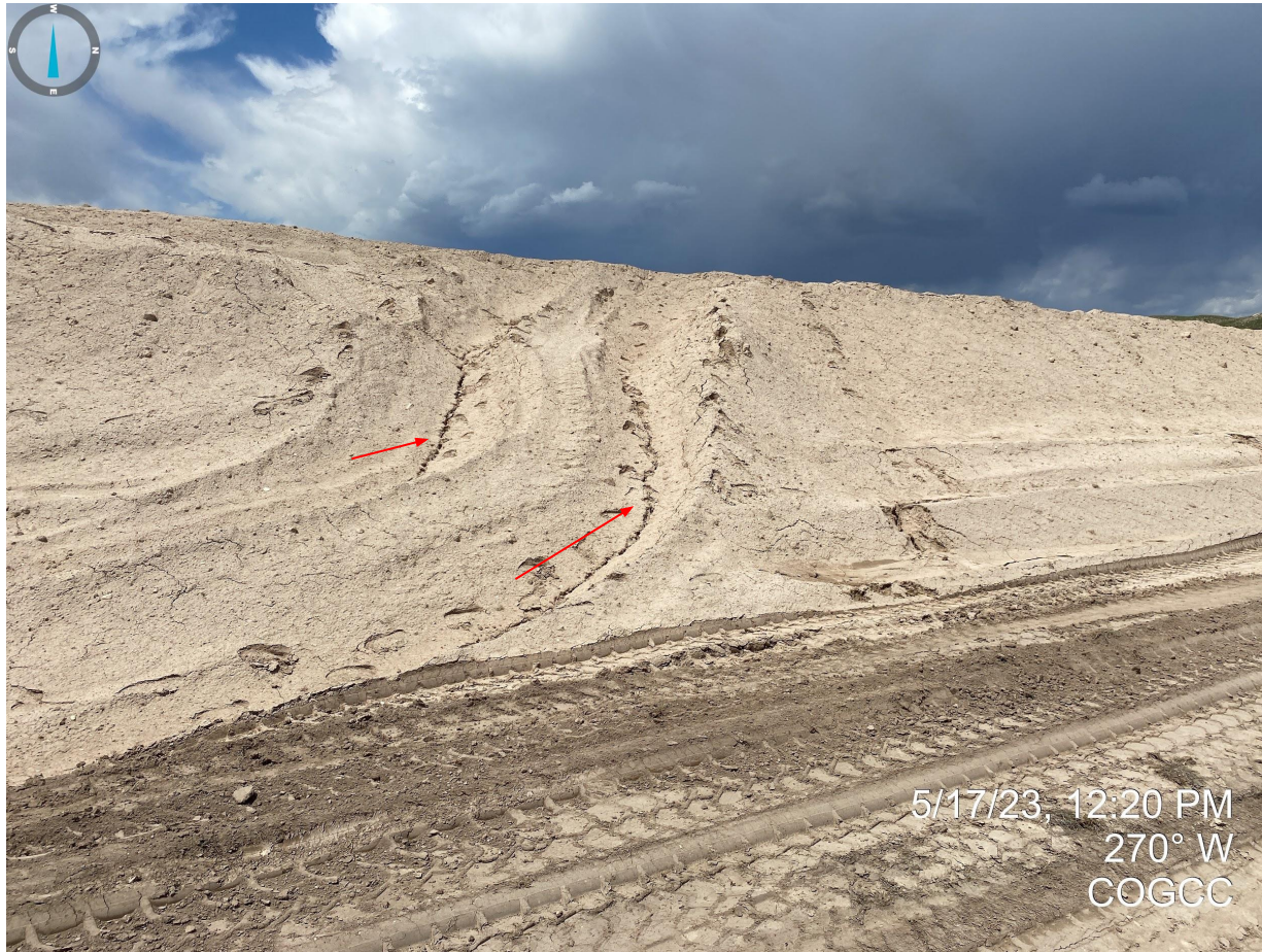
Photo 8. East side of stockpile, rill erosion identified. See comments in Photo 5.