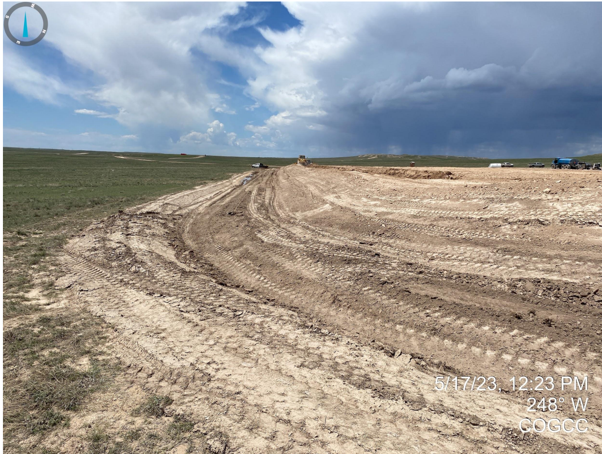
Photo 10. Southeast corner, stormwater ditch and berm pictured. See comments in Photo 2.