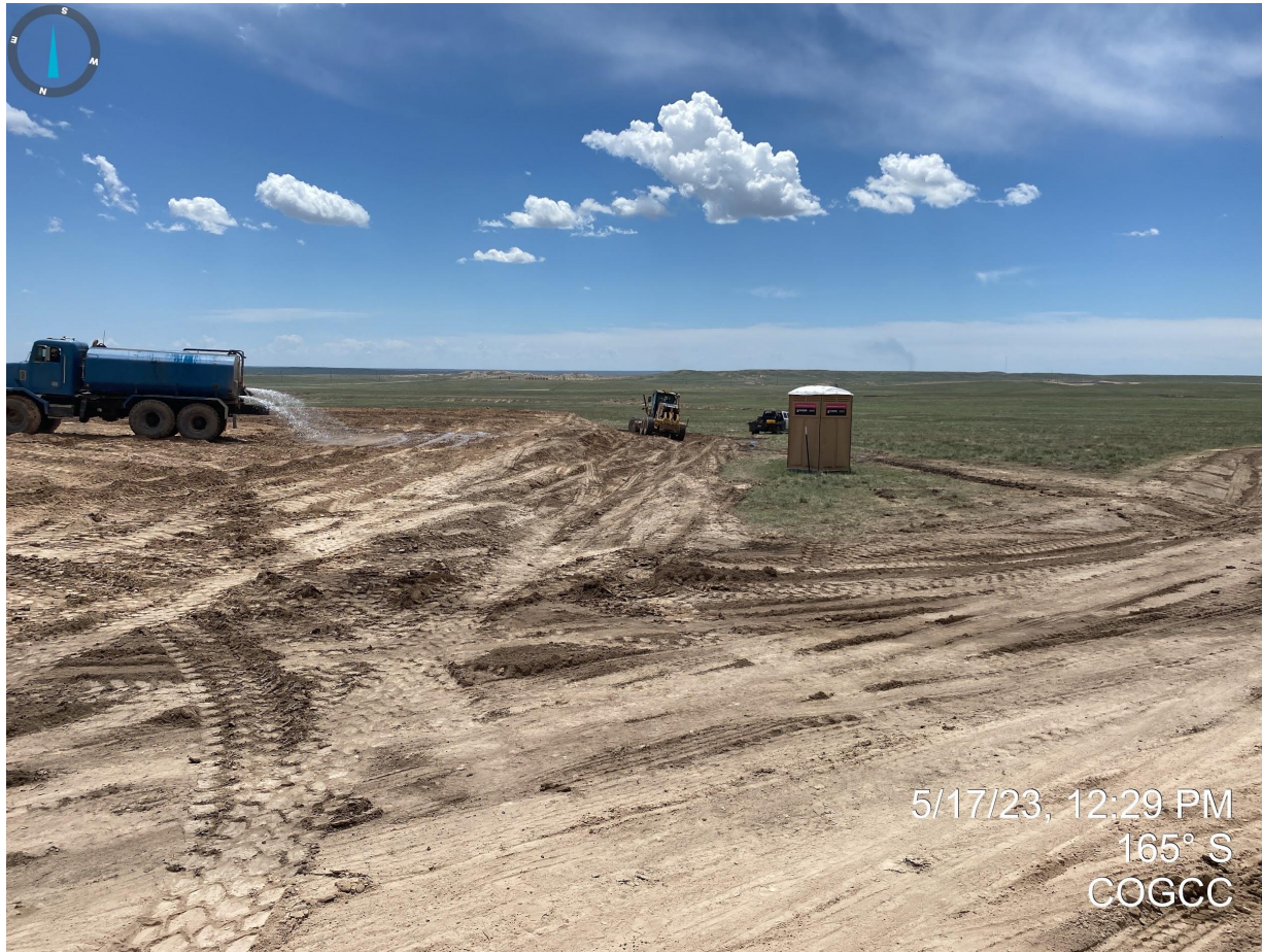
Photo 12. During this inspection, Staff observed a water truck on location to mitigate the fugitive dust occurring from construction activities.