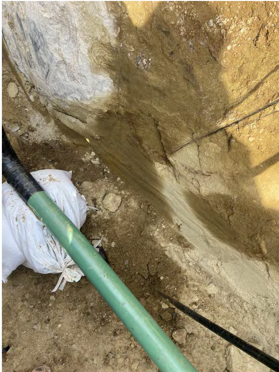
PHOTO NO 2: BOTTOM OF TRENCH AT SAMPLE LOCATION SS_WELLHEAD WHERE VISUAL STAINING WAS OBSERVED.