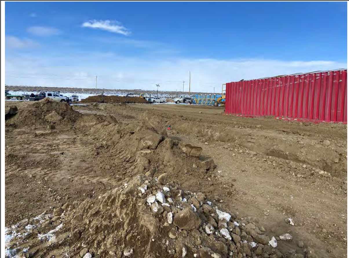
PHOTO NO 6: FULL LENGTH OF PRODUCTION LINE TRENCHING. LOOKING NORTHWEST.