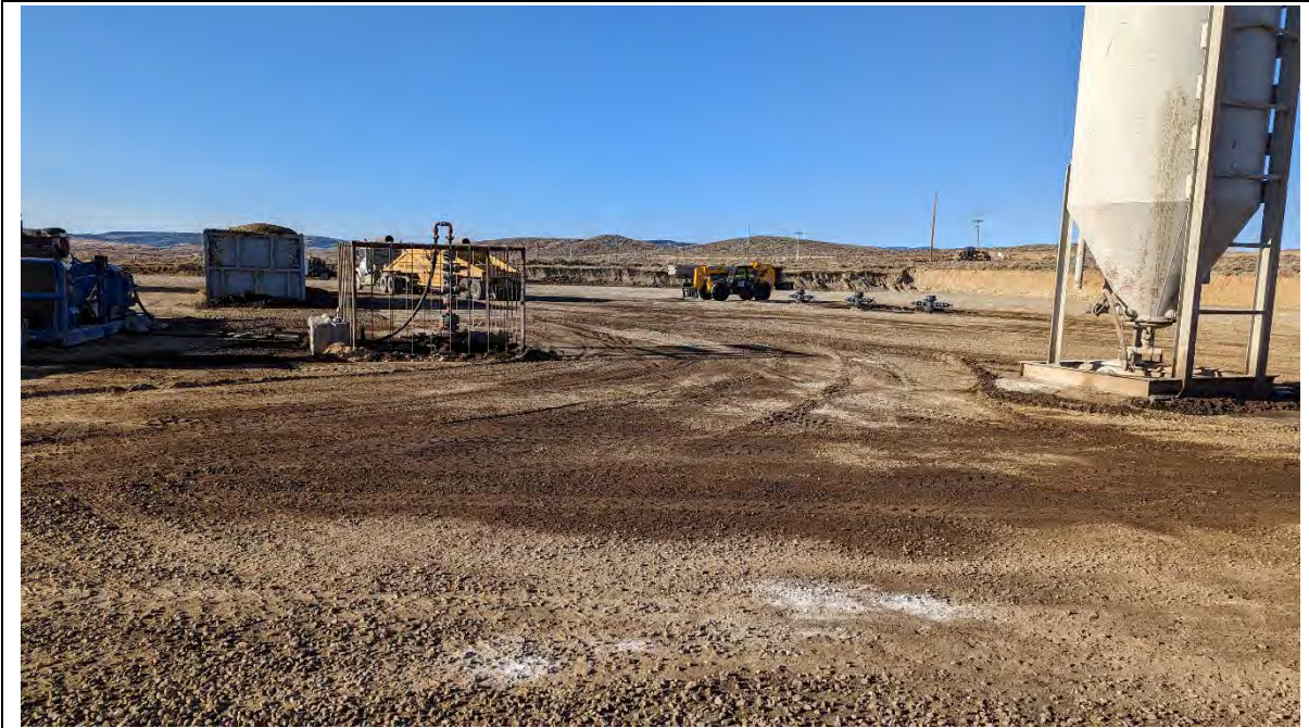
PHOTO NO 7: PAD FACING SOUTHWEST FROM CENTRAL BASE OF TOPSOIL PILE TO NORTHEAST.