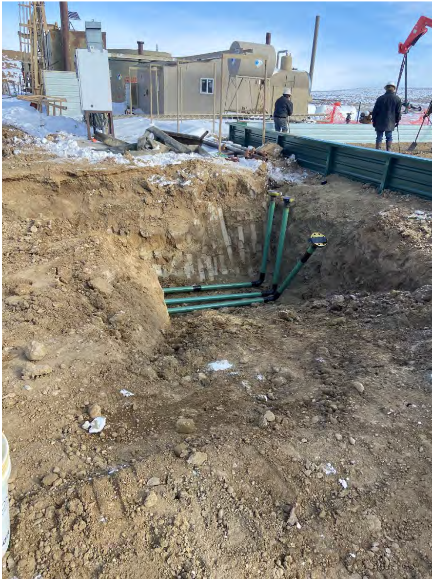
PHOTO NO 4: FAR EASTERN END OF PRODUCTION LINE TRENCHING. SAMPLE LOCATION POINT OF SS_09.