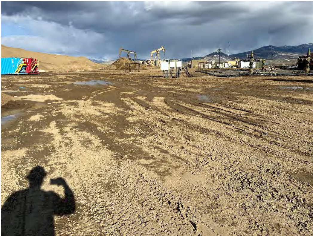
PHOTO NO 2: FACING SOUTHEAST TOWARD WELLHEADS FROM NORTHWEST SIDE OF PAD