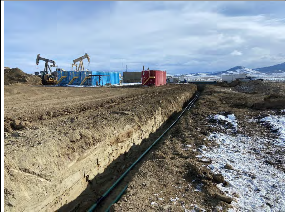
PHOTO NO 5: FULL LENGTH OF PRODUCTION LINE TRENCHING. LOOKING SOUTHEAST.