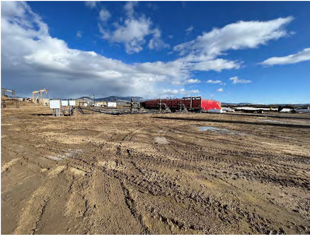
PHOTO NO 1: FACING SOUTH TOWARD WELLHEADS FROM NORTH CORNER OF PAD