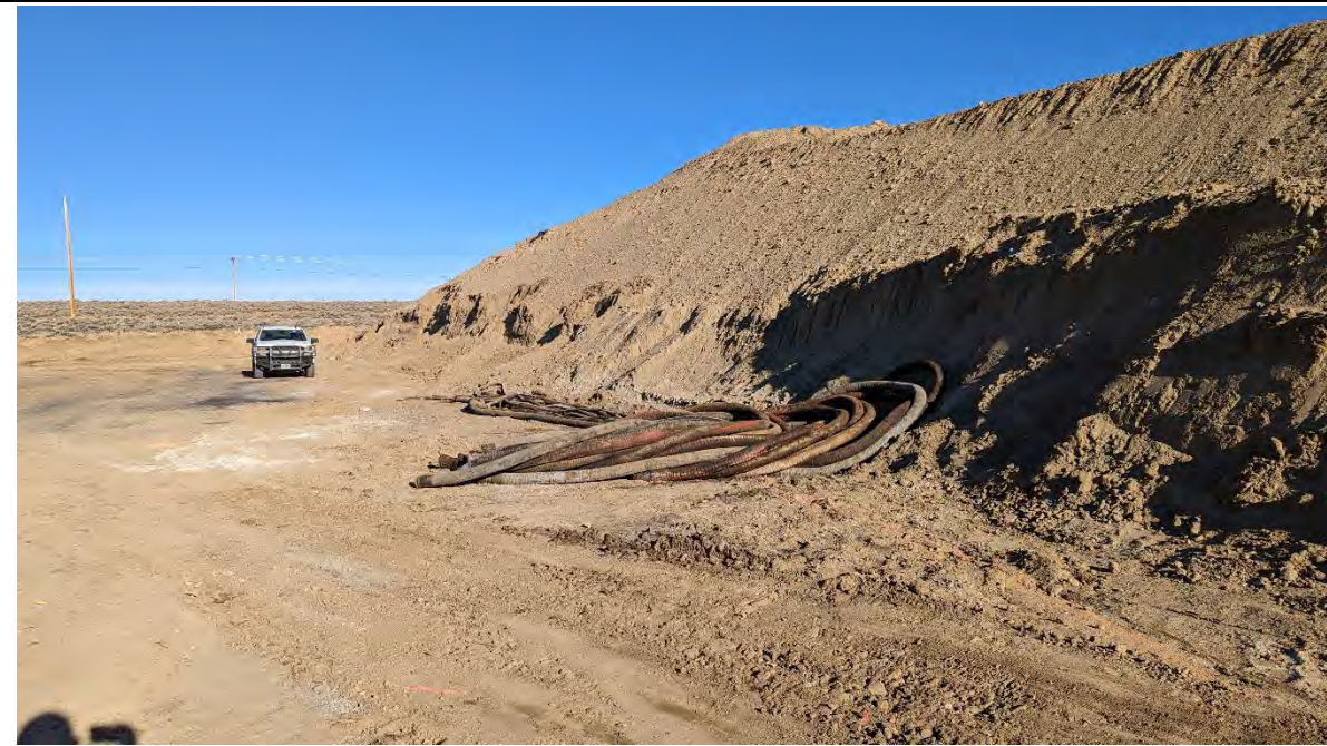
PHOTO NO 11: NORTH END OF BASE OF TOPSOIL PILE TO NORTHWEST FROM PAD.