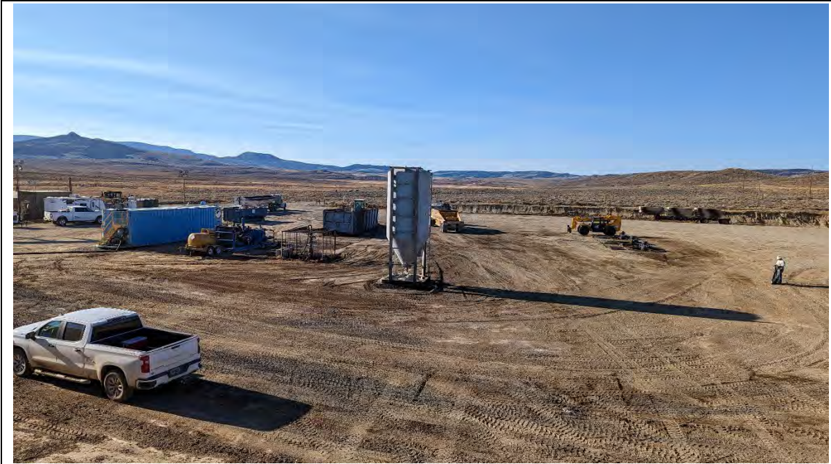
PHOTO NO 1: PAD FACING SOUTH FROM TOP NORTH CORNER OF TOPSOIL PILE TO NORTHEAST.