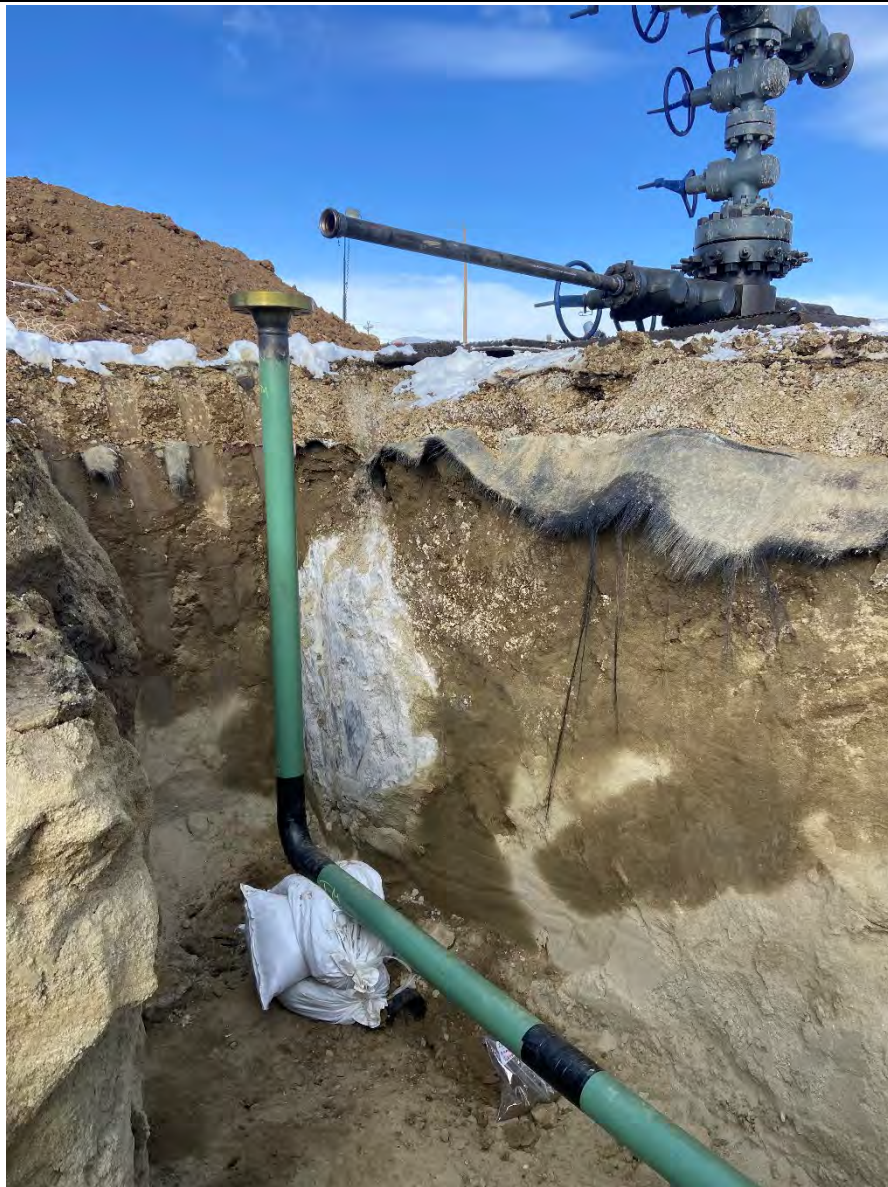
PHOTO No 1: VISUAL STAINING ON SIDEWALL OF NORTHERN MOST WELLHEAD. SAMPLE LOCATION OF SS_WELLHEAD.