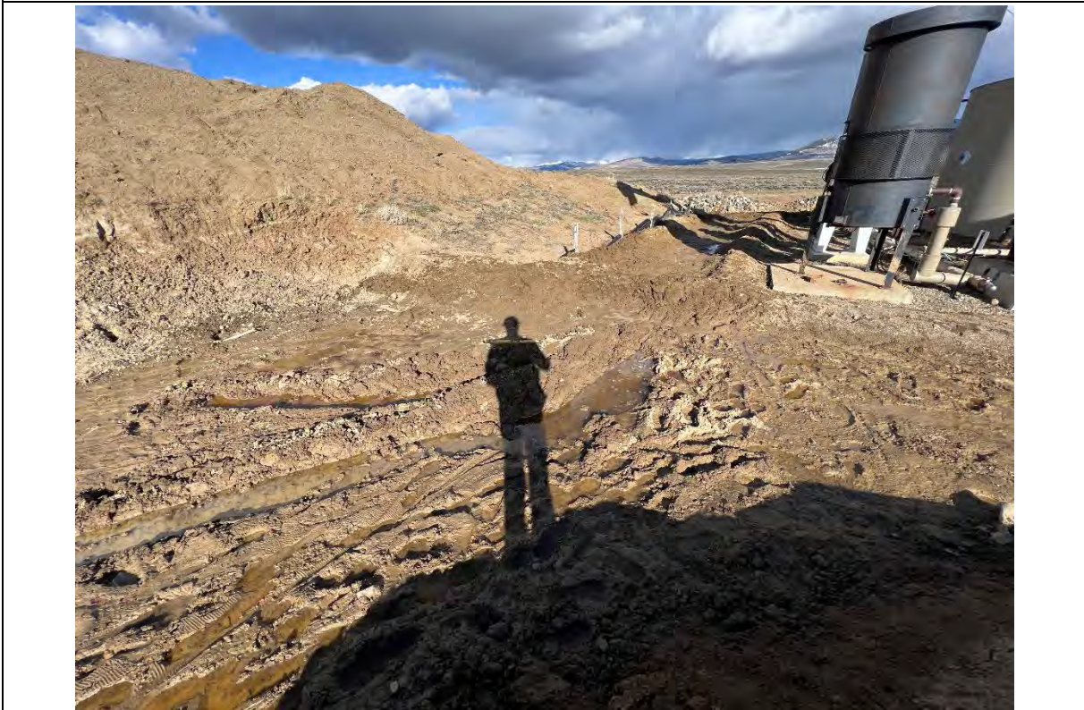
PHOTO NO 4: FACING SOUTHEAST TOWARD FILL PILE AND EQUIPMENT FROM CENTER OF PAD.