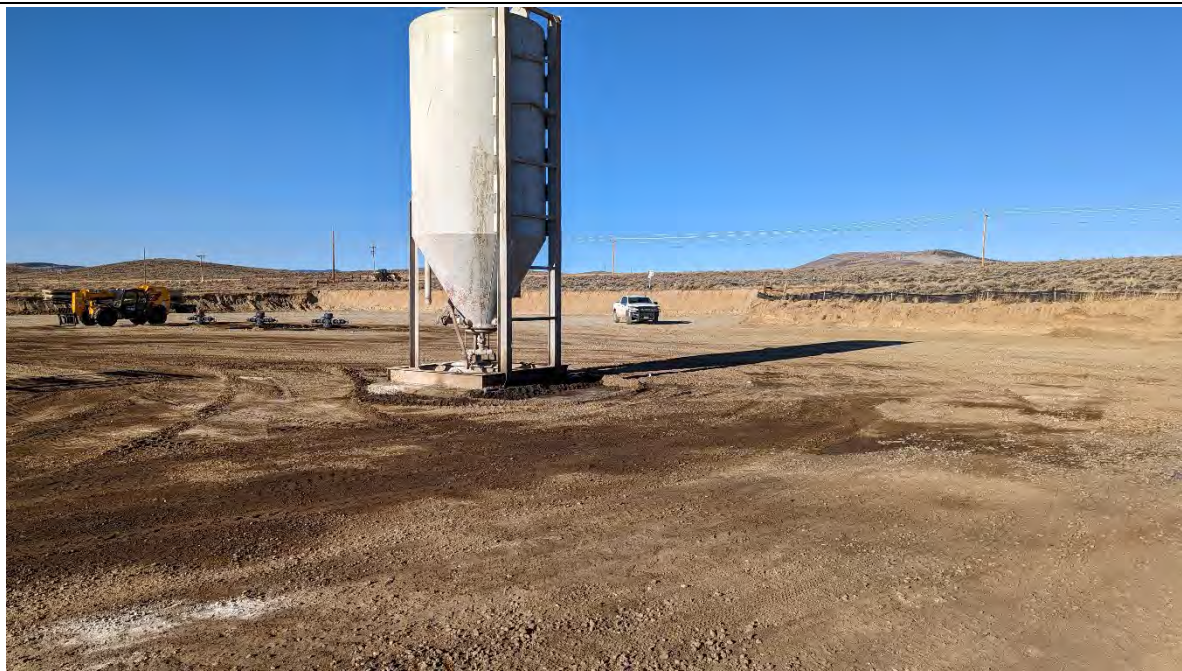
PHOTO NO 8: PAD FACING SOUTH FROM CENTRAL BASE OF TOPSOIL PILE TO NORTHEAST.