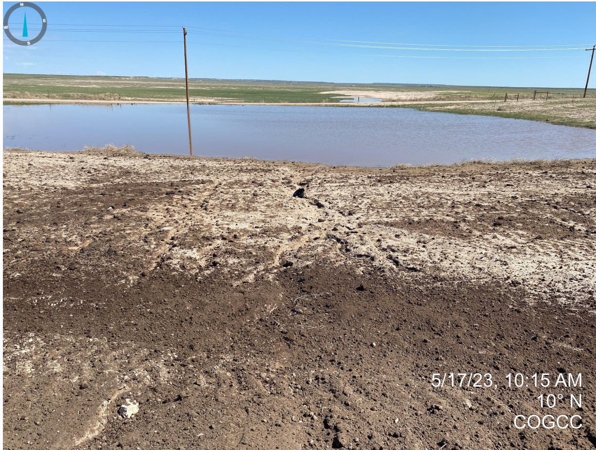
Photo 14. Continued from Photos 12 and 13; see comments in Photo 8.