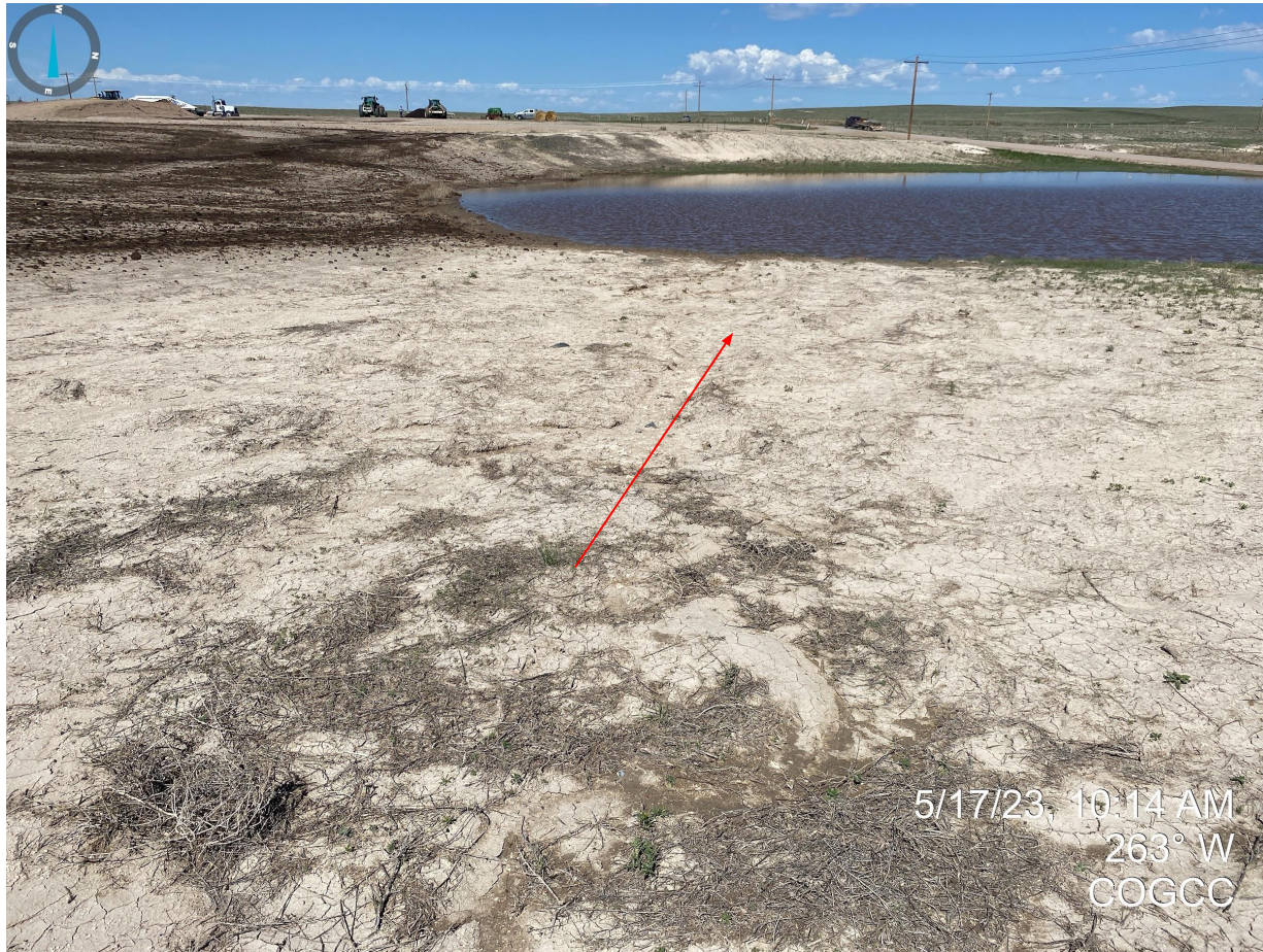
Photo 9. Continued from previous photo, facing west; See comments in Photo 8.