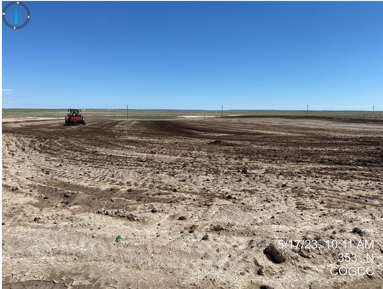
Photo 5. Facing north towards the interim areas. Appears the production area has been reduced in size, topsoil have been placed back to its relative position and recontoured. Crews were observed to be performing reclamation activities at the time of this inspection, therefore this is being left “In-Process”.