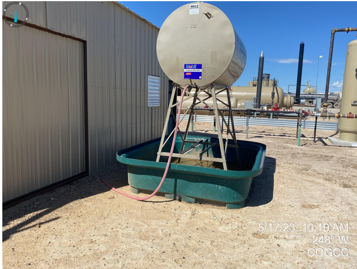
Photo 1. No wildlife netting observed at day tank.