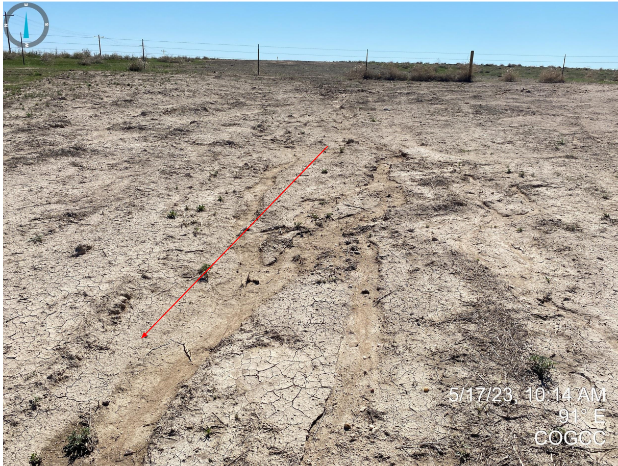
Photo 8. Staff observed that areas being actively reclaimed, and other portions of the location in the northeast corner, had evidence of rill erosion and sediment transport. No apparent stormwater controls were identified on the northeastern portion of the location. More robust stormwater BMPs should be implemented to prevent sediment laden stormwater from entering adjacent lands.