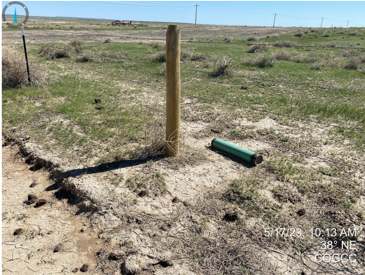
Photo 7. Unused equipment/debris will need to be removed.