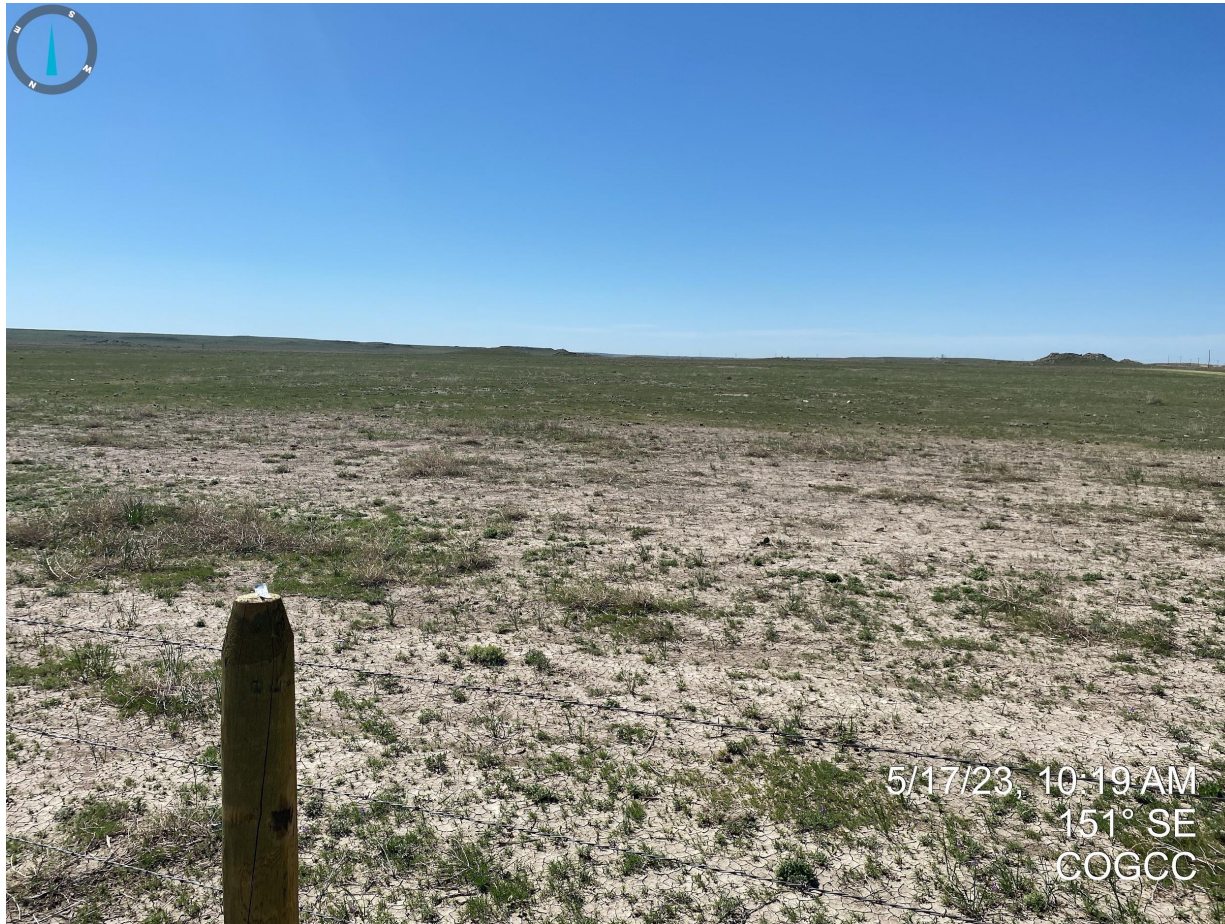
Photo 4. Appears the Operator has removed the trash previously identified.