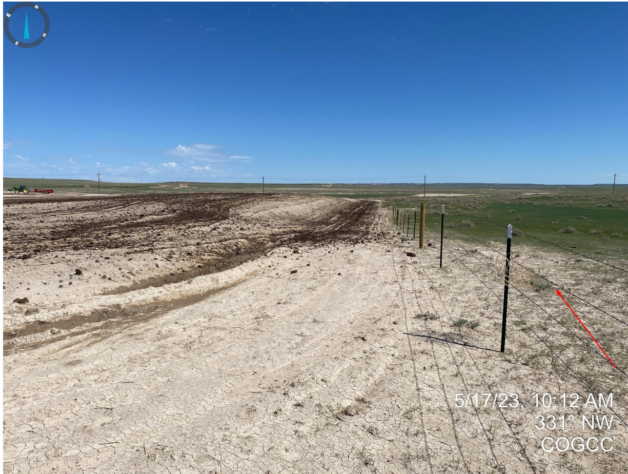
Photo 6. Facing northwest from the southeast corner. No apparent stormwater BMPs were identified around the perimeter of the location or around the topsoil stockpile. Blow sand evident and is indicated by red arrow.