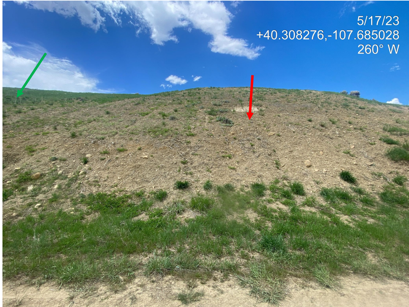
Photo 2. Photos taken from the center of the location shows the slope to the west is insufficiently vegetated.