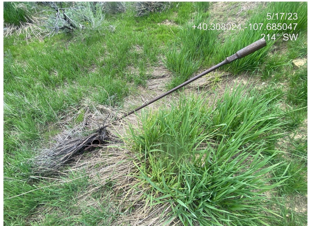
Photo 4. Photos show examples of debris found throughout the location.