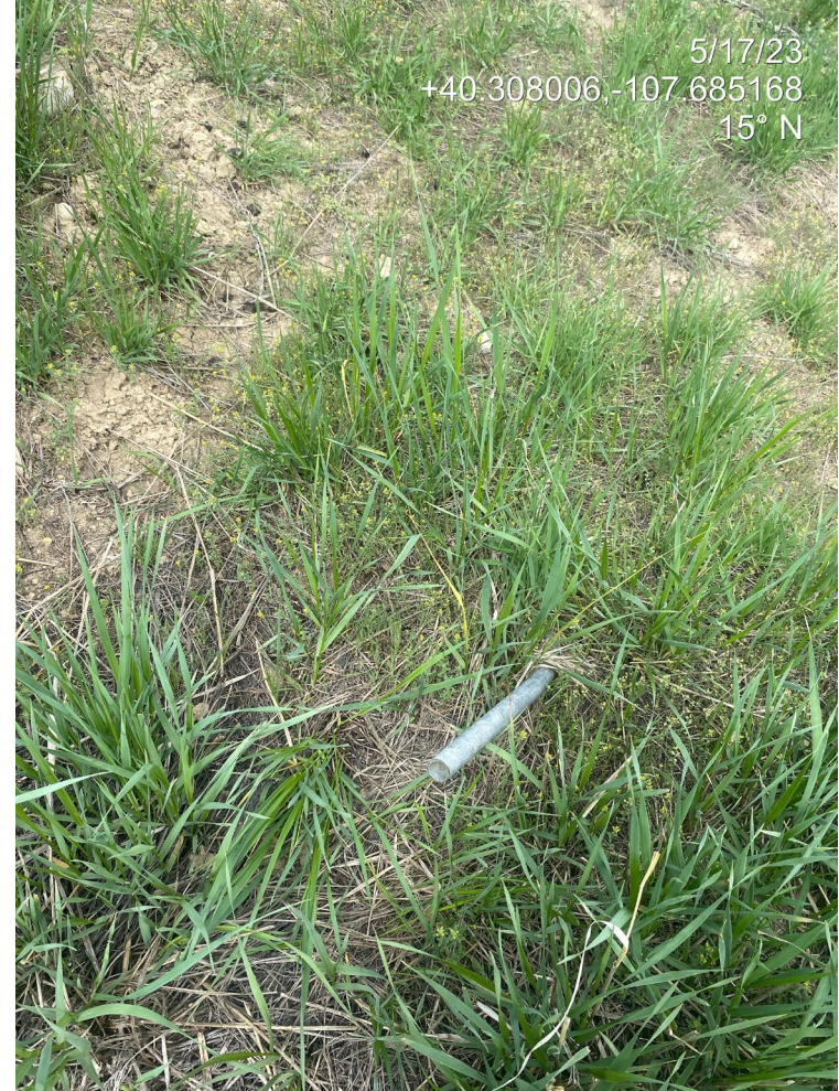
Photo 6. Photos show examples of debris found throughout the location.