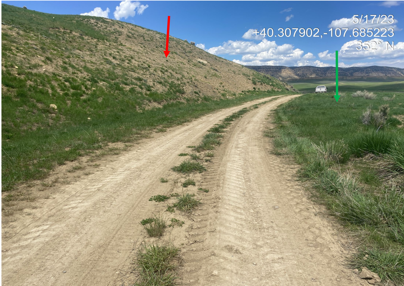
Photo 1. Photos taken from the south shows an overview of the drive-through location. Note reclaimed areas to the right and slope insufficiently vegetated compared to reference to the left.