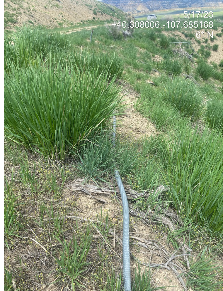
Photo 7. Photos show examples of debris found throughout the location.