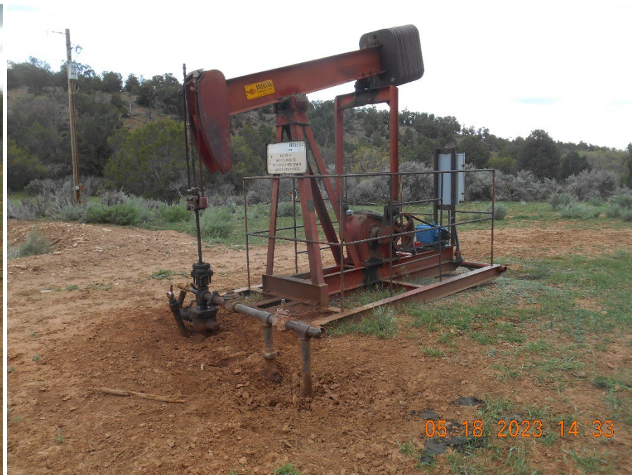
Wellhead with pump jack.