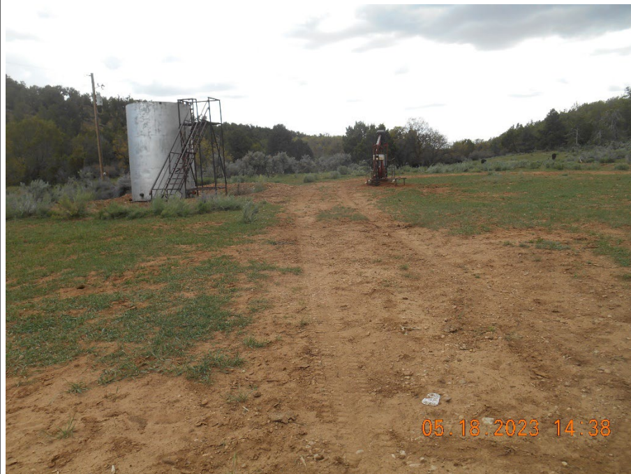
Location overview looking S