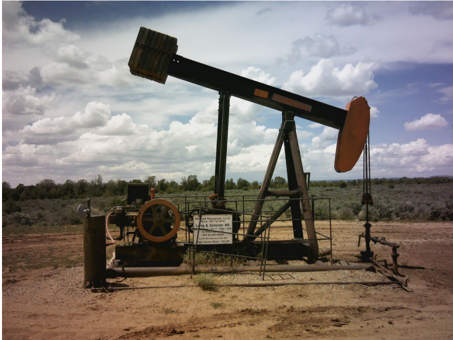
Pump jack with fence