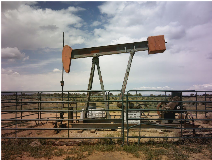
Pump jack with fence