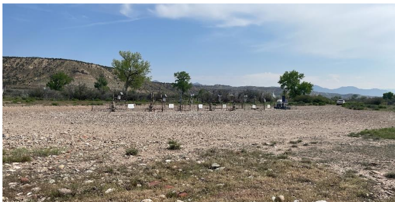
South West corner of location.