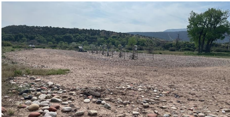
North West corner of location.