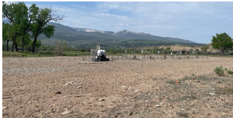
North East corner of location.