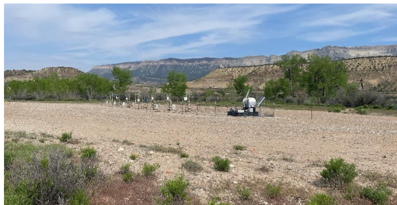
South East corner of location.