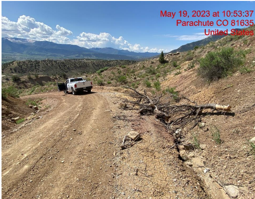
Lease Road Degradation – Photo #03628