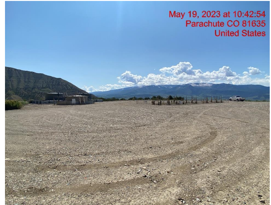
NW Corner of Location – Photo #03611