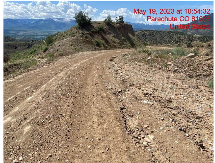
Rill Erosion Transporting Sediment – Photo #03629