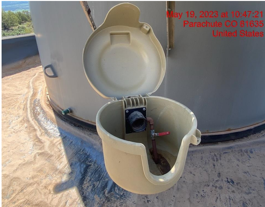
Open-Ended Load Line – Photo #03623