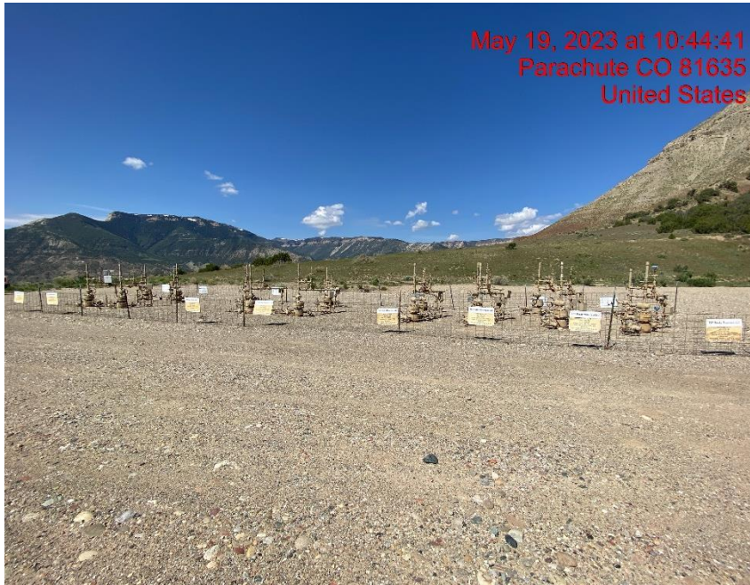
Wellheads – Photo #03614