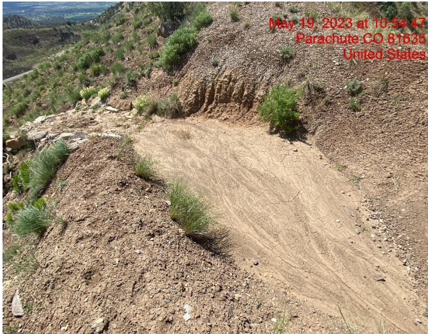
Sediment Trap Full & Needs Maintenance– Photo #03630