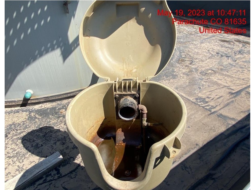
Open-Ended Load Line – Photo #03622