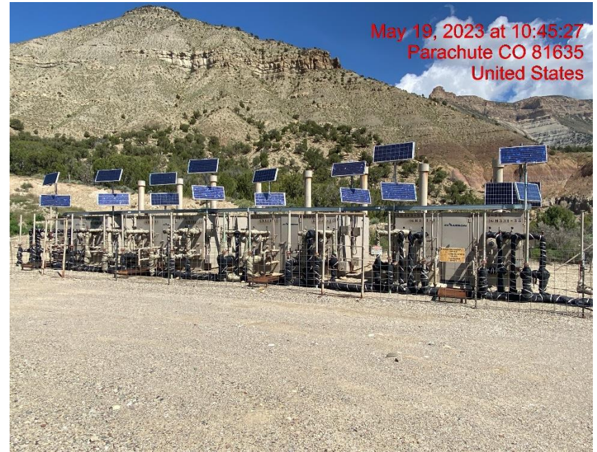
Separators – Photo #03616