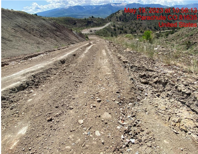
Rill Erosion/Degradation – Photo #03623