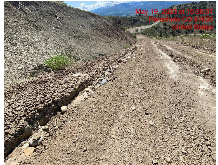
Rill Erosion Transporting Sediment – Photo #03632