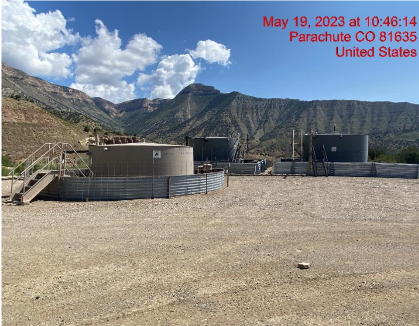
Tank Battery – Photo #03617