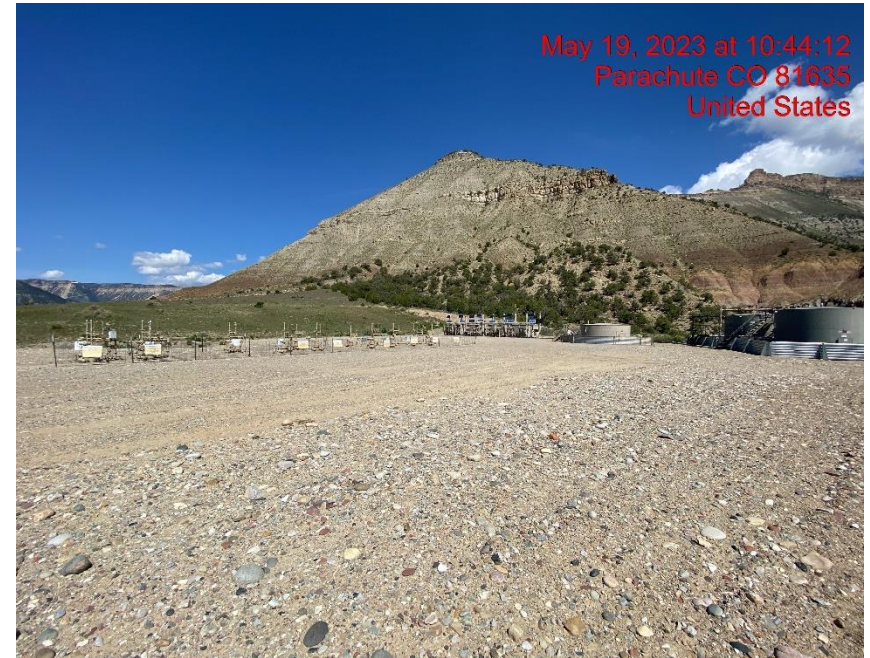
SE Corner of Location – Photo #03613