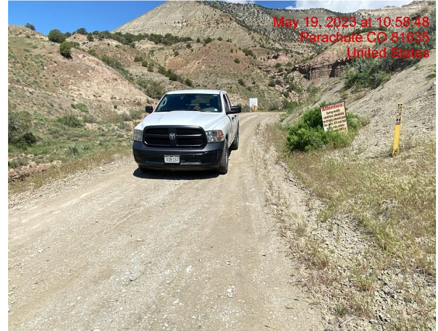
Insufficient Vehicle Tracking BMPs at Location Entrance/Exit – Photo #03636