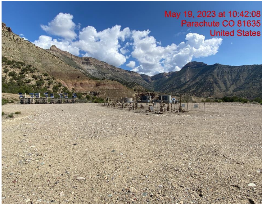
SW Corner of Location – Photo #03610