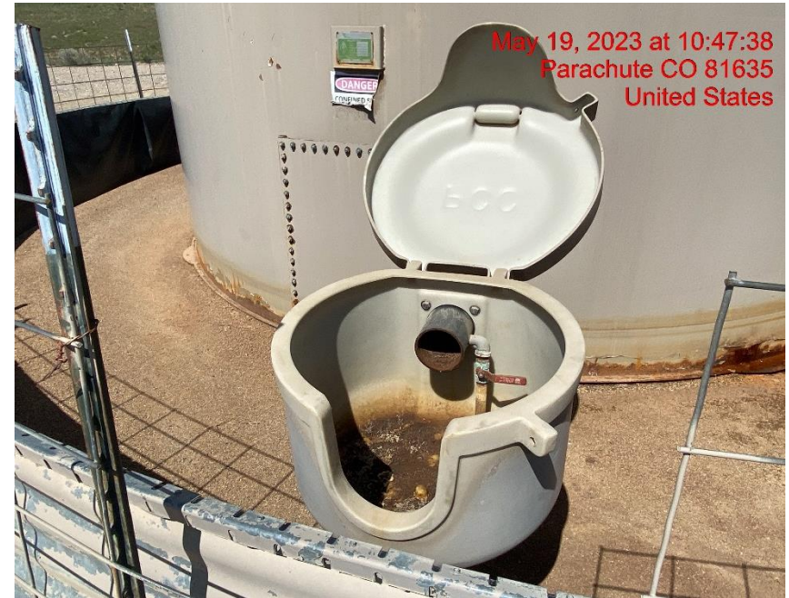
Open-Ended Load Line – Photo #03624