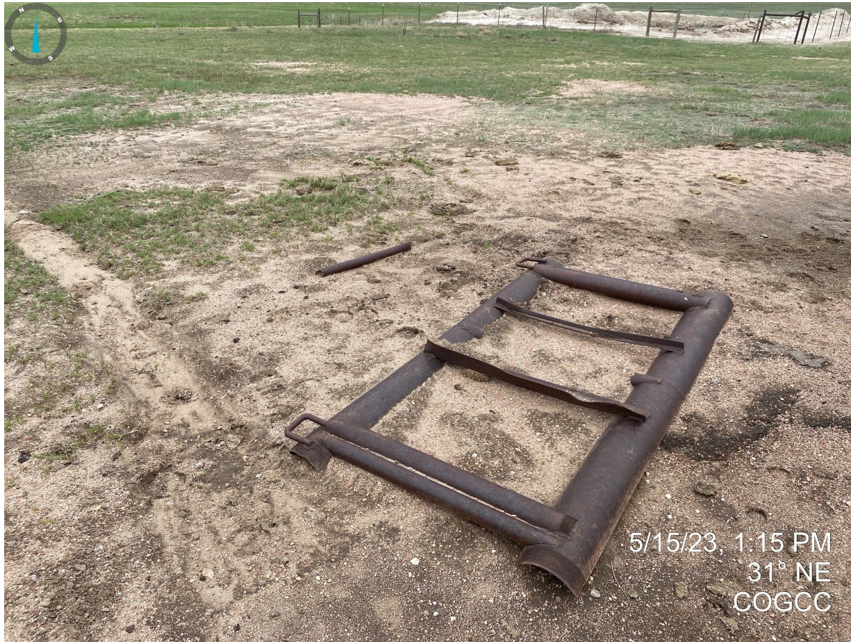
Photo 15. Road drag/maintainer observed being stored on location. Equipment cannot be stored on location.