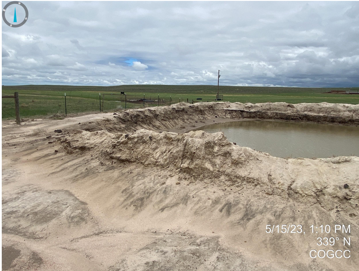
Photo 6. Pit berms/walls do not appear to be properly stabilized as unconsolidated material and rill erosion was evident throughout. As a result, sediment laden stormwater exited outside of the fenced areas onto adjacent lands. More robust stormwater BMPs will need to be implemented to stabilize the material.