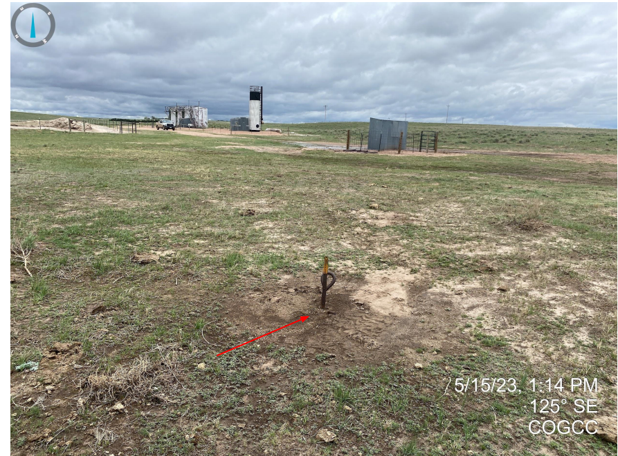
Photo 13. Guy line anchors do not appear to be properly marked.