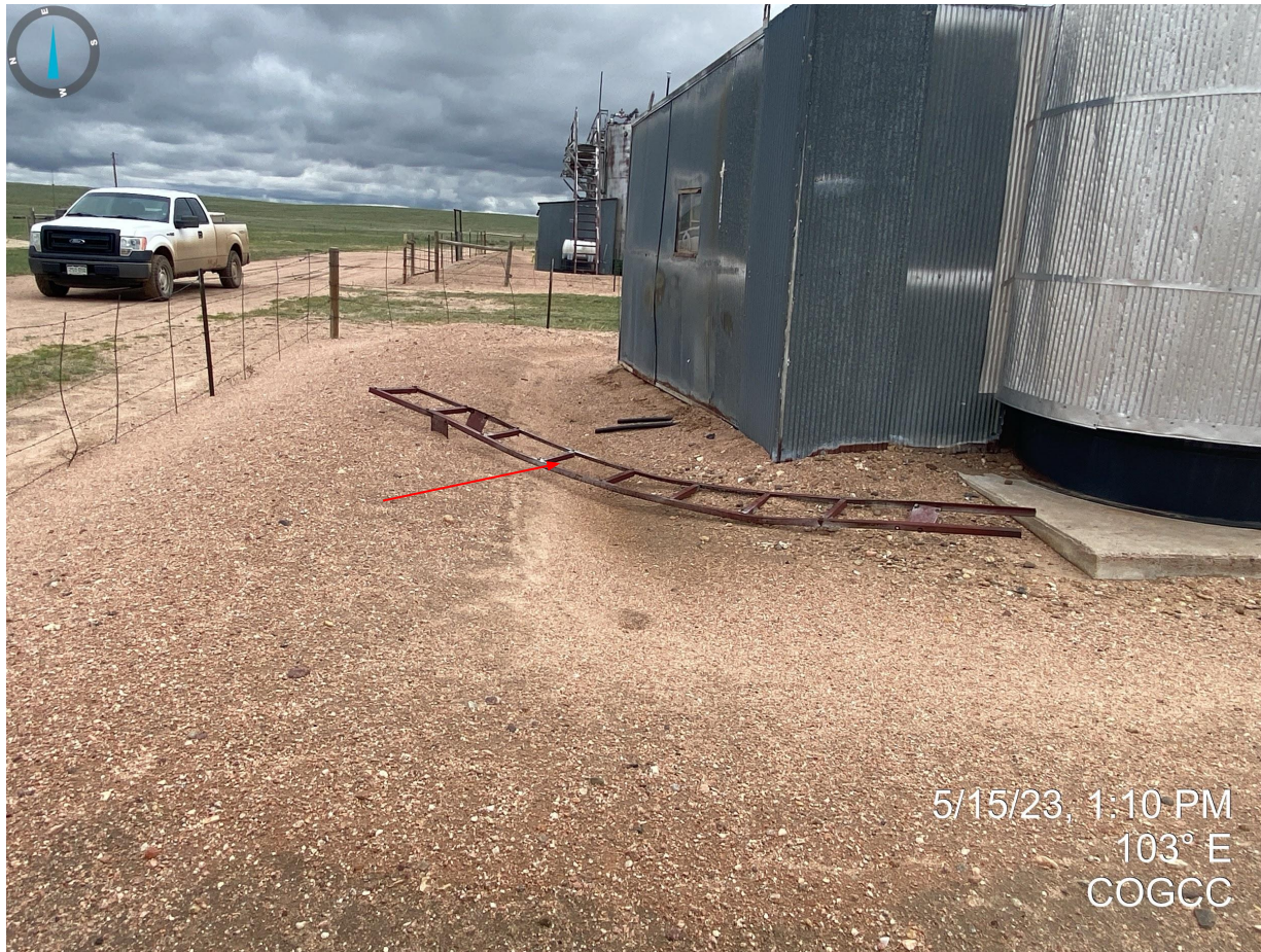
Photo 5. Unused equipment will need to be removed.