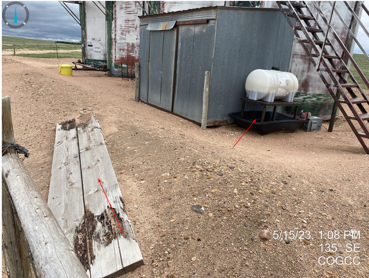
Photo 1. Wood debris will need to be removed; day tank near shed does not appear to have wildlife exclusion device installed.