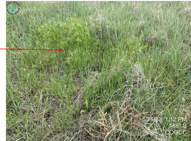
Photo 12. Cheatgrass, a Colorado List C Noxious Weed will need to be managed for immediately to prevent spread onto adjacent rangeland. Other undesirable vegetation (e.g. kochia and russian thistle) was observed throughout the location and will also need to be managed.