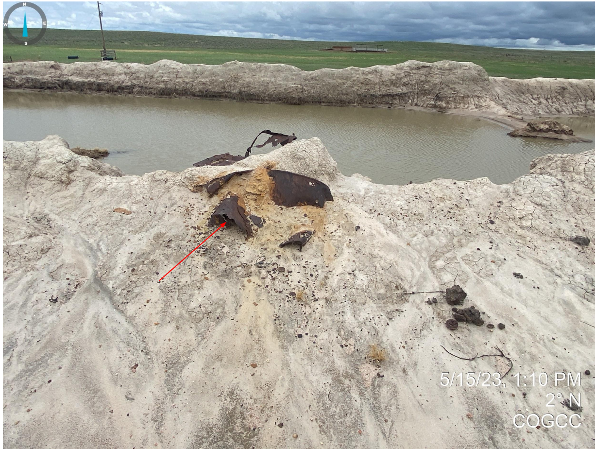
Photo 8. Metal debris observed buried in pit walls will need to be removed.