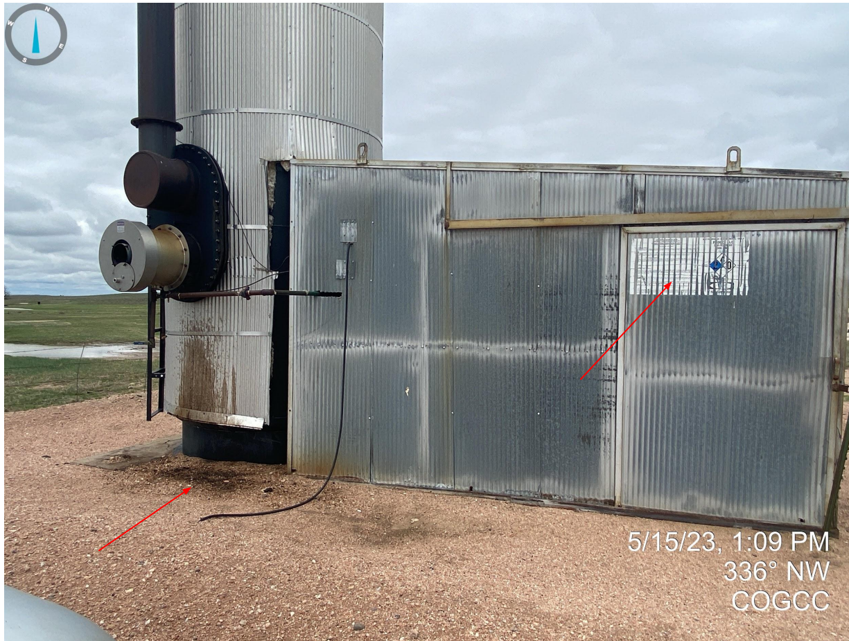
Photo 4. Stained soil will need to be properly cleaned up and disposed of. See comments in Photo 2 for label/placard.