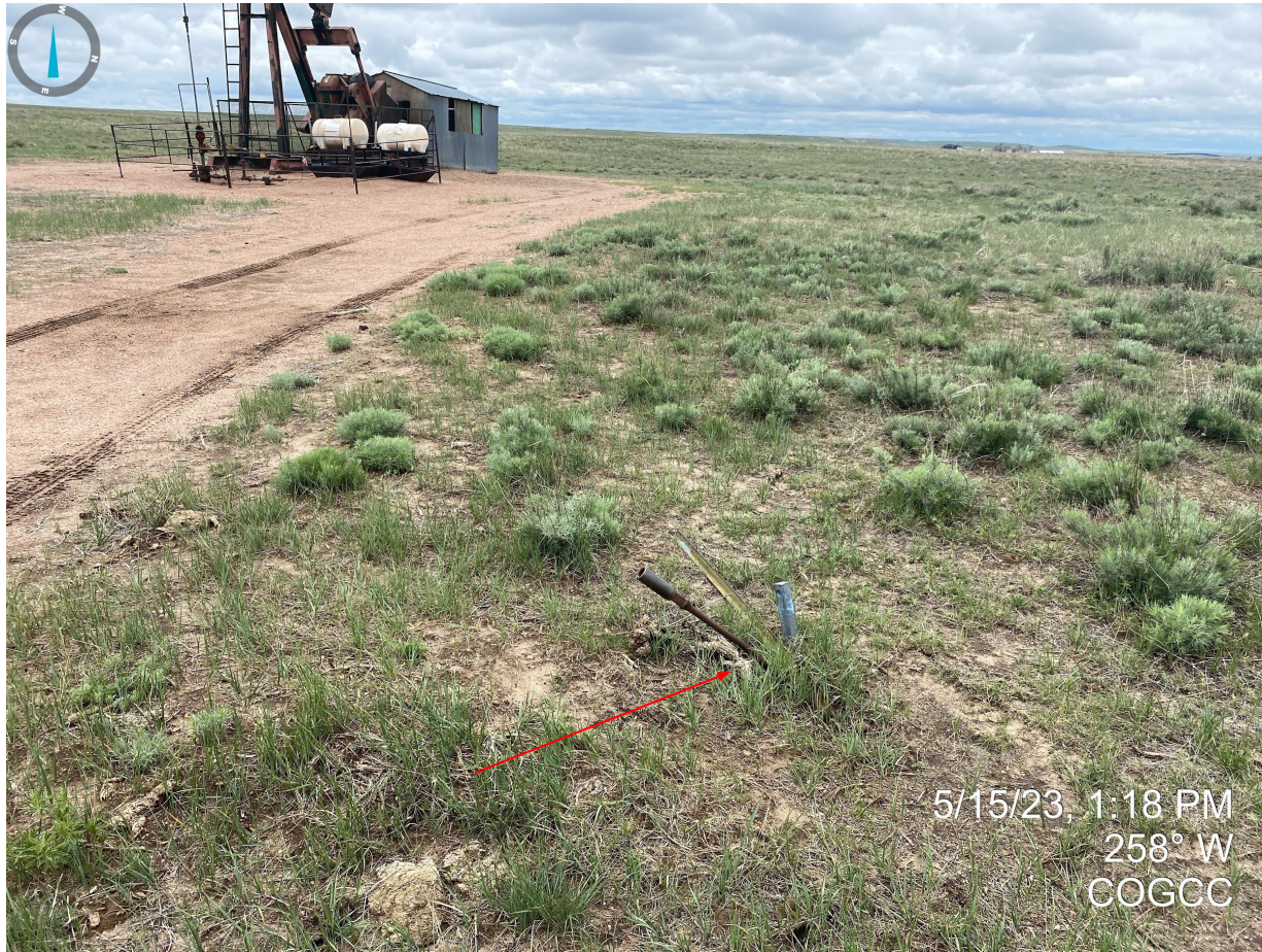
Photo 1. Interim reclamation areas appear reflective of the reference areas at the time of this inspection. Guy line anchors do not appear to be properly marked.