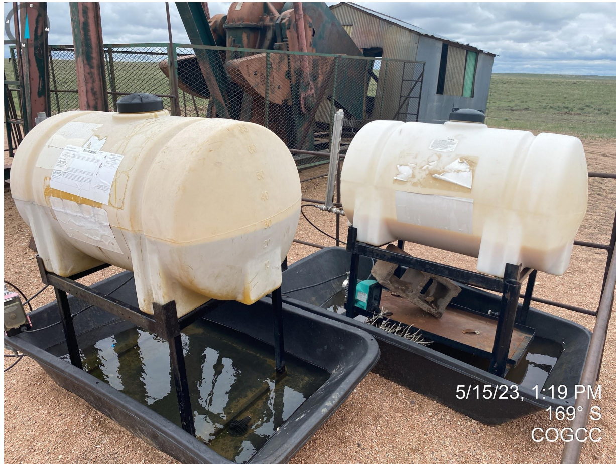
Photo 5. Day tanks at wellhead do not appear to have any wildlife exclusion devices installed.