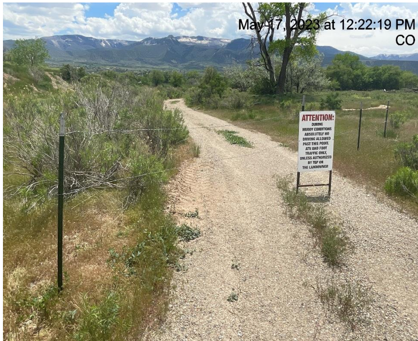
Photo # 7913 Access road has been fenced off & sign placed in the middle of the access road