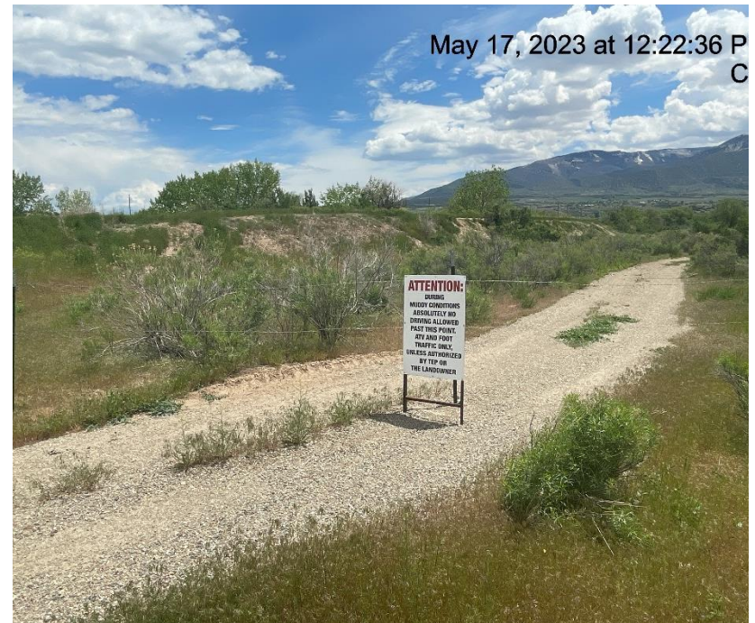
Photo # 7914 Access road has been fenced off & sign placed in the middle of the access road