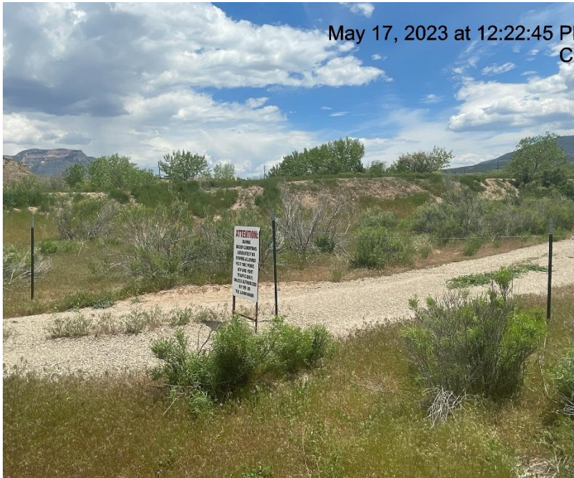
Photo # 7915 Access road has been fenced off & sign placed in the middle of the access road