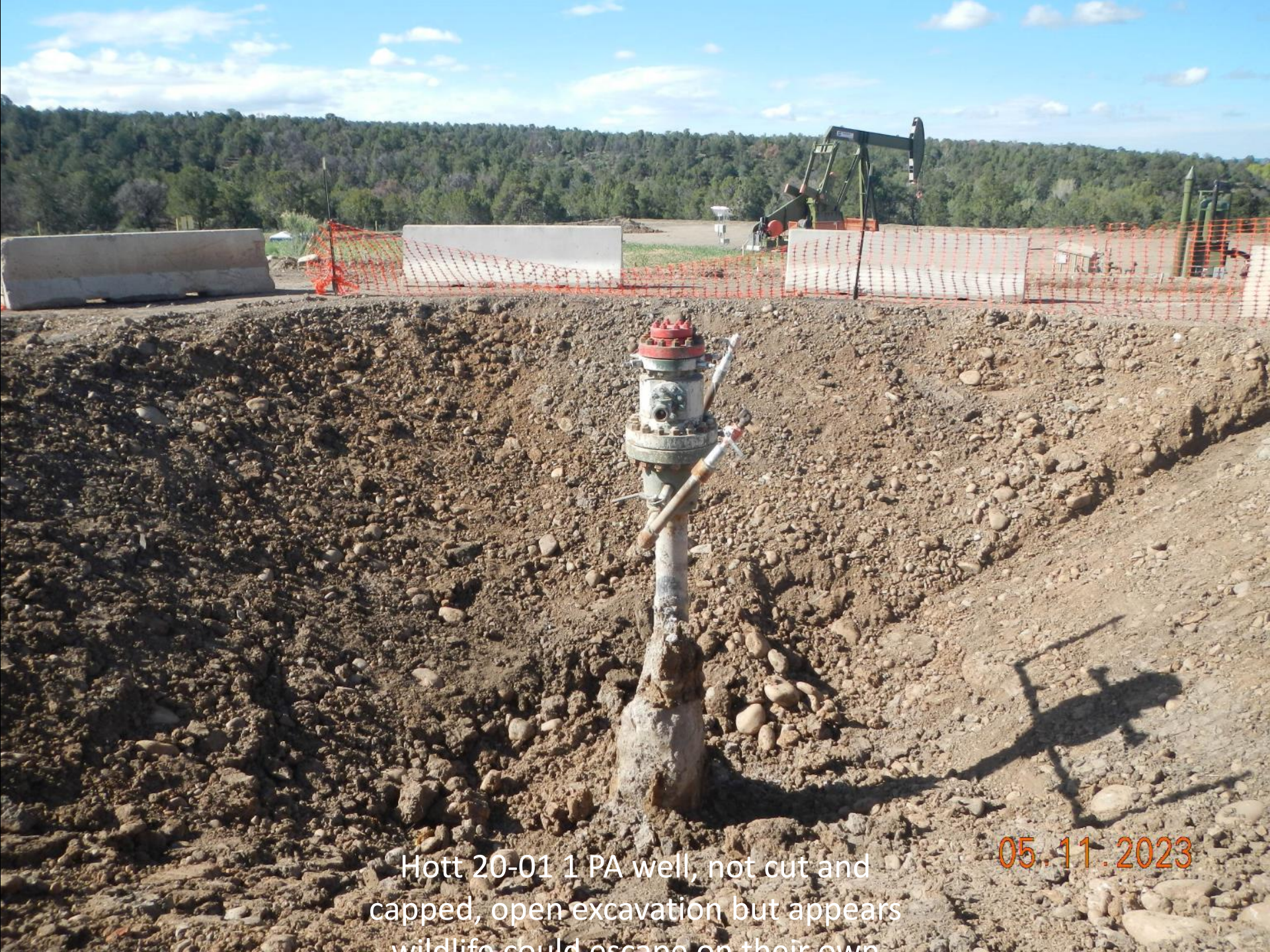
Hott 20-01 1 PA well, not cut and capped, open excavation but appears wildlife could escape on their own