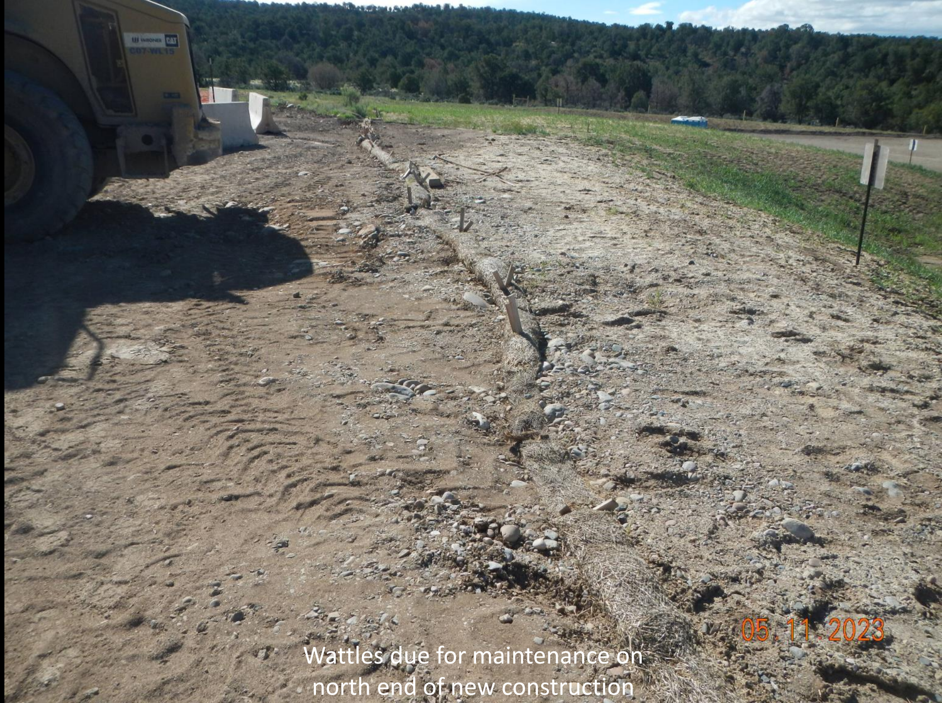
Wattles due for maintenance on north end of new construction