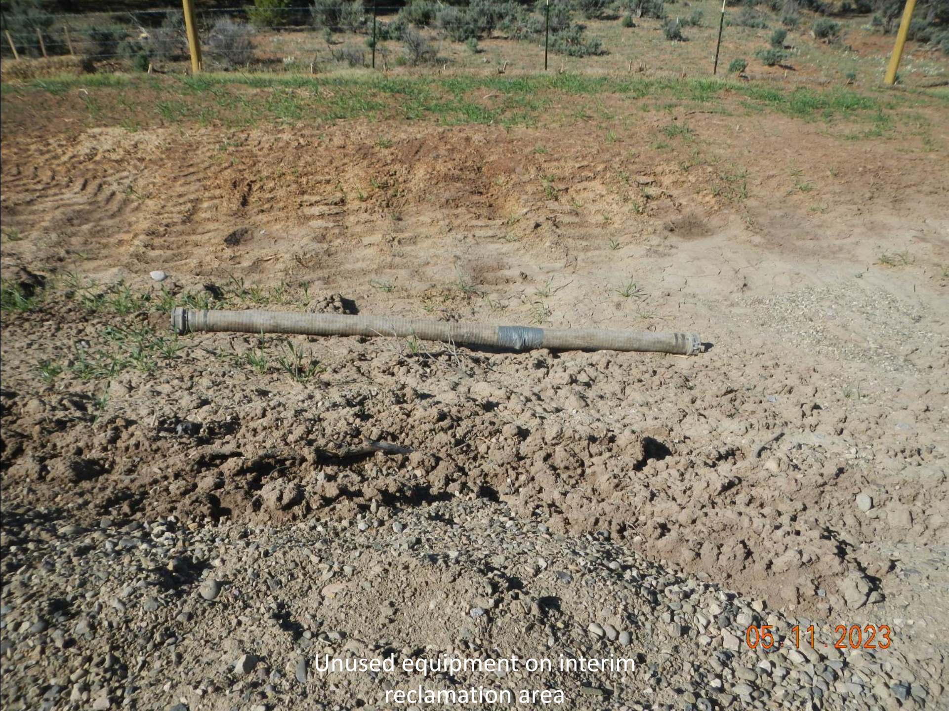
Unused equipment on interim reclamation area