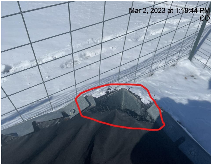
Photo # 1514 From inspection 708900066 conducted on 03/02/2023 Containment needs maintenance