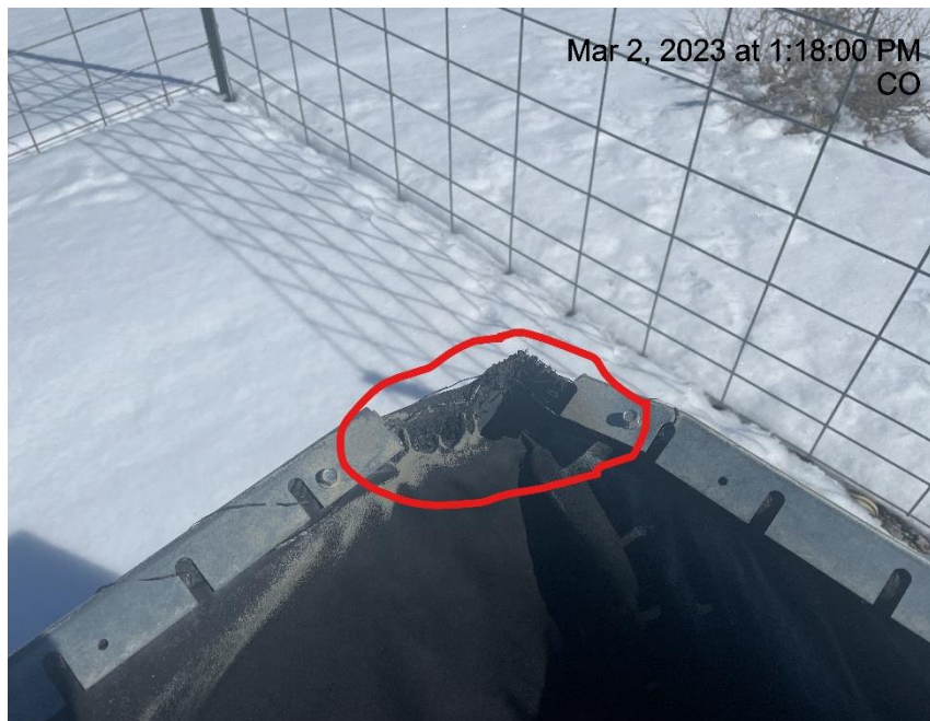
Photo # 1511 From inspection 708900066 conducted on 03/02/2023 Containment needs maintenance