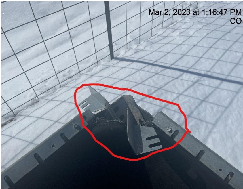
Photo # 1507 From inspection 708900066 conducted on 03/02/2023 Containment needs maintenance