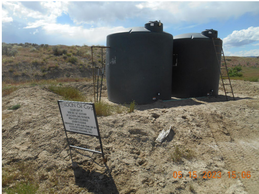
Produced Water tanks. No tank labels