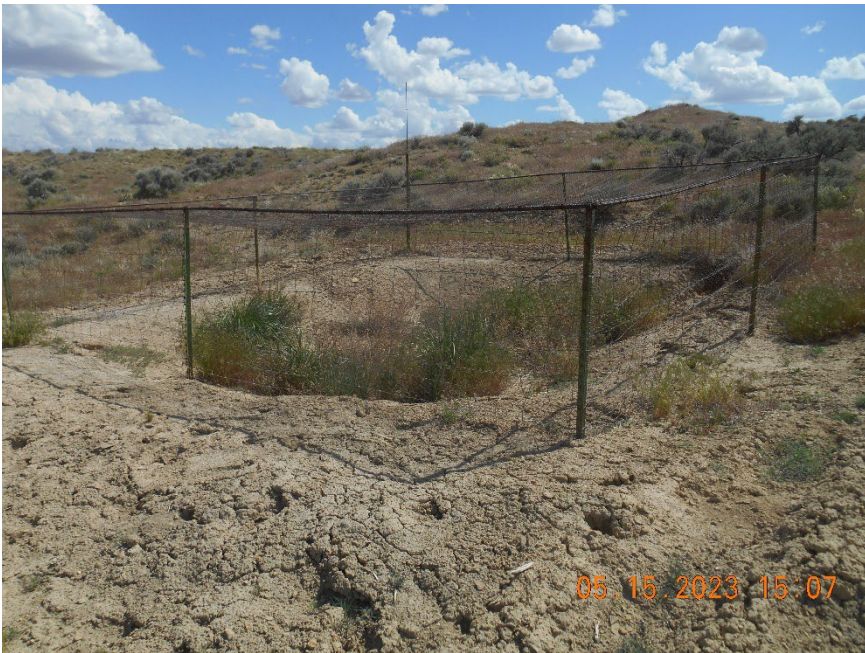
Blowdown pit with fence