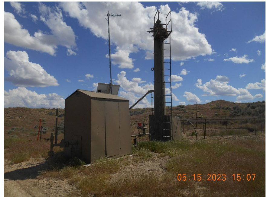
Meter housing and Dehydrator