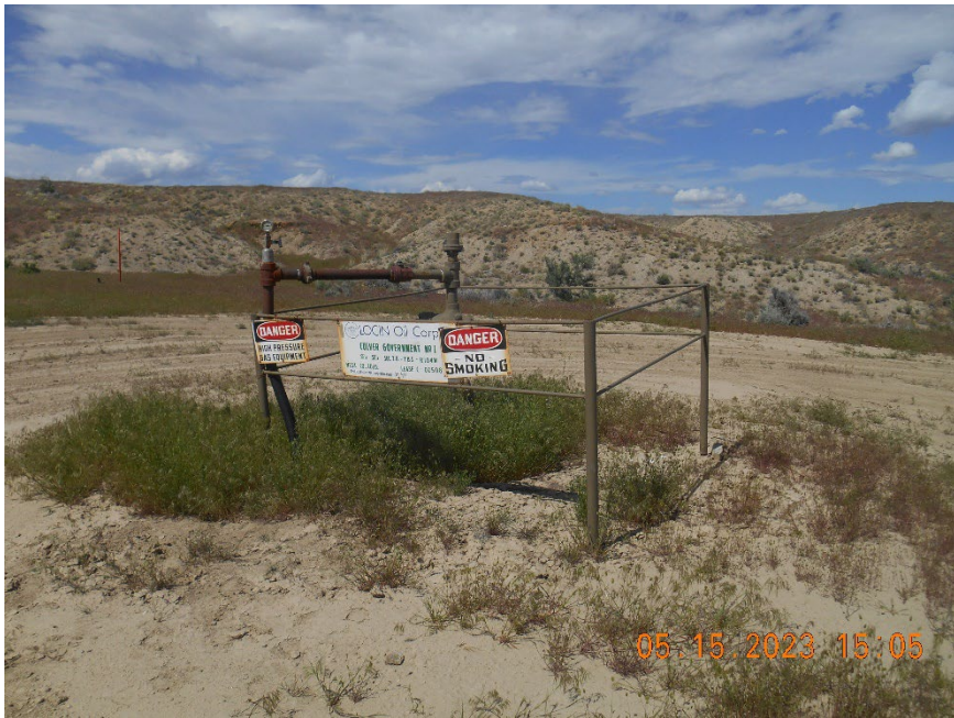
Wellhead with fence and sign removed for construction